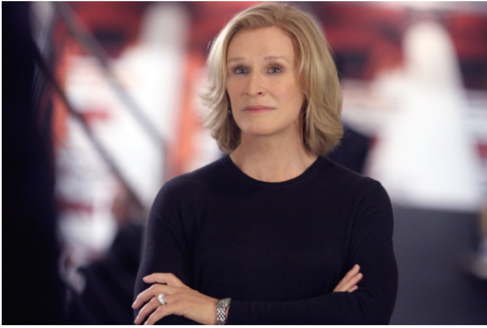
Glenn Close as stars as Patty Hewes on Damages airing on Wednesday, Jan. 14 (10 pm e/p) on FX.

The first episode of the second season of "Damages" - "I Lied, Too" - is a little cluttered, answering some questions from the last season and setting up new ones, but the show quickly settles into an interesting groove in the second episode and especially the excellent third episode. It's great to see the focus of the show switch and easily survive the transition from the Frobisher case to the Purcell one. How many series could survive the loss of its Best Supporting Actor winner (Ivanek) and the switch of focus away from his fellow nominee (Danson) and not only feel as good but arguably better? It's a testament to the writing team at "Damages," one of the best on television and one that clearly drew in actors as talented as Hurt, Harden, and Olyphant.