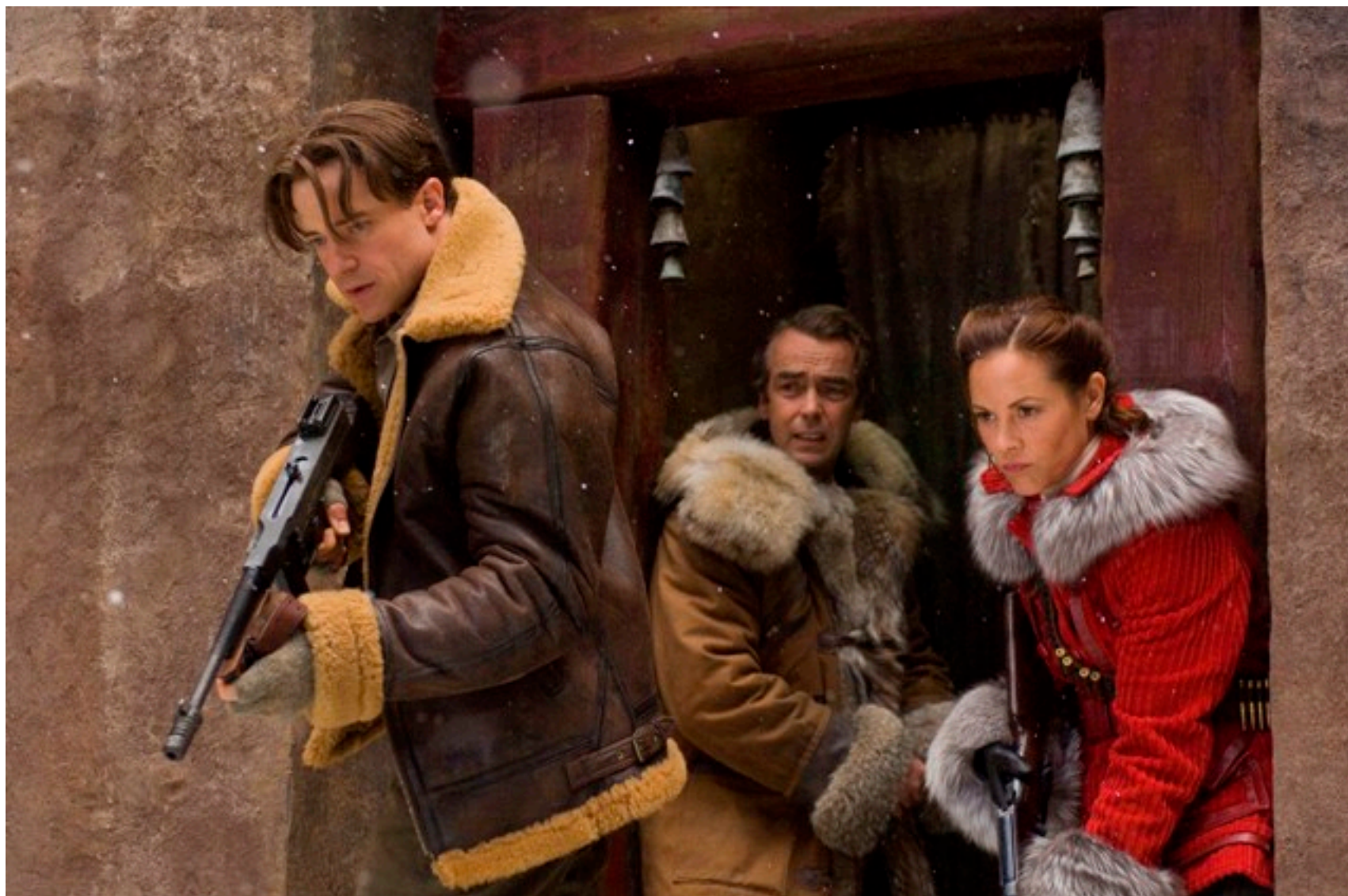
The Mummy: Tomb of the Dragon Emperor is available on DVD/Blu-Ray on December 16, 2008.

As for the movie itself, "Tomb of the Dragon Emperor" is insufferable, boring, and embarrassing to everyone involved (that's assuming that the man who directed "xXx", "Daylight", and "Stealth" can still feel embarrassment).