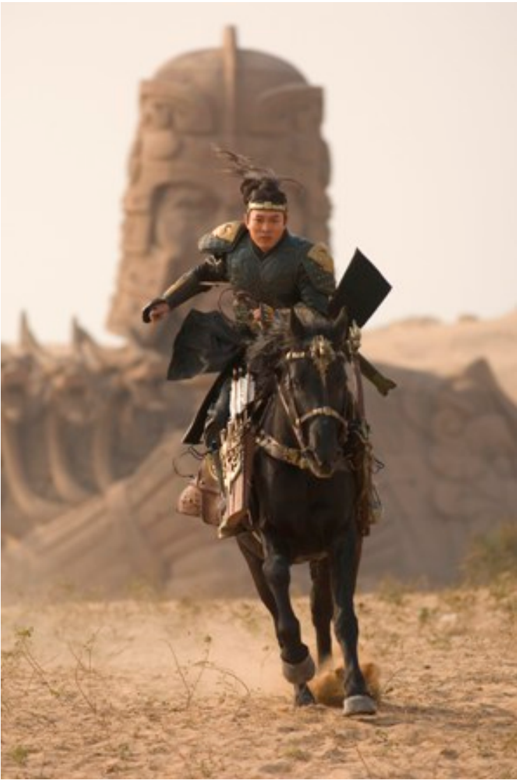
The Mummy: Tomb of the Dragon Emperor is available on DVD /Blu-Ray on December 16, 2008.

"Dragon Emperor" includes the most extensive and detailed U-Control yet produced by the studio. While the movie plays, viewers have the option of watching Rob Cohen's commentary picture-in-picture (it can also just be listened to as an audio track), playing an interactive in-movie trivia game called "The Dragon Emperor's Challenge", exploring the connection between the three "Mummy" movies through film clips and photos in "Know Your Mummy", examining the action from up to four different angles in "Scene Explorer", or watching picture-in-picture behind-the-scenes featurettes related to the on-screen action at the time.