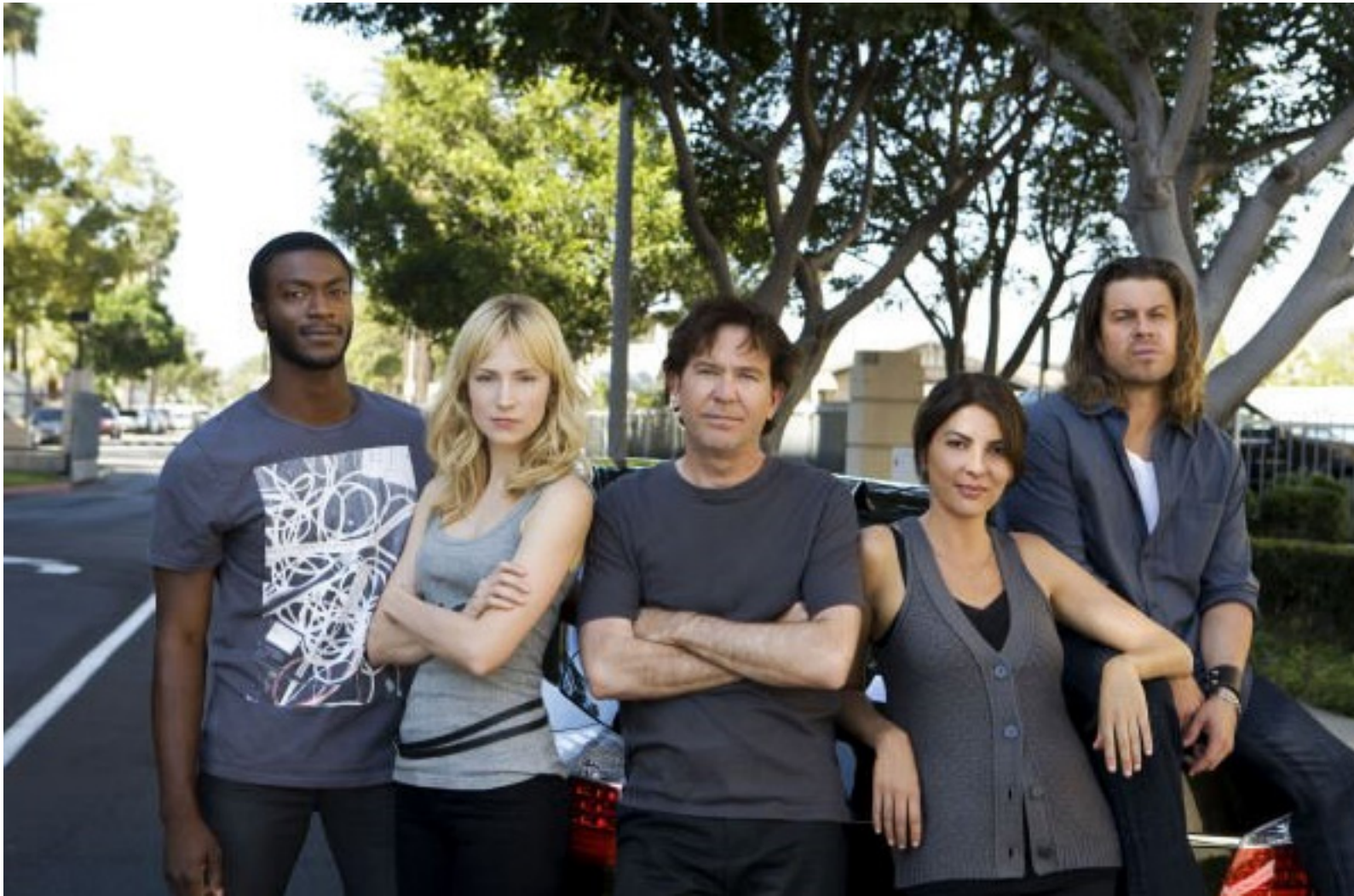
The "Leverage" team from left to right:

Aldis Hodge, Beth Riesgraf, Timothy Hutton, Gina Bellman and Christian Kane.