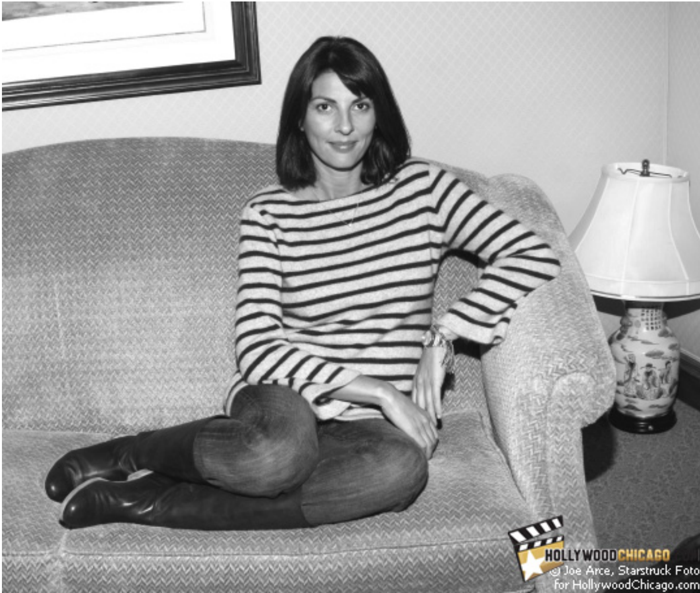
Actress Gina Bellman is photographed in Chicago on Dec. 2, 2008 in this exclusive HollywoodChicago.com portrait for the TV series "Leverage," which premiered on TNT on Dec. 7, 2008.