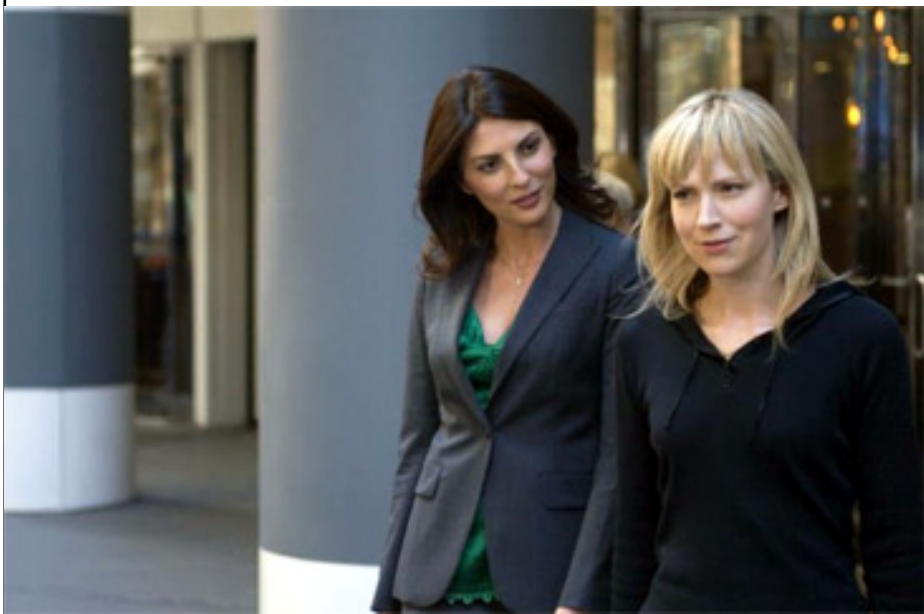
Gina Bellman (left) and Beth Riesgraf in TNT's "Leverage".

She added: "My character is very aesthetic. She's into the paintings and sculptures. Beth Riesgraf's character is an orphan. She's looking for financial security and a high. But what becomes evident over the series is they've never belonged. They've always been outsiders. They've never been in a group or depended on anyone. For us, it's a period of taming and coming together."