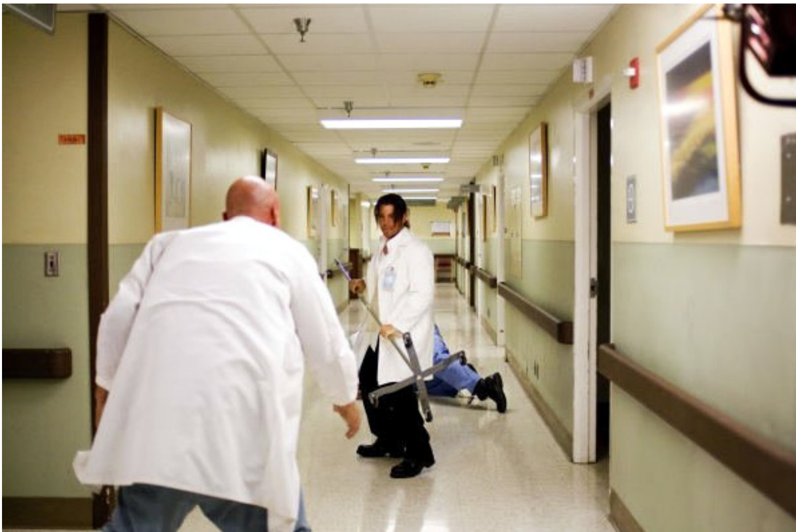
Christian Kane (center) in TNT's "Leverage".