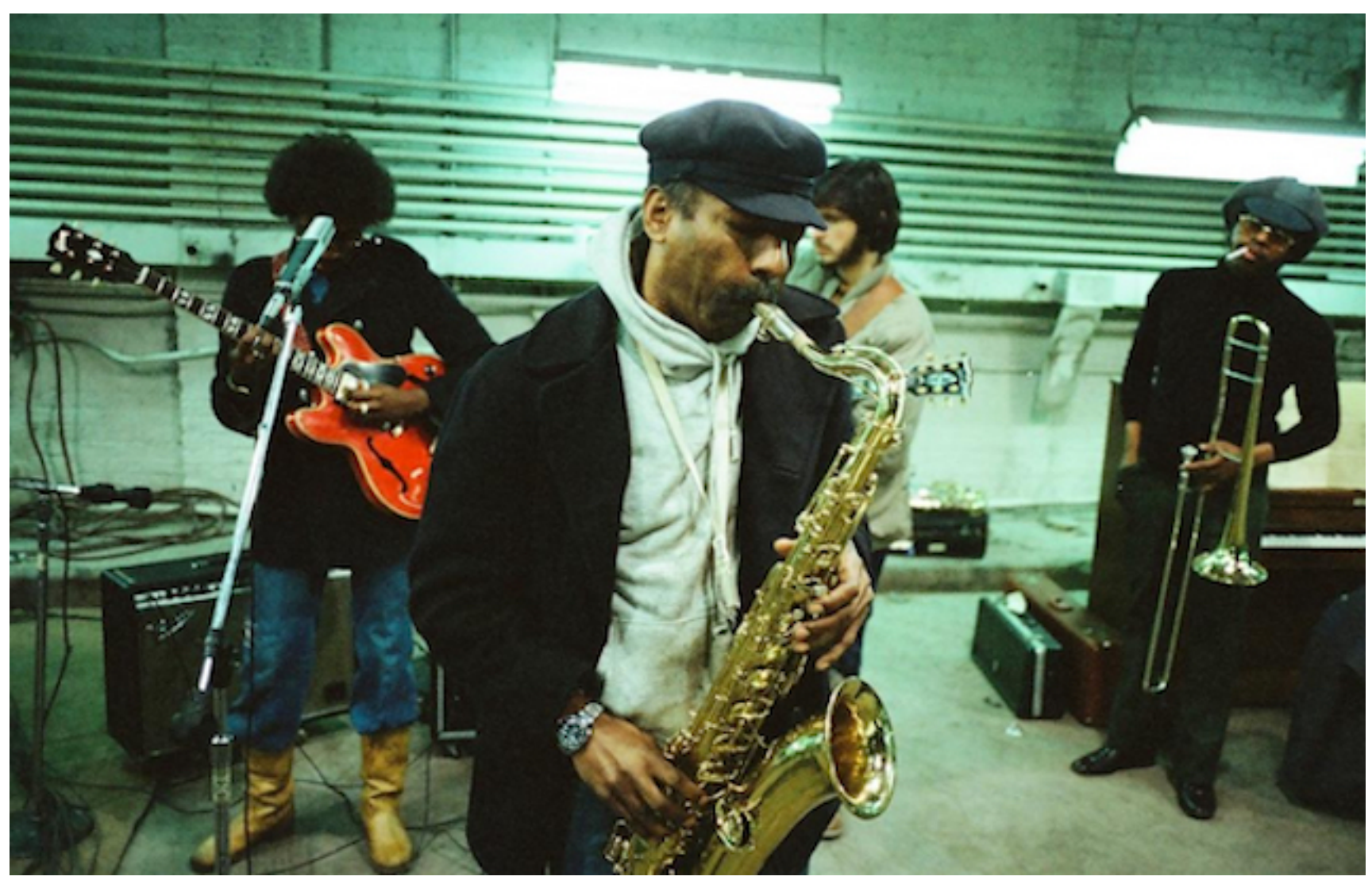
Available November 17th: Scene from 'Stony Island,' Directed by Andrew Davis

Published on HollywoodChicago.com (http://www.hollywoodchicago.com)