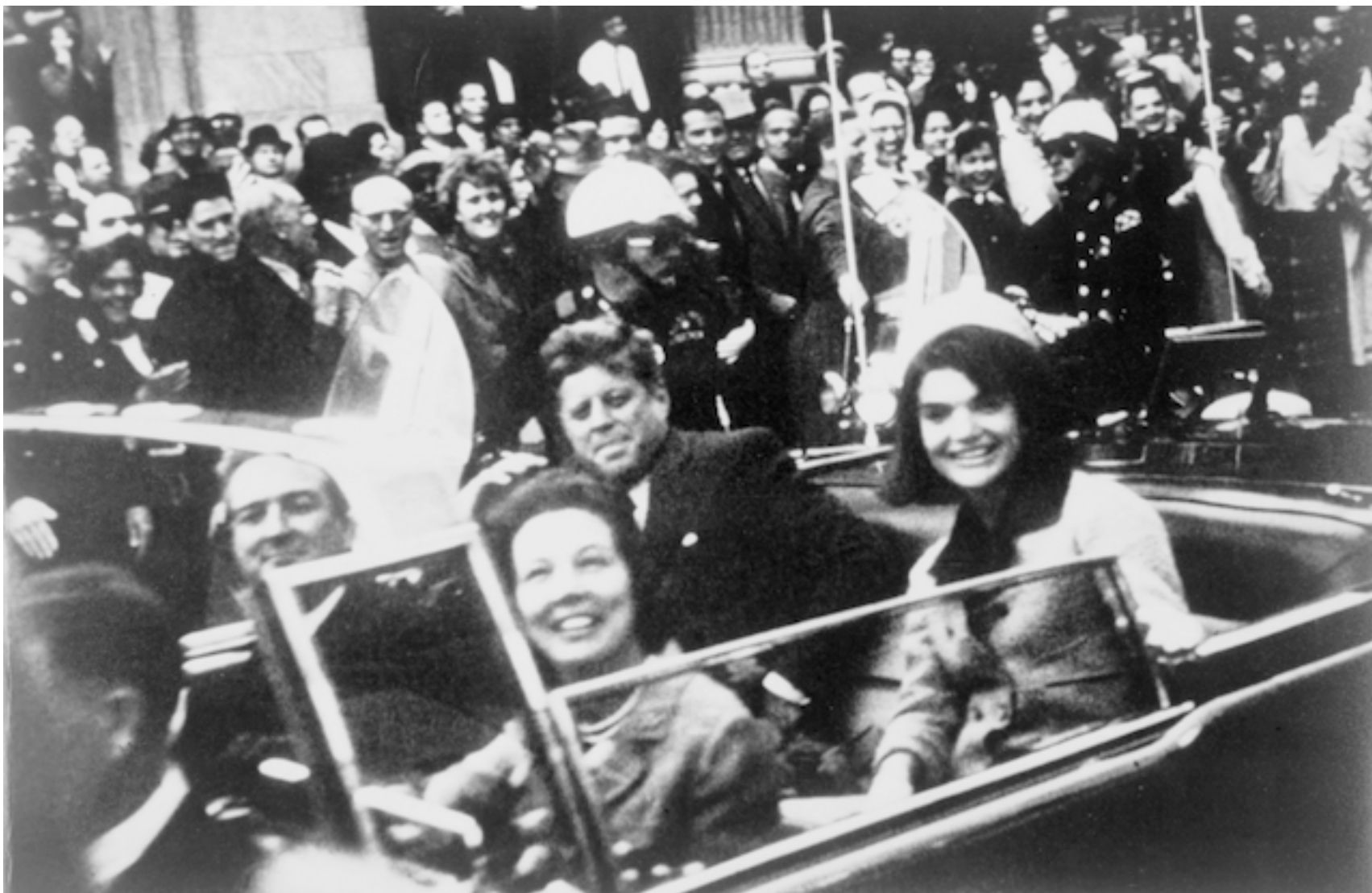
JFK, Jackie (back seat), Texas Gov. John Connally & wife Nellie (front) Before the 'Event'

The facts of the assassination are these ... President Kennedy was making a political swing through the State of Texas, on the cusp of the 1964 presidential election, a state which he barely won in his 1960 victory. The Dallas stop on the trip included a motorcade parade – in the presidential limousine were two Secret Service drivers, Kennedy, his wife Jackie, Texas Governor John Connally and his wife Nellie – through the downtown area before a scheduled speech at the Dallas Trade Mart. As the parade was ending at 12:30pm Central Time, shots rang out near the city's Dealey Plaza (home of the infamous grassy knoll), hitting Kennedy and Connally. Connally survived, President John F. Kennedy was pronounced dead a half hour later at Parkland Memorial Hospital.