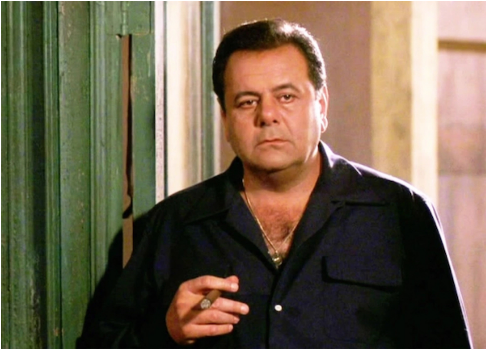
Paul Sorvino as Paulie Cicero in ‘Goodfellas’

He concluded with “Part of the actor’s tools is his child-like belief in things. Any fine artist retains his simplicity from childhood, he has to believe completely when he creating character, like a child using his finger as a gun. The actor’s work is different from any other artist because you have to believe in imaginary circumstances. As [famous acting instructor] Sanford Meisner once said when I studied under him, ‘you must find the pinch that will give you the ouch.’”