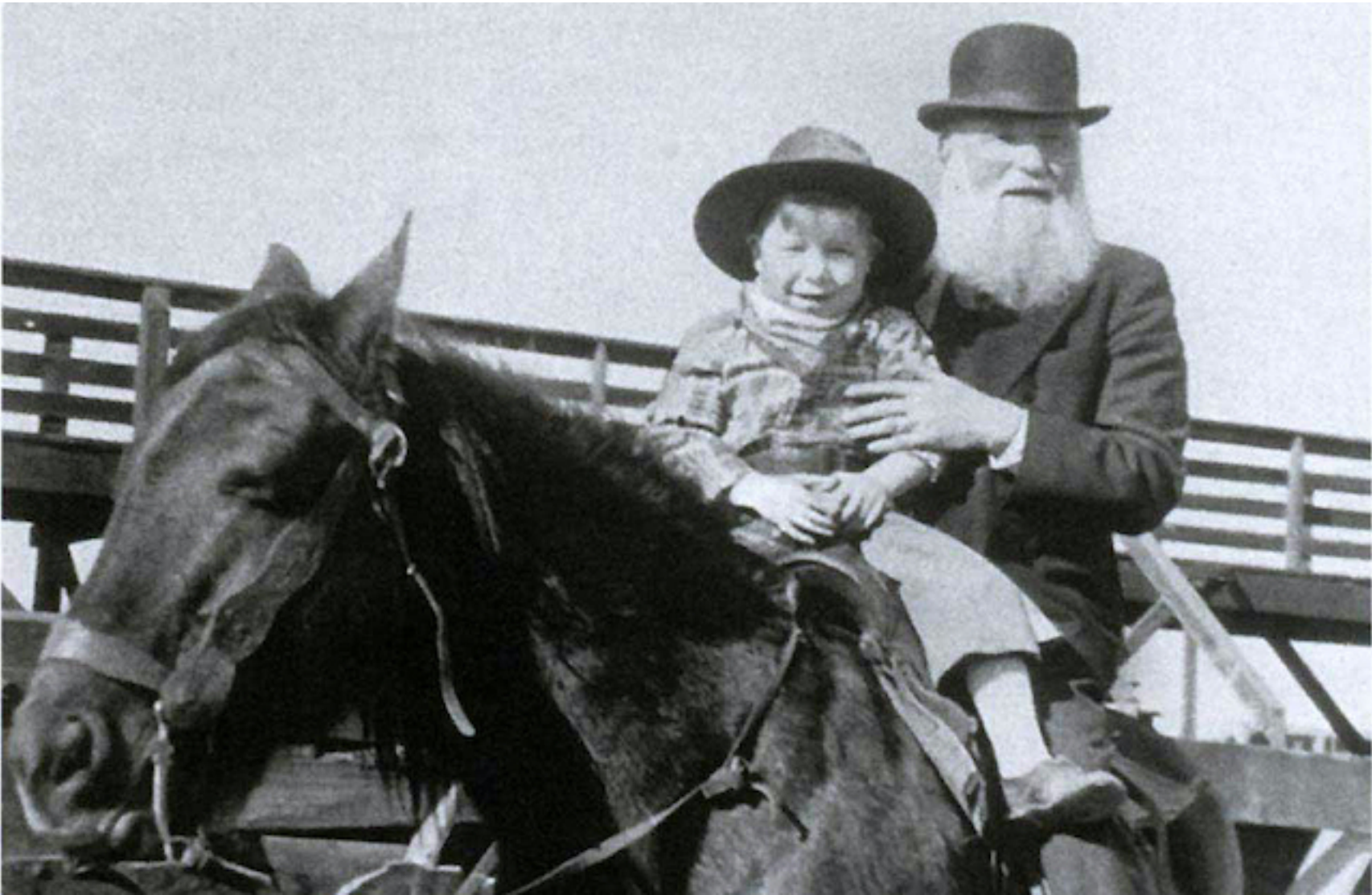
Still from 'Jews of the Wild West'