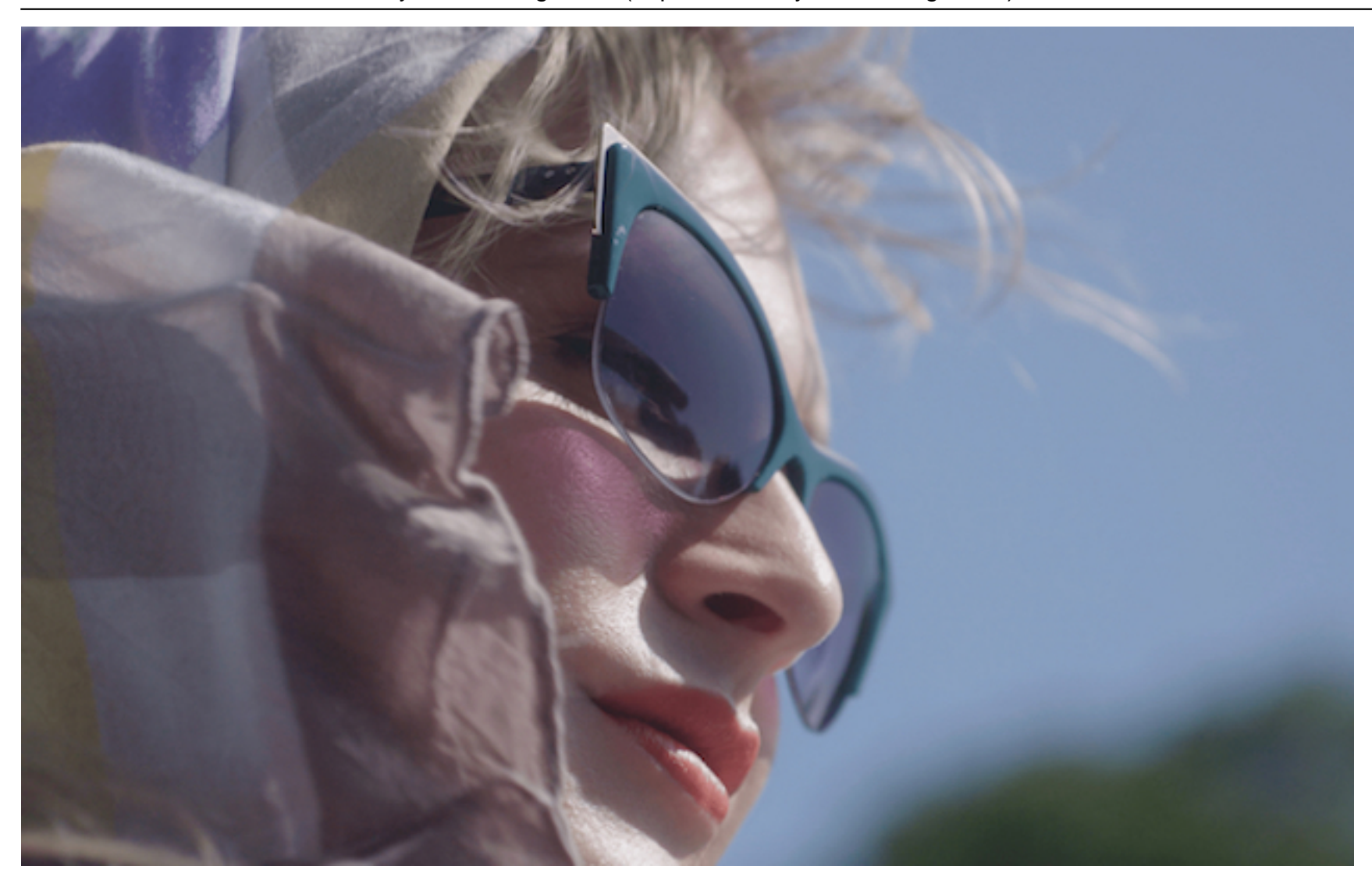
Framing Agnes (Canada), Directed by Chase Joynt