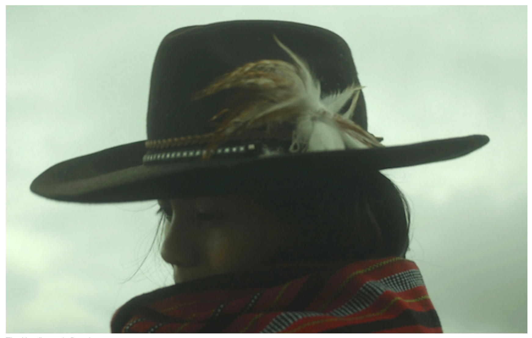
The Headhunter's Daughter