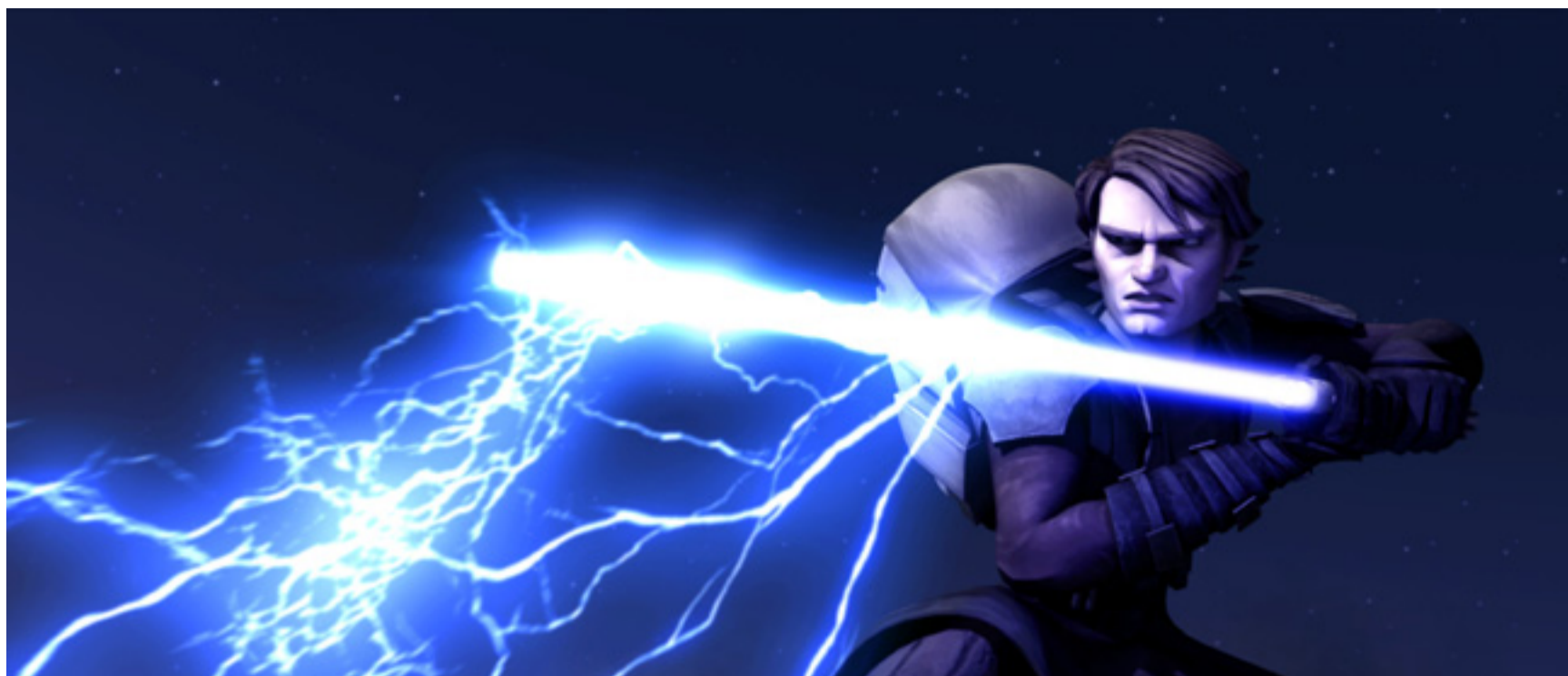
Heroic Anakin Skywalker (Matt Lanter) confronts a foe from the past in "Star Wars: The Clone Wars".