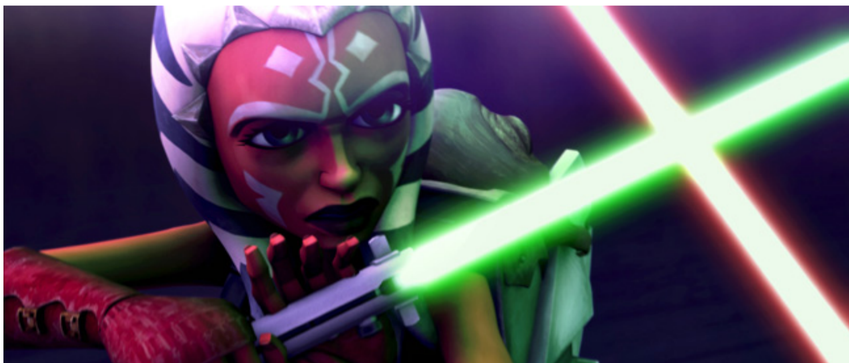
Ahsoka Tano (Ashley Eckstein) engages in battle with an enemy in "Star Wars: The Clone Wars".

★ Continuing reading for Adam Fendelman's full "Star Wars: The Clone Wars" review. [16]