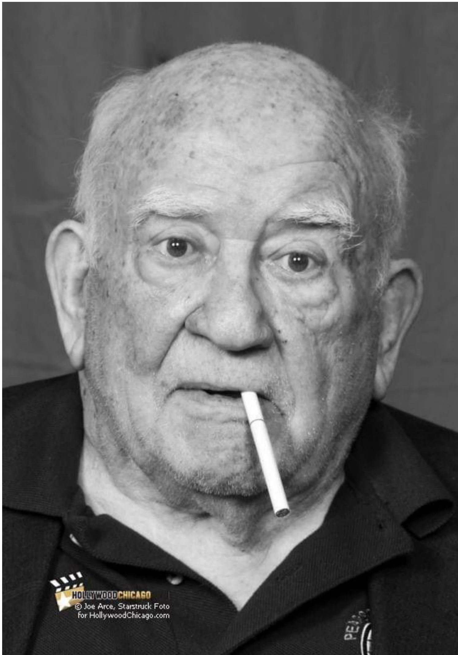
Ed Asner Was Still Smokin' at Age 87 in 2017