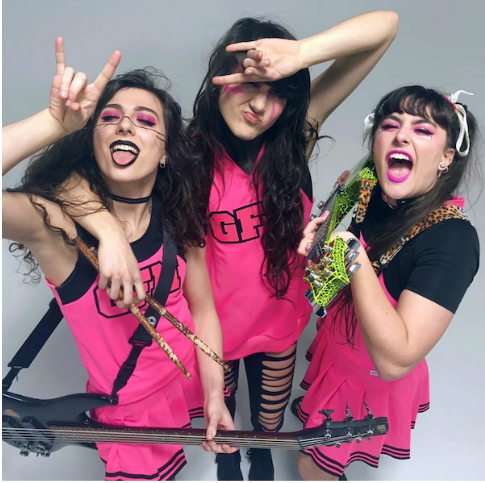
Gold, Frankincense & Myrrh (GRM)

GFM are breaking boundaries in the music industry and bringing life back to rock and metal with their encouraging and positive message. The sisters all began taking music lessons at just five years old, which sparked a love that would continue to grow. As they got older, the girls collectively decided that they wanted to pursue this passion for music professionally, and began putting in the "blood and sweat" that created GFM.