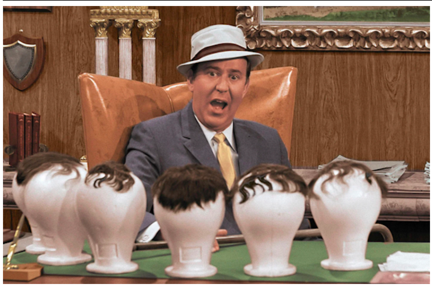
Carl Reiner on colorized "The Dick Van Dyke Show"