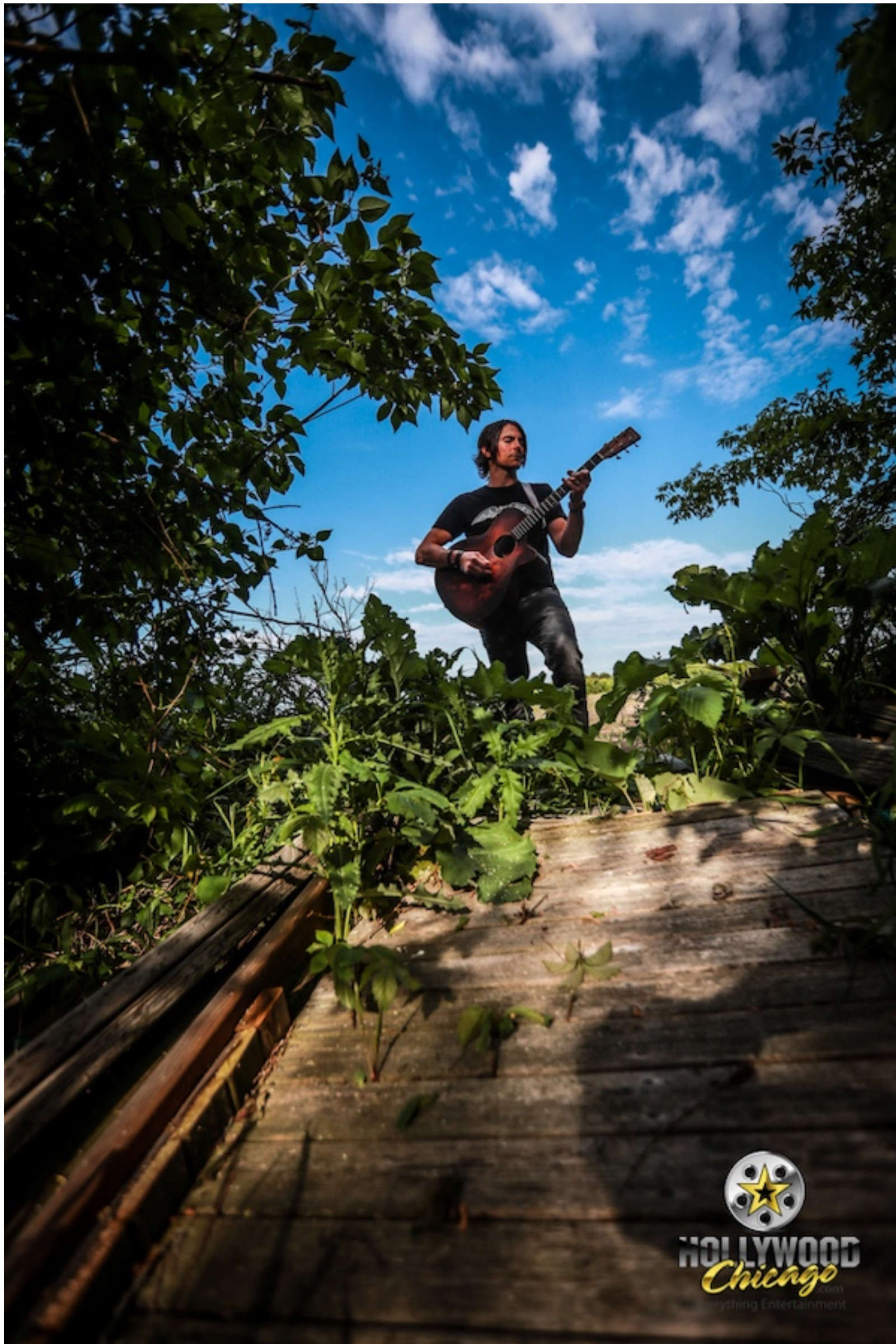
Rocker Pino Farina