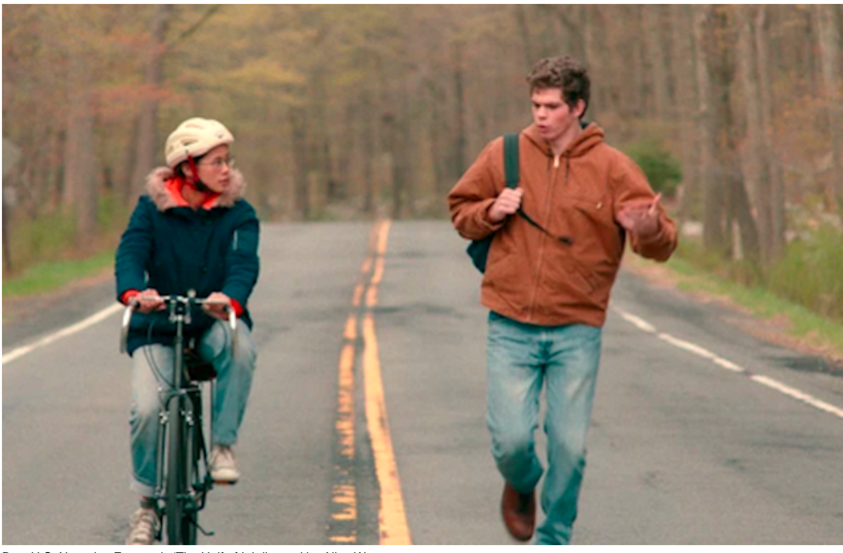
Best U.S. Narrative Feature is 'The Half of It,' directed by Alice Wu

The top prizes went to "The Half of It," directed by Alice Wu (Best U.S. Narrative), "The Hater," directed by Jan Komasa (Best International Narrative) and "Socks on Fire," directed by Bo McGuire (Best Documentary).