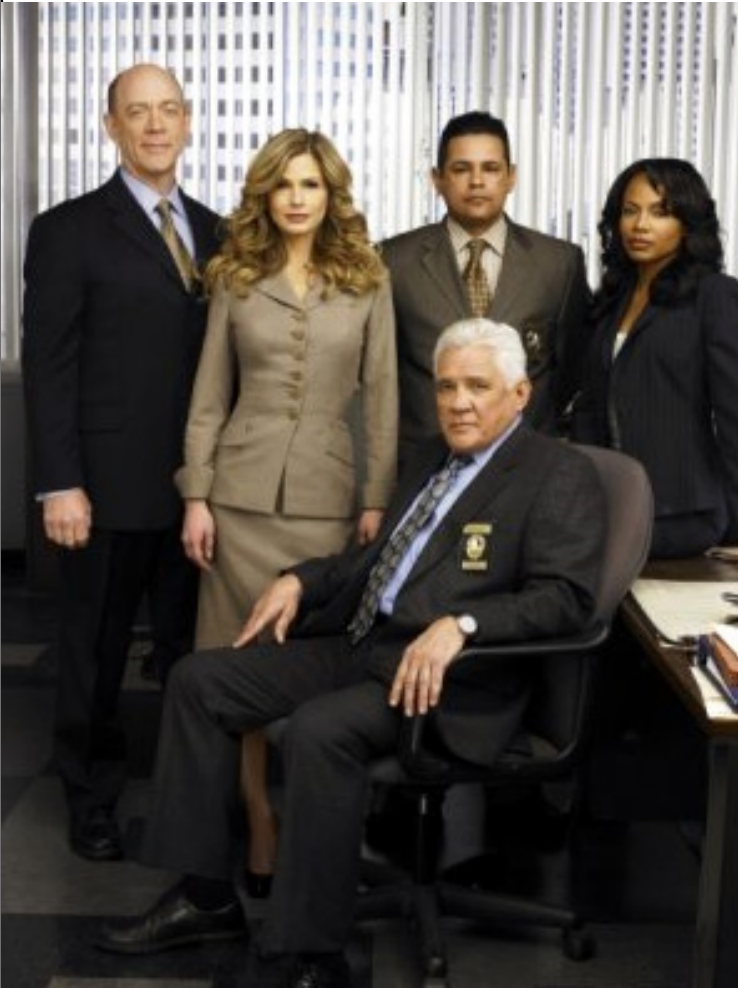
J.K. Simmons (left), Kyra Sedgwick (second from left) and G.W. Bailey (front) in "The Closer" on TNT.

"I enjoy working for the camera. I love TV because it's fast. You tell your story and you're out. But I could never do what Kyra does. I've never, ever seen a human being do what she does on this show – just the sheer volume of work every day and on every scene. It ain't called 'The Provenza Show'. It's called 'The Closer' and she's the closer."