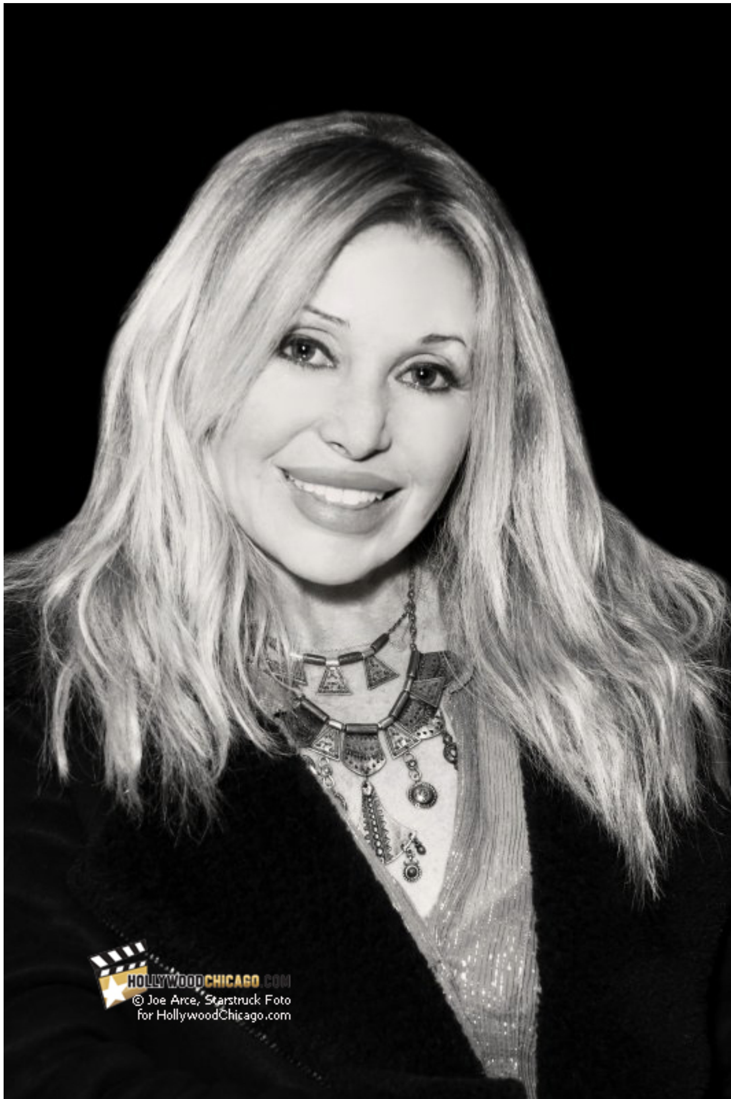
E.G. Daily, Singer and Voiceover Artist