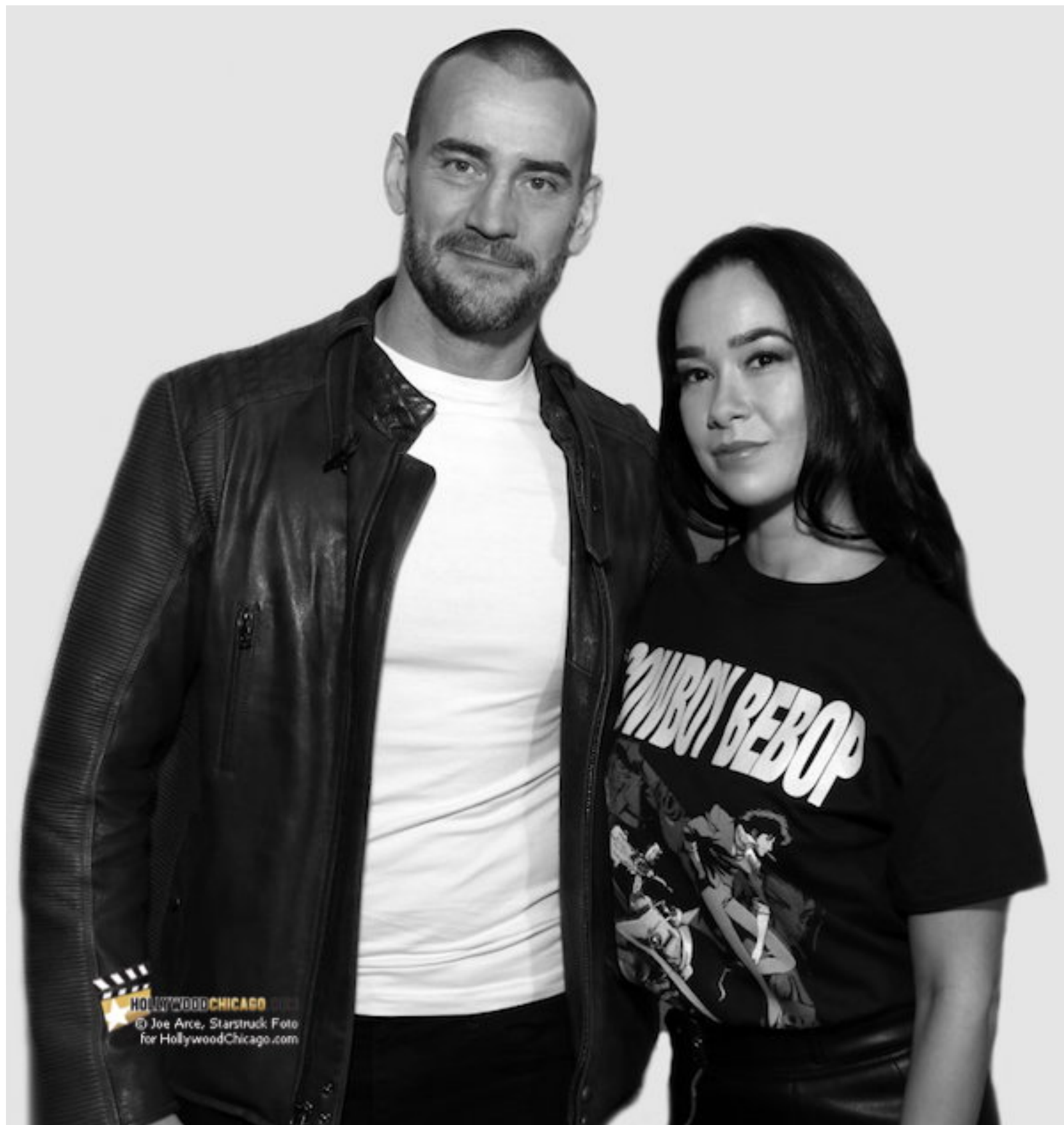
CM Punk (Phil Brooks) with A.J. 'Lee' Mendez