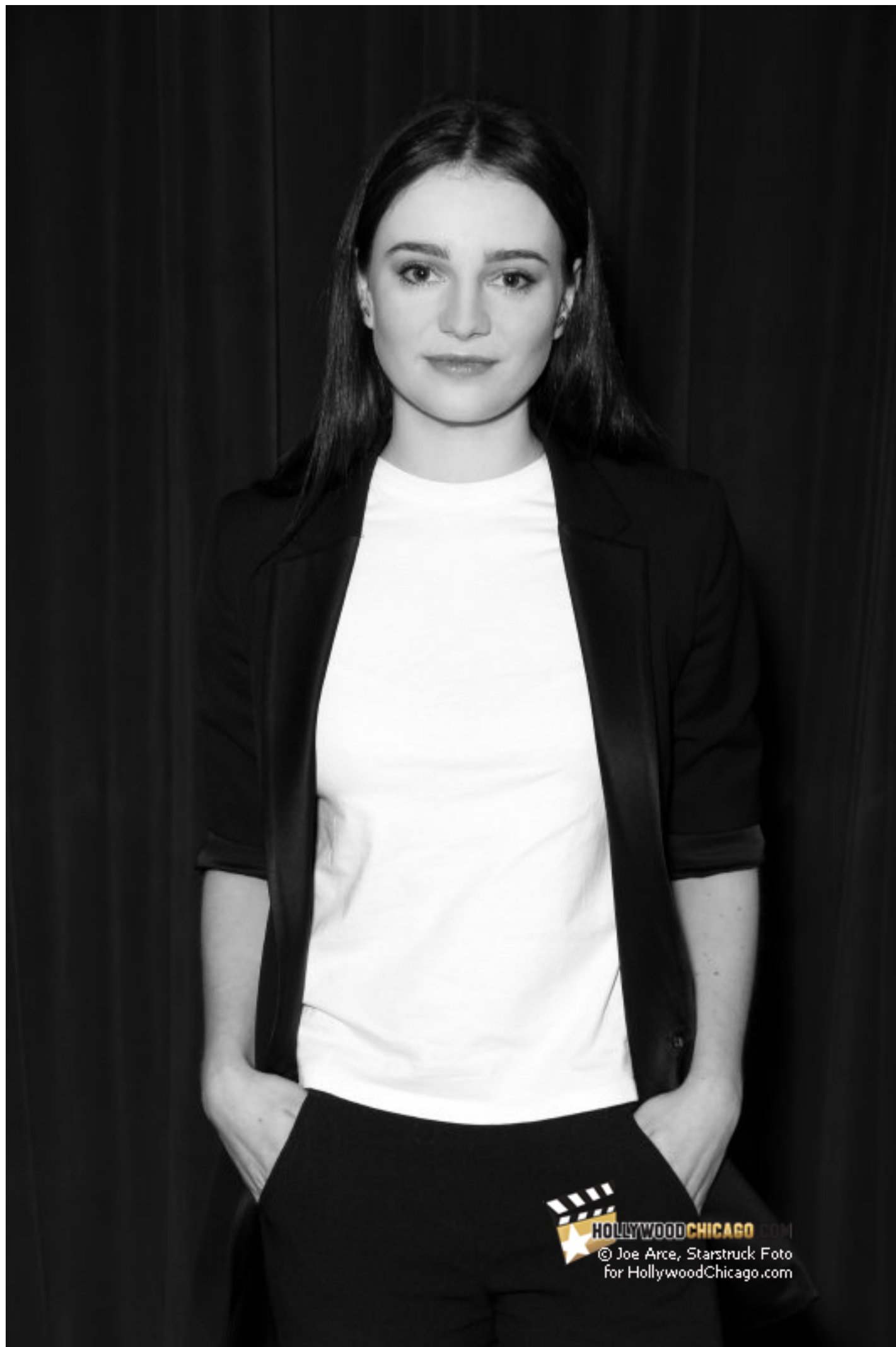
Aisling Franciosi of 'The Nightingale'