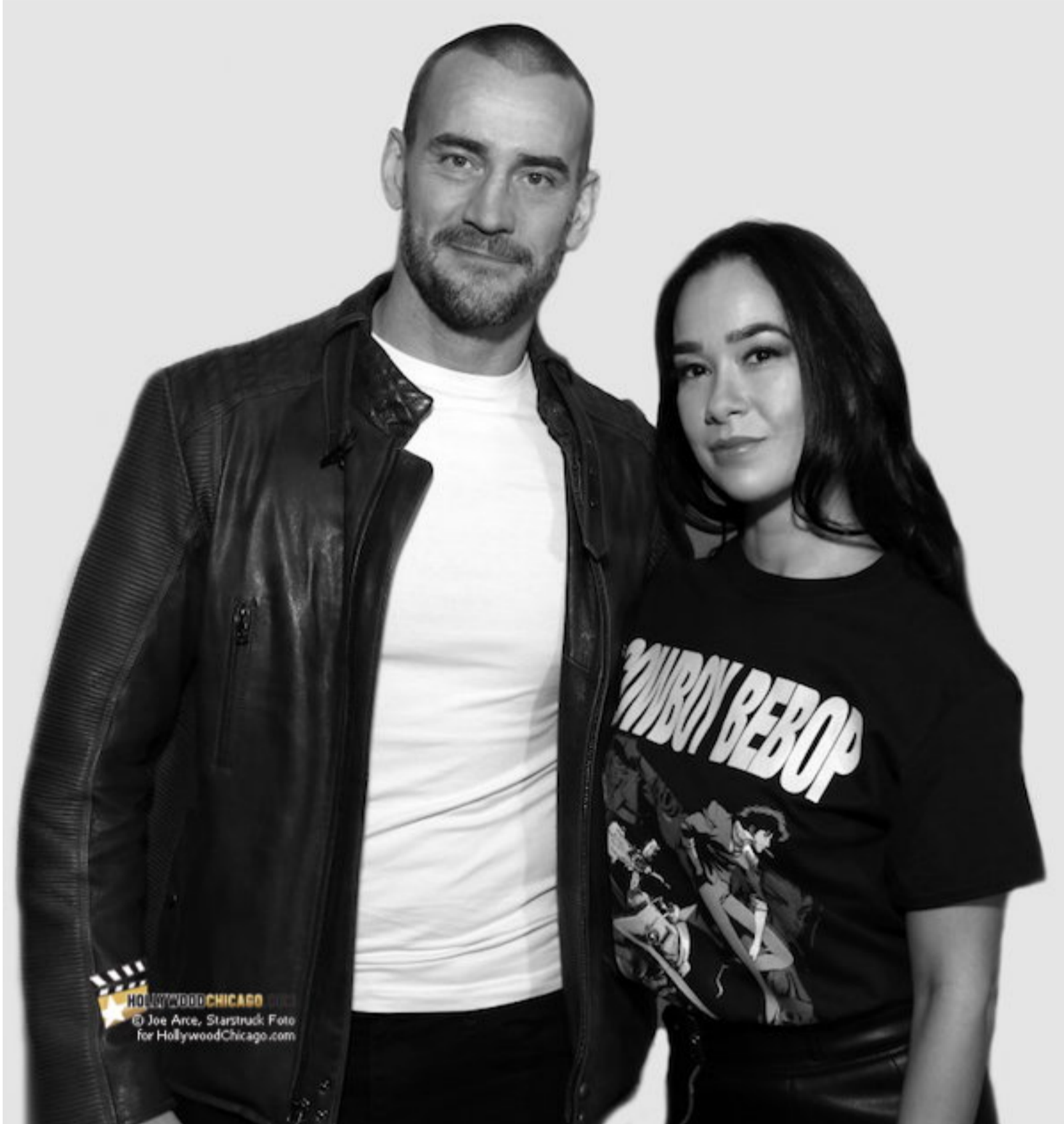
CM Punk (Phil Brooks) with A.J. 'Lee' Mendez

It seems like the winning move for former pro wrestlers is to transition their act to the big screen ... Dwayne (The Rock) Johnson is currently the highest paid actor in the entertainment industry, for example. Dave Bautista and John Cena have both made successful transitions, and now a new challenger is stepping into the "actors ring." Former WWE Champion and Chicago's own CM Punk (AKA Phil Brooks) has made his onscreen debut with a starring role in the horror film, "The Girl On the Third Floor." His performance was smashing, and he got surprisingly good reviews. He also appeared in another horror film in 2019 called "Rabid."