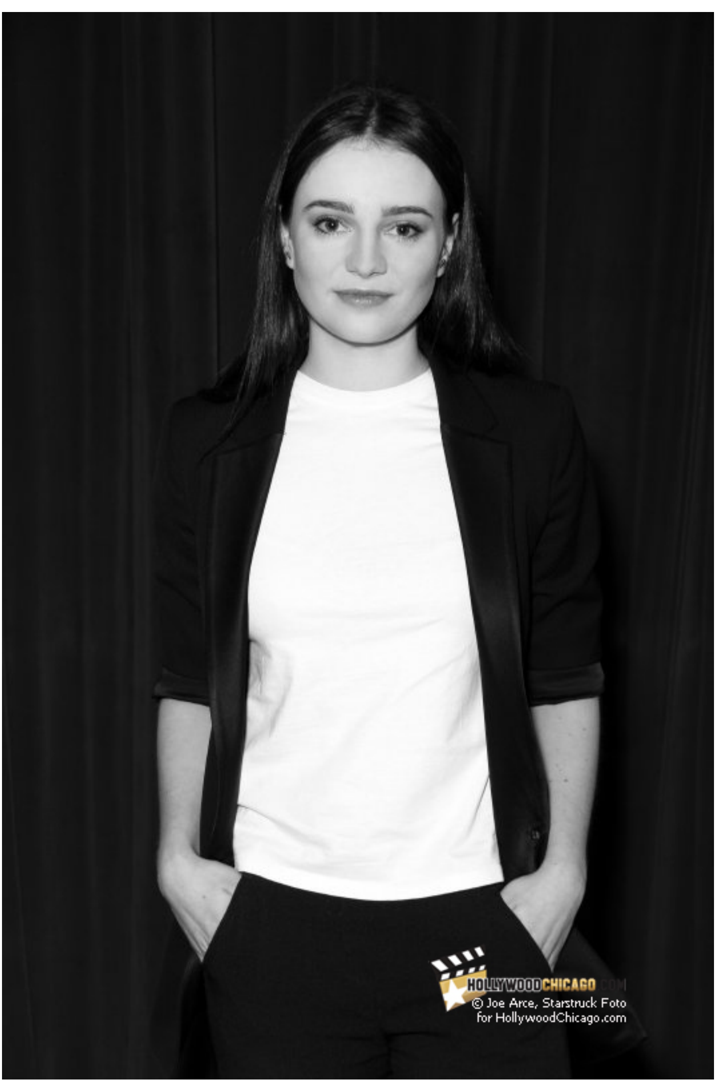
Aisling Franciosi of 'The Nightingale'

Aisling Franciosi, without a doubt, was one of 2019's rising stars. The 26-year-old Irish actress was awarded that honor by both the Berlin Film and The Chicago Film Critic Festivals for her tour de force breakout performance in "The Nightingale," directed by Jennifer Kent. The Australian film, set in 1825, created a firestorm of controversy for its honest and brutal depiction of colonial atrocities, especially violence against women and the native Tazmanian population.