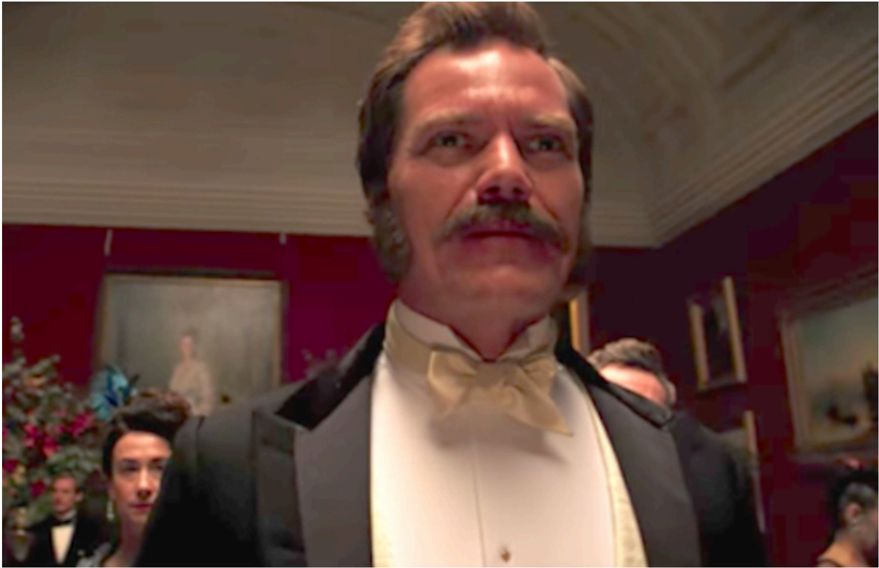
Michael Shannon as George Westinghouse in ‘The Current War’