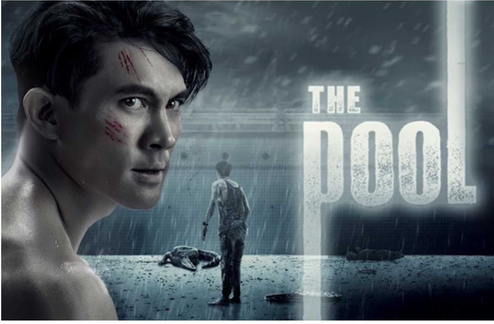
APUC continues with Ping Lumpraploeng's 'The Pool' from Thailand

"The Pool" involves a couple stuck in the desolated title location that is twenty feet (six meters) deep ... they're stuck without food/water, a ladder or a way out, and somehow need to survive. To make matters more challenging, an unfriendly amphibian is teetering on the brink of joining them. "The Pool" is Ping Lumpraplerng's ("Loveaholic," "Dreamaholic") fourth film, and features Thai superstar Ken Theeradeth Wonpuapan, who returns to big screen for the first time in nine years. It won the Critic's Prize at the 2019 Brussels International Fantastic Film Festival.