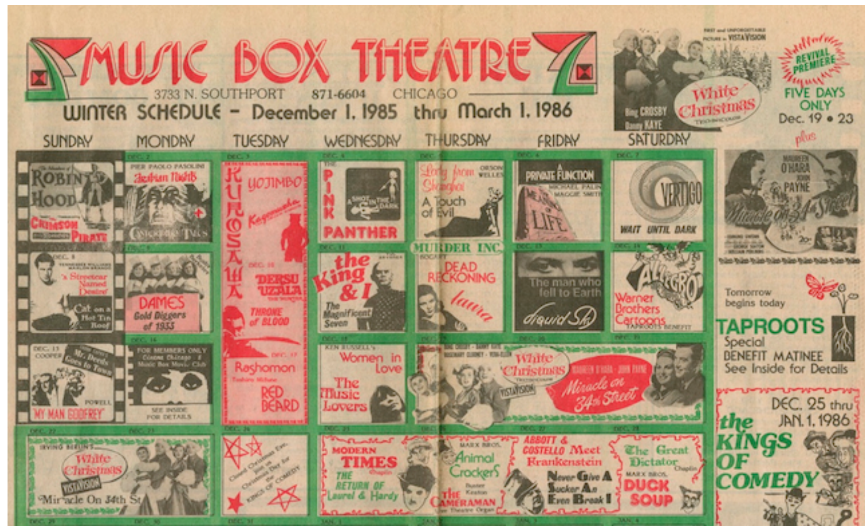
The Music Box Calendar, Circa 1986

Published on HollywoodChicago.com (http://www.hollywoodchicago.com)