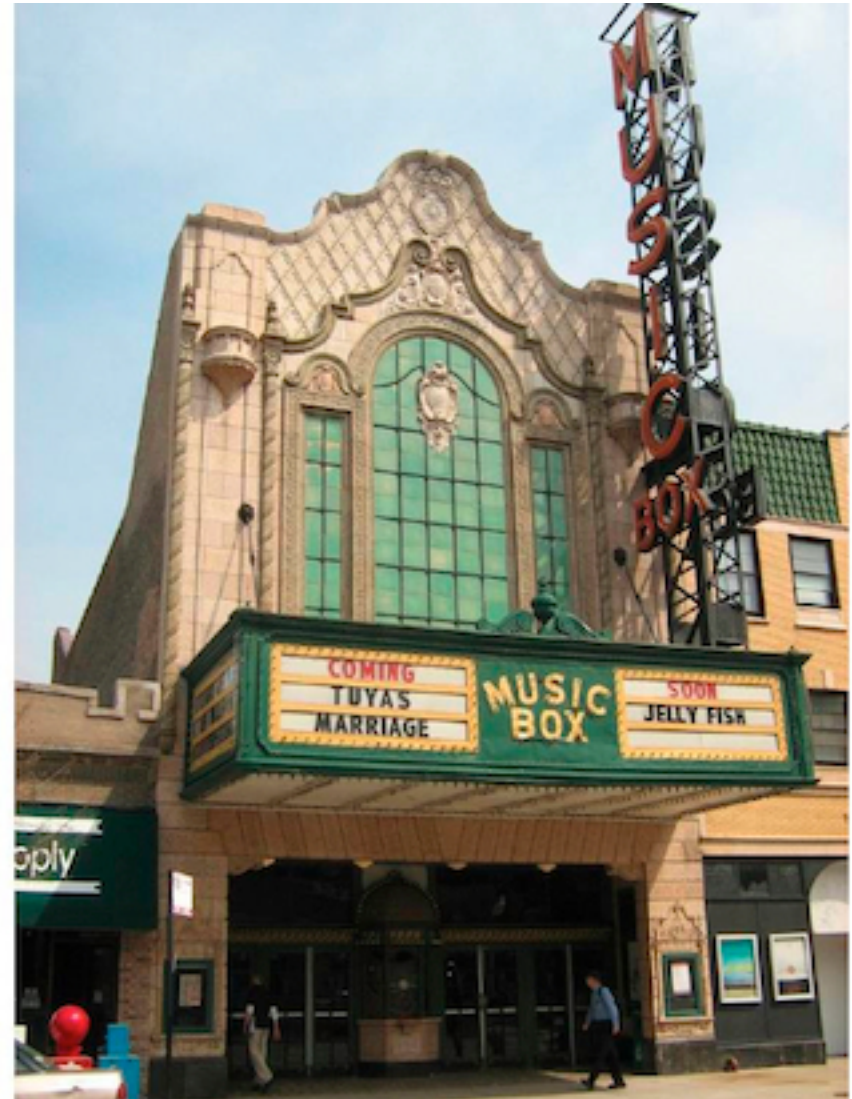
Sister Acts: The Ramova Theatre and The Music Box Theatre