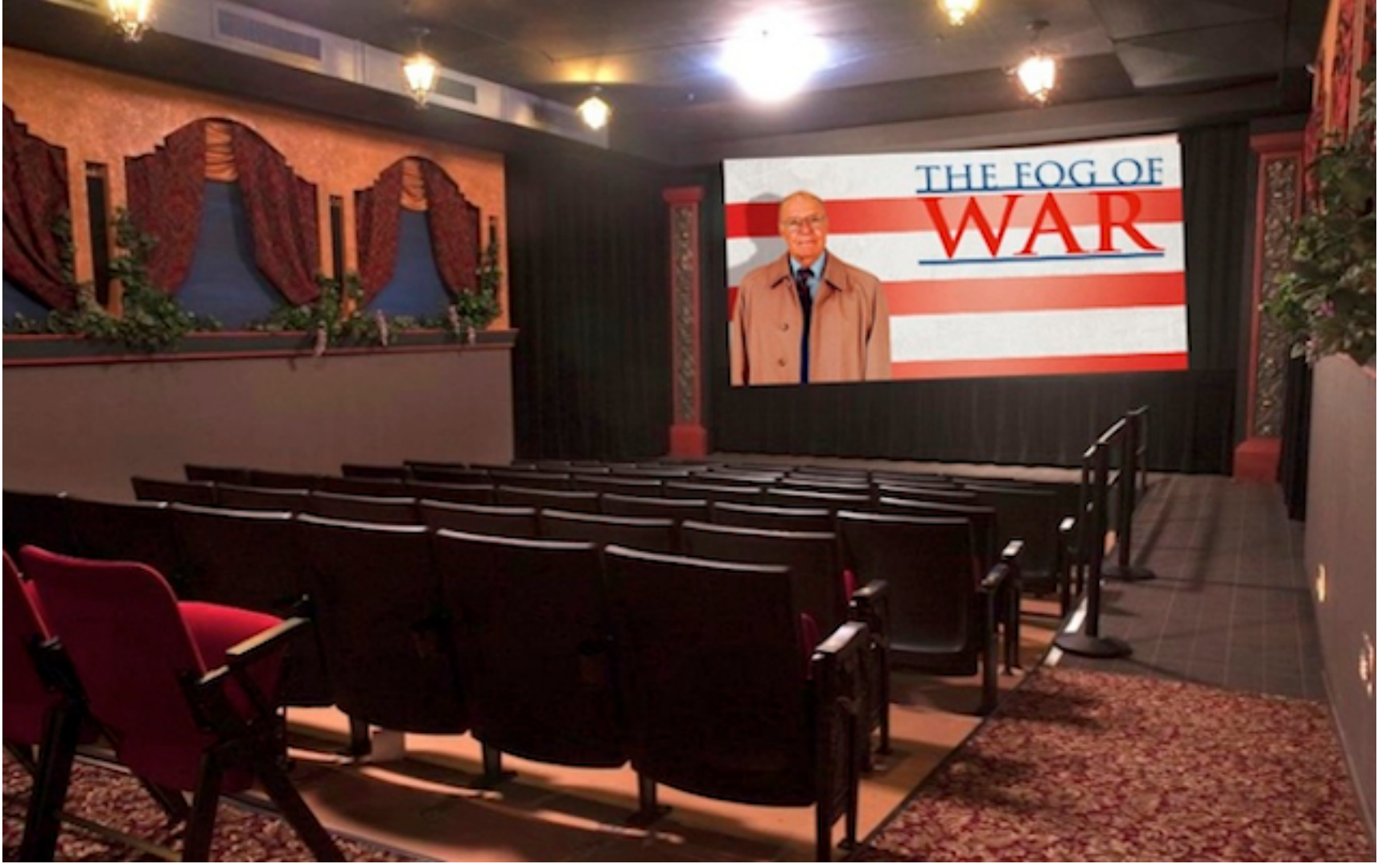
F*ck You, McNamara! The 'Fog of War' (Re-creation) in Theater Two at the Music Box Theatre