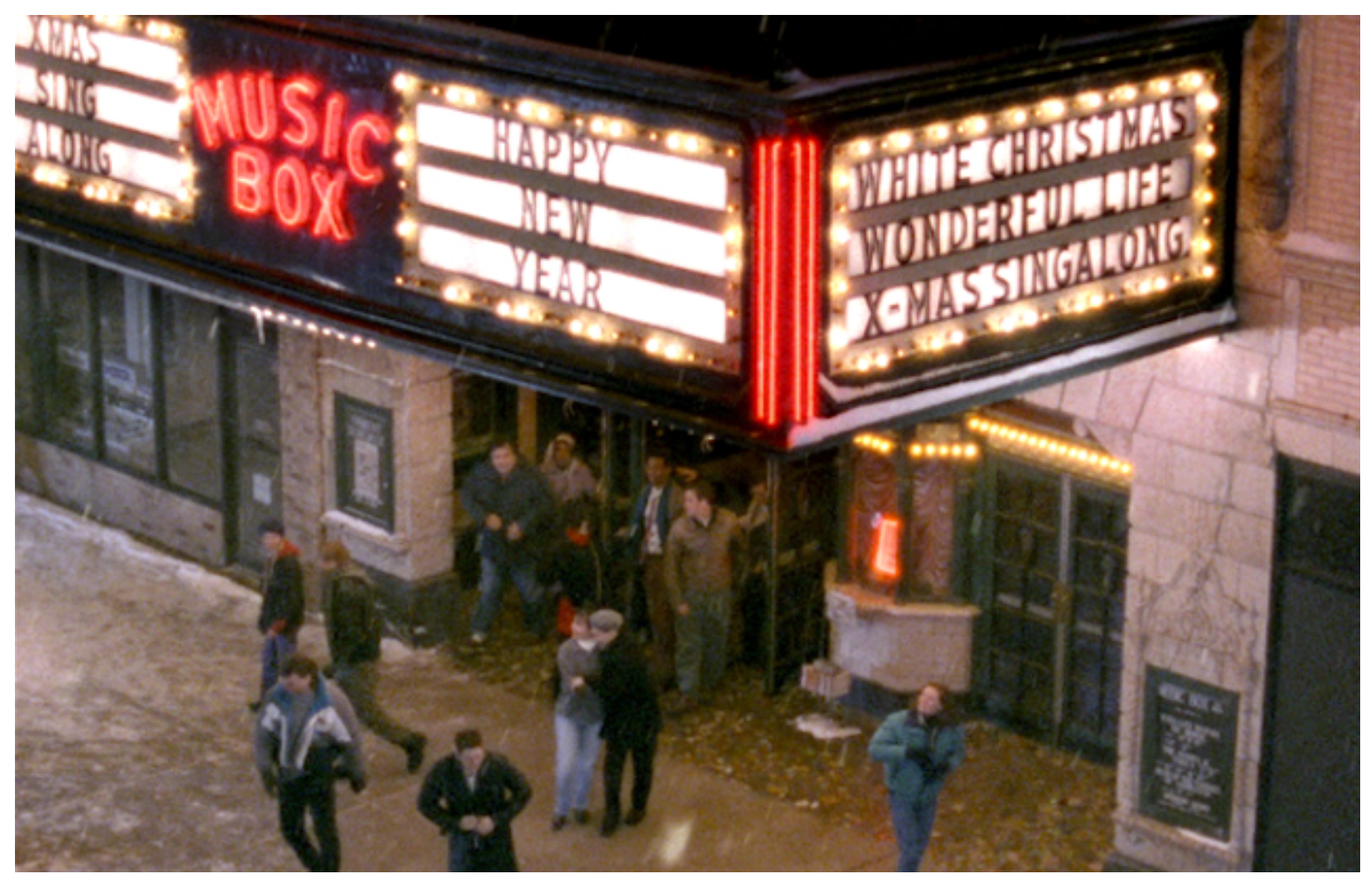
The Music Box Theatre Holiday Sing-along, in the film 'Solstice' (1994)