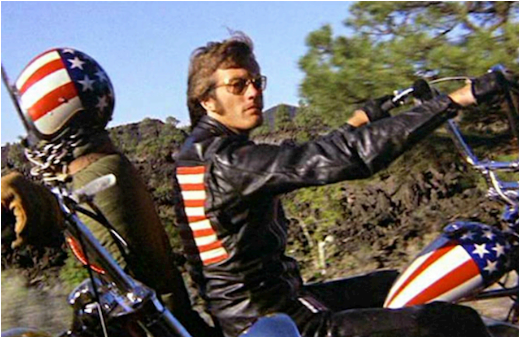
Peter Fonda as Captain America in the Classic Film 'Easy Rider'

"Fuel can be made from algae," Fonda said. "The same factories that pollute our waterways and cause algae to form can now be powered by it."