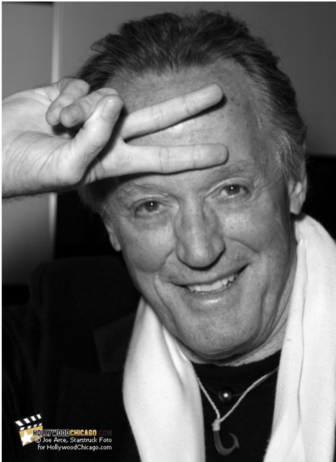
Peaceful, Easy Rider: Peter Fonda in Chicago, January 28, 2010.