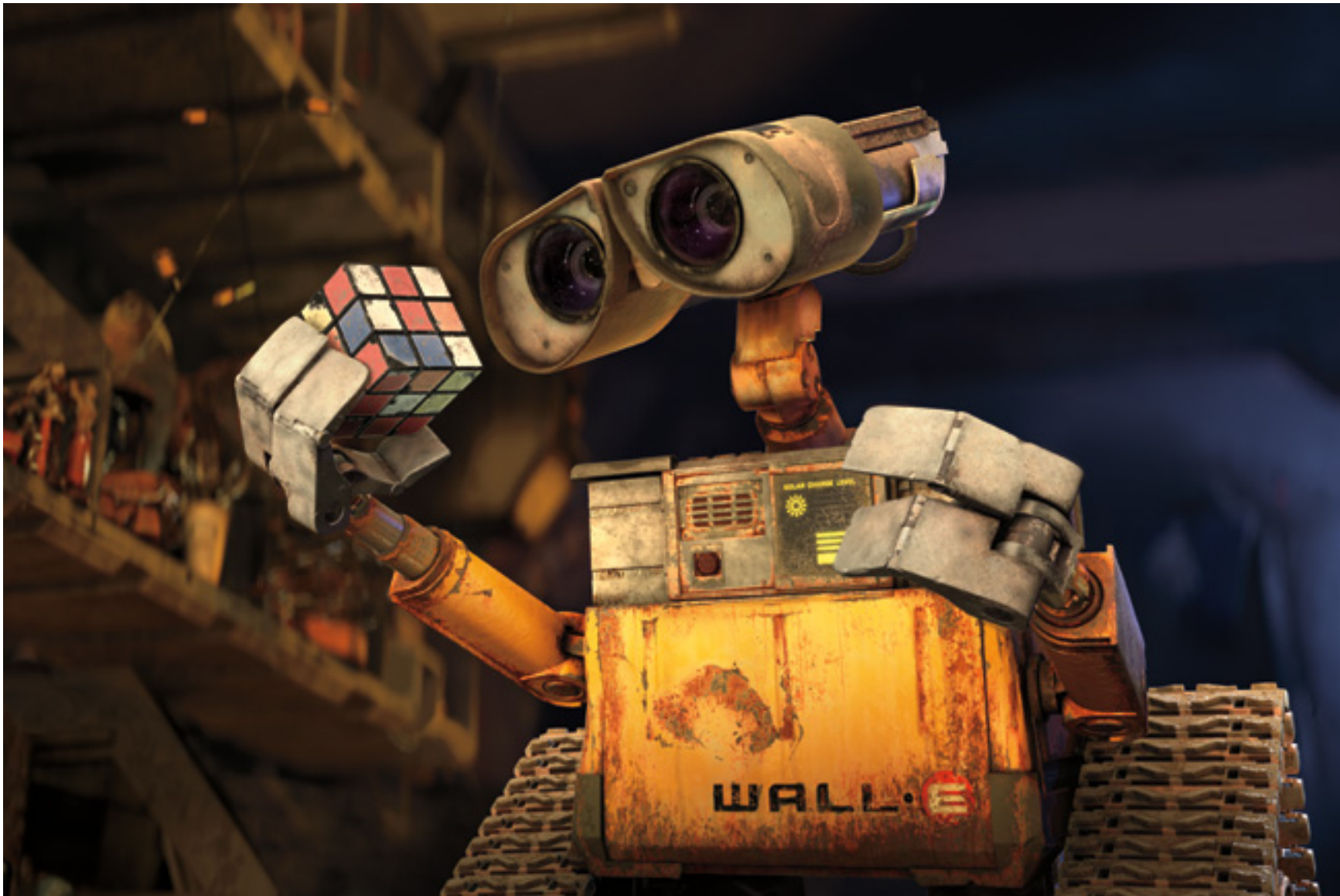
WALL-E in “WALL-E”.