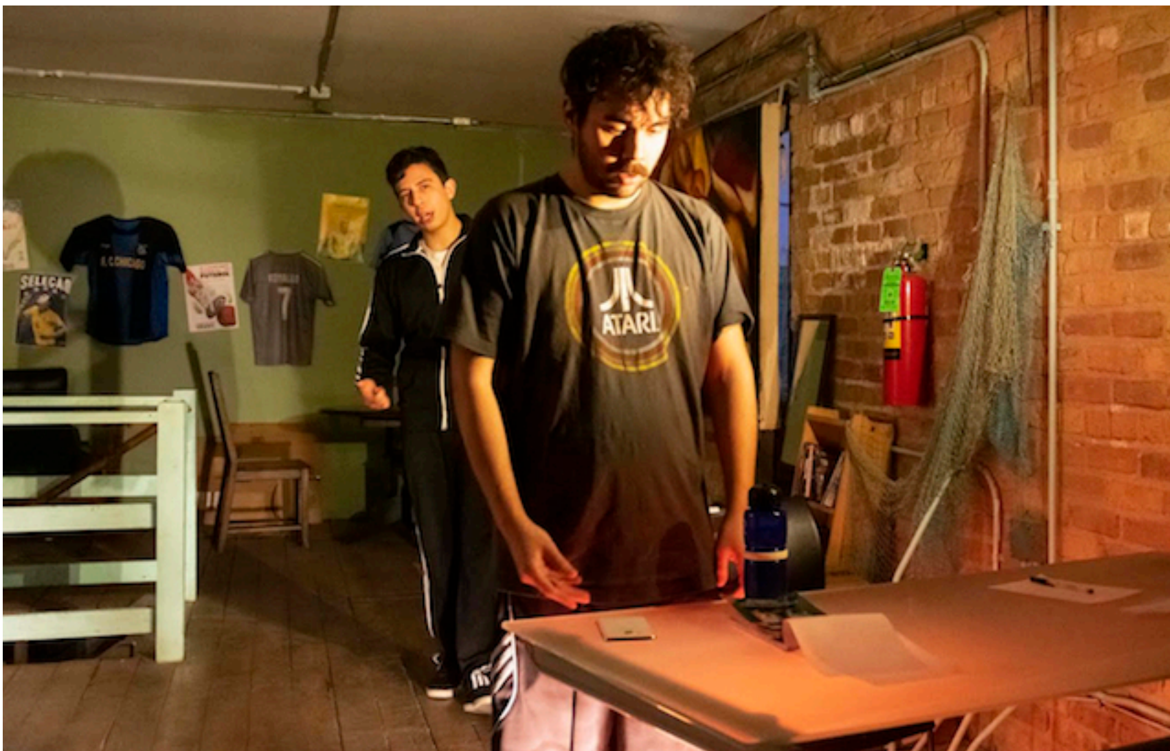
Nothing Without a Company’s ‘The Soccer Player in the Closet’