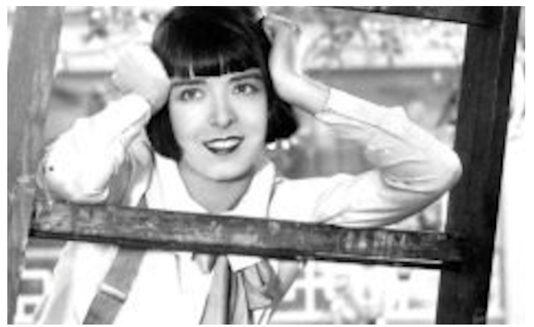
Film History is Celebrated with 'A Tribute to Colleen Moore' on October 21st