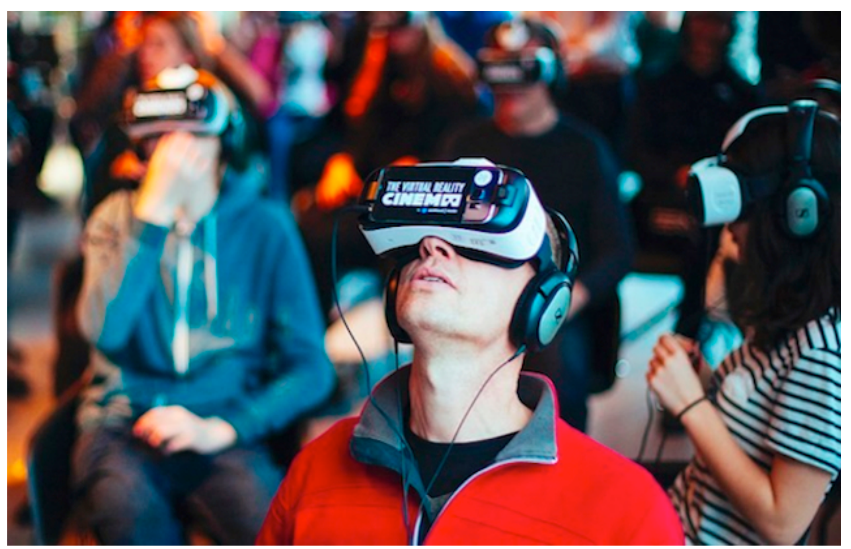
VR Immersive Cinema for the First Time at the Chicago International Film Fest

For the first time, the Chicago International Film Festival will present Virtual Reality Immersive Cinema, where participants become part of the film. With special eyepieces and interactive digital content, the Festival is providing an opportunity for audiences to experience VR Immersive for FREE! For more details, click here. [28]