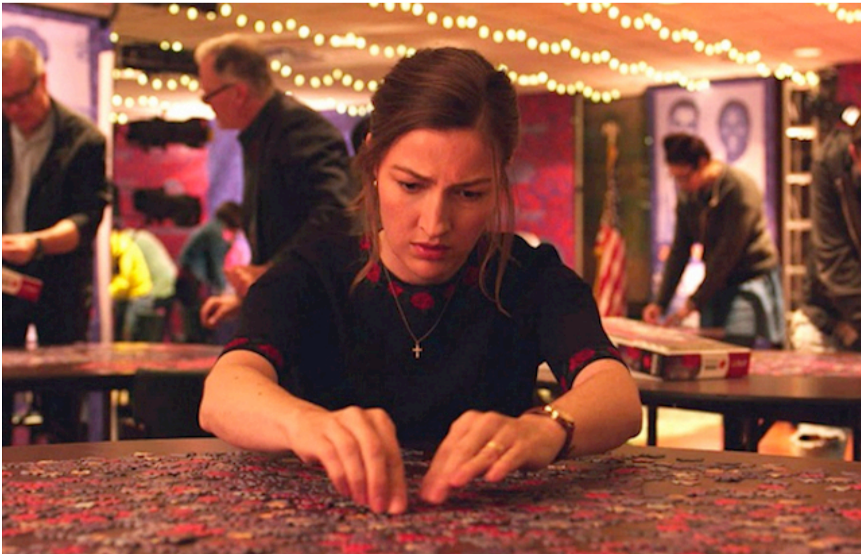
Kelly Macdonald in ‘Puzzle,’ Directed by Marc Turtletaub

CHICAGO – When a notable indie film producer decides to direct, what does it feel like on that other side? For Marc Turtletaub, the connection was in his sophomore effort as director, “Puzzle.” The emotional drama features the impeccable Kelly Macdonald, as a stay-at-home Mom named Agnes who discovers a hidden talent.