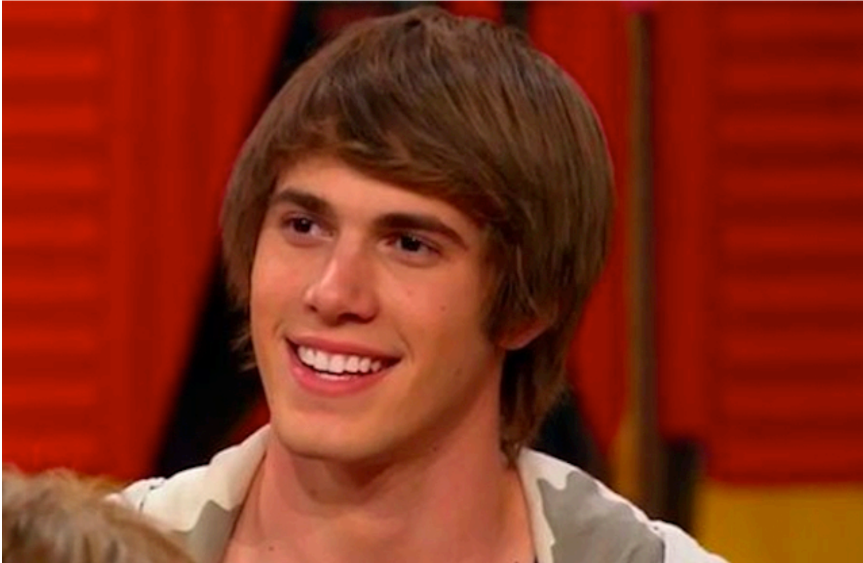
His Hair is Perfect: Blake Jenner on 'The Glee Project'

In 2016, Jenner scored a role in director Richard Linklater's nostalgia comedy "Everybody Wants Some!!," and talked to HollywoodChicago.com on behalf of that movie. It was also during that time that Jenner was on the short list to portray the young Han Solo, the role that eventually went to Aiden Ehrenreich (in the earlier interview, Jenner expressed what he would do to a Wookiee to land that part. Click here. [25]). Despite all that, Blake Jenner continues to hone his craft and climb the show business ladder.