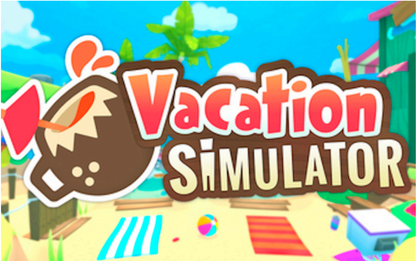
'Vacation Simulator,' Created by Owlchemy Labs

Another oddball entry, and not for people who don't do interactive games. The participant is thrust into a cartoon world, with several challenges having to do with being on vacation. You are asked to walk around in the world, with controllers, and work on "recreation," "relaxation" and the "sunburn." This was Owlchemy Labs follow up to "Job Simulator," so it stands to reason you had to get away eventually. The cartoony world was definitely trippy.