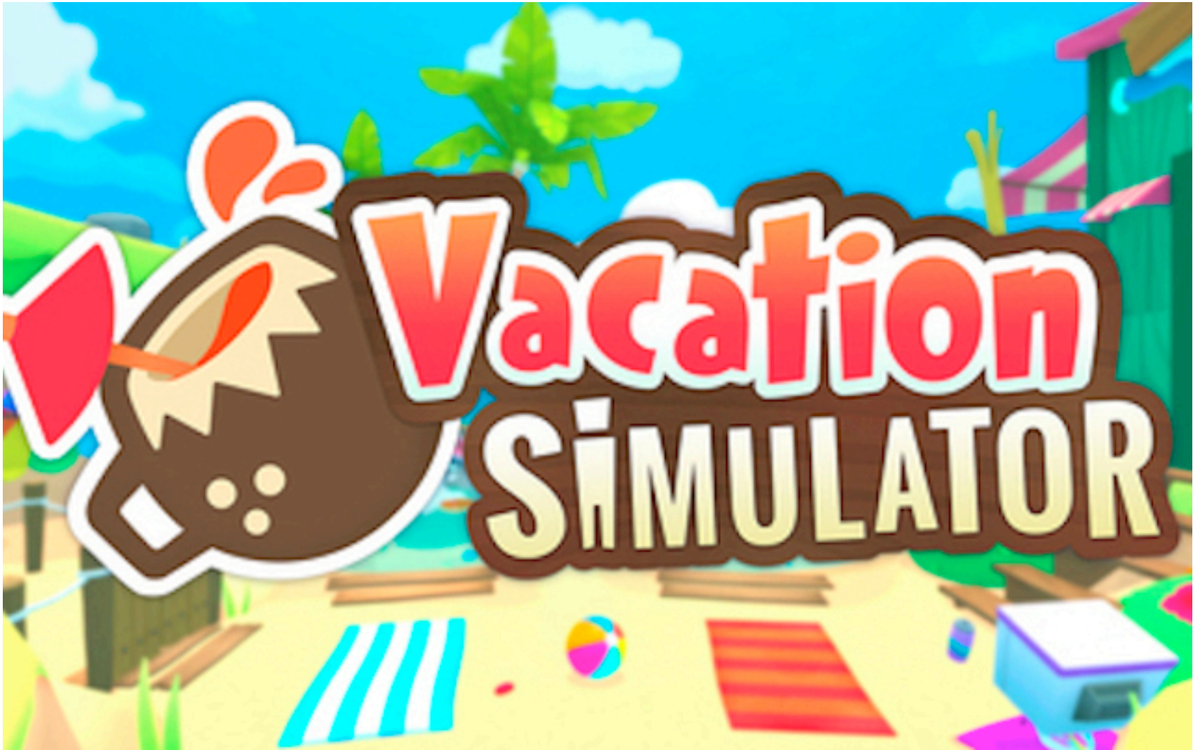
'Vacation Stimulator,' Created by Owlchemy Labs

Another oddball entry, and not for people who don't do interactive games. The participant is thrust into a cartoon world, with several challenges having to do with being on vacation. You are asked to walk around in the world, with controllers, and work on "recreation," "relaxation" and the "sunburn." This was Owlchemy Labs follow up to "Job Stimulator," so it stands to reason you had to get away eventually. The cartoony world was definitely trippy.