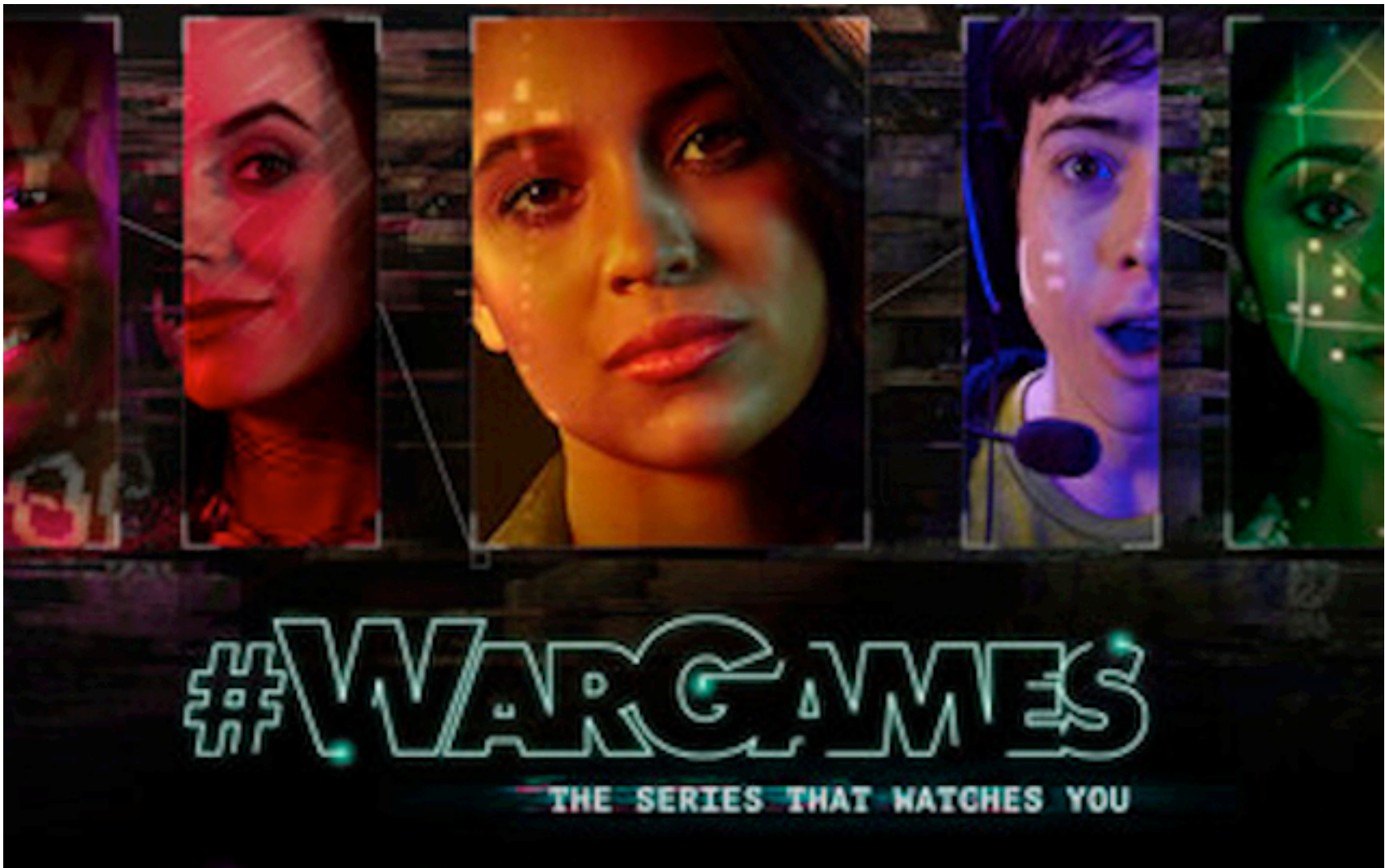
'#WarGames VR,' Created by Sam Barlow

This was actually a demonstration of a new web series, expanded to VR, which has taken the essence of the 1983 cult classic and brought it to now, unfortunately with none of the charm of the film. This is a typical the-kids-know-more-than-anyone hacker fantasy, where adolescent computer jockeys unlock doors and turn on sprinklers remotely ("Joe, I need you to do this in five seconds or we're all caught!" "I can do in four!" etc.). In fairness, this is part of a whole soap opera happening, which is not fleshed out by experiencing a bit of VR preview.