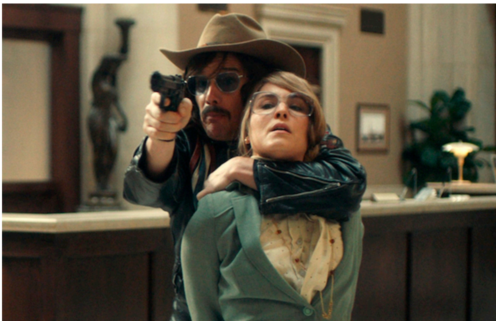
'Stockholm,' Directed by Robert Budreau