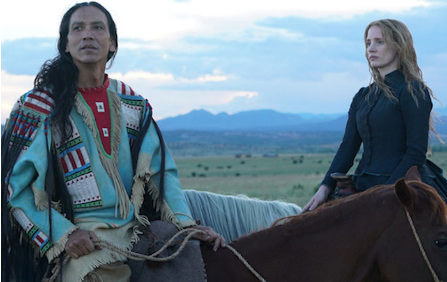
'Women Walks Ahead,' Directed by Susanna White