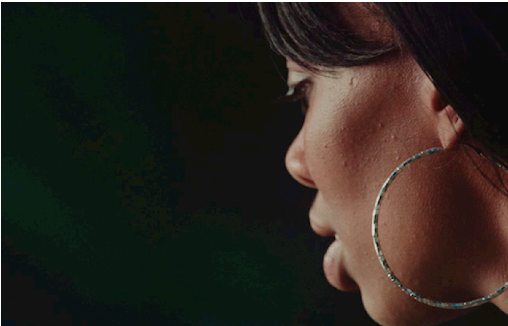
'Blowin' Up,' Directed by Stephanie Wang-Breal

The film has been released in the last two weeks to theaters nationwide. See local listings for theaters and showtimes.