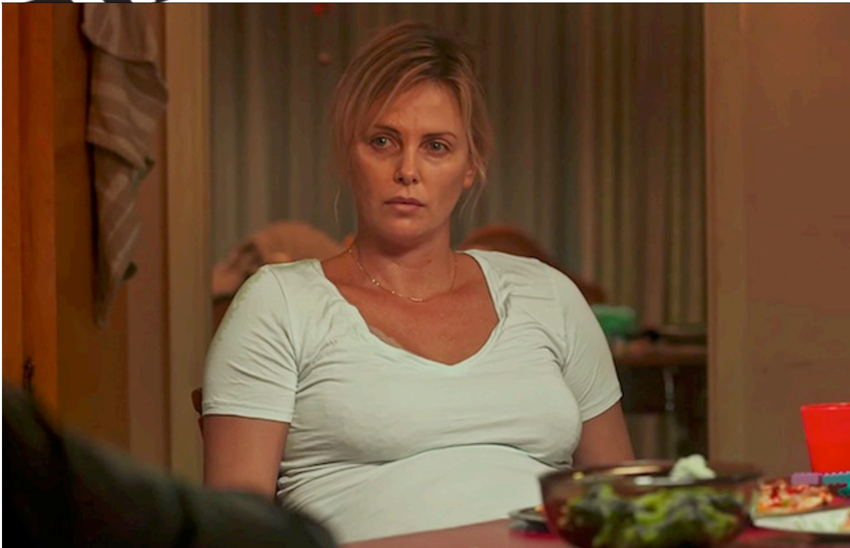
'Tully' Directed by Jason Reitman

A remarkably empathetic overview of motherhood, told through the Mom character of Charlize Theron, going through the challenges and insanity of birthing the “third child.” When her wealthy brother gifts her a night nanny (basically a helper who allows Mom to sleep by taking overnight duties), her life begins to change for the better. Director Jason Reitman is working again with writer Diablo Cody, the same team that produced “Juno,” but “Tully” is a grown up perspective on the sheer sacrifice that humans make to raise kids in a time of more stress, and more of everything. It’s both a life lesson and a cultural perspective.