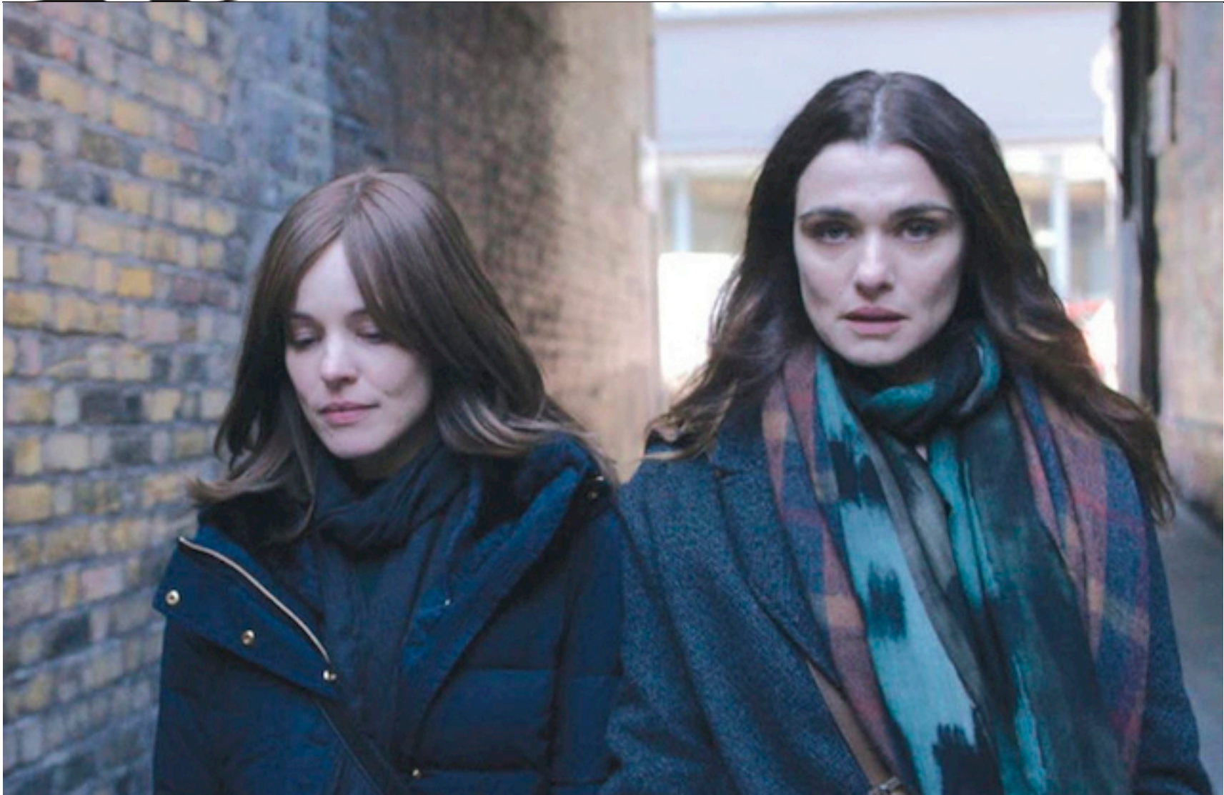
'Disobedience,' Directed by Sebastián Lelio

This unusual story features Rachel Weisz and Rachel McAdams as lovers, against a background of their Orthodox Jewish roots. The film has been released, and the full review can be read by clicking here . [23]