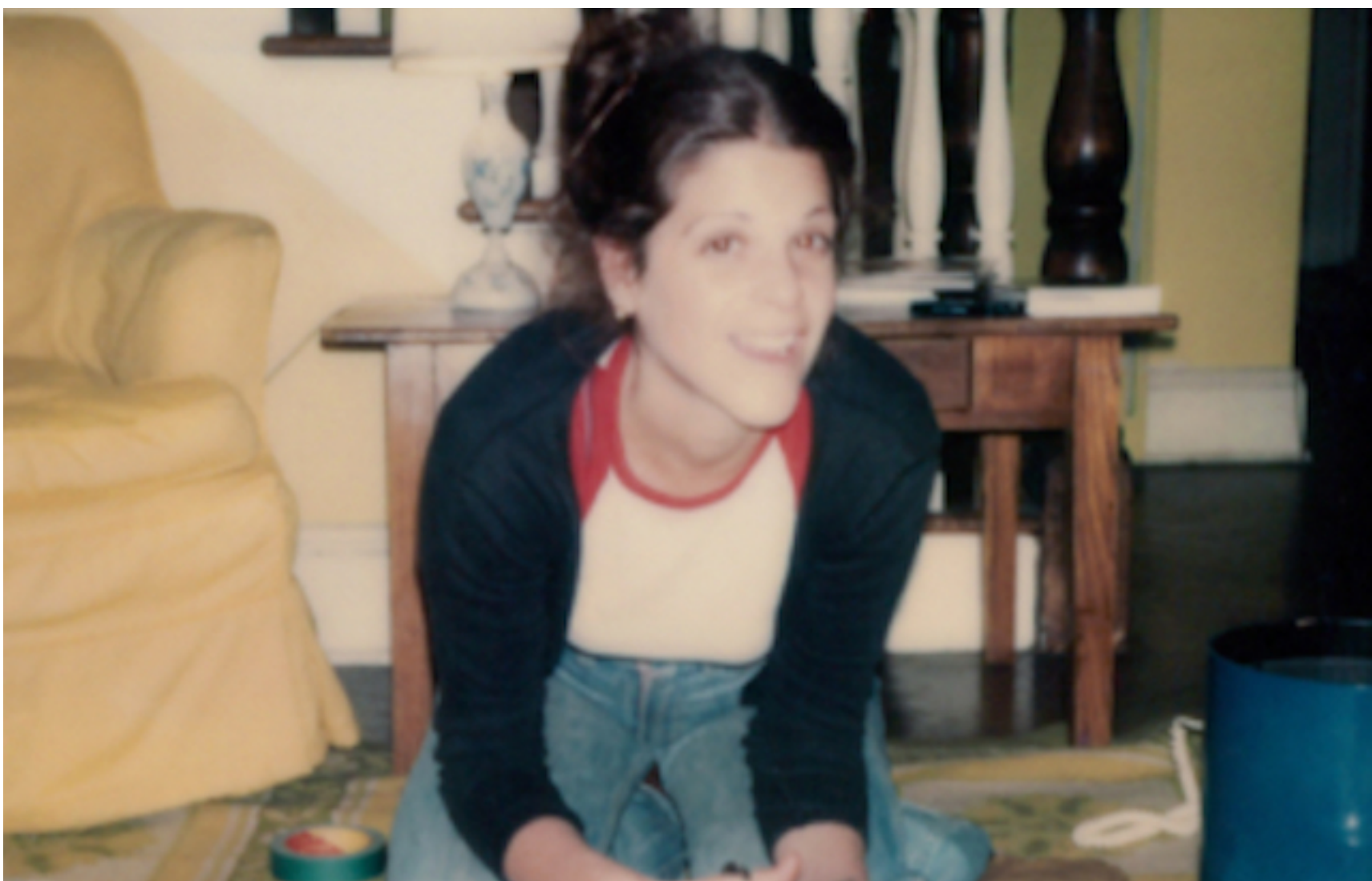
'Love Gilda' Directed by Lisa Dapolito