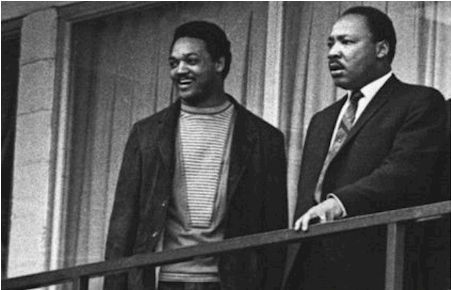
Jesse Jackson and Dr. King on the Balcony of the Lorraine Motel on April 4th, 1968