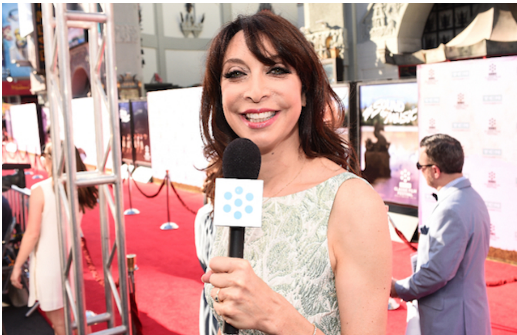
Illeana Douglas Works the Red Carpet for Turner Classic Movies