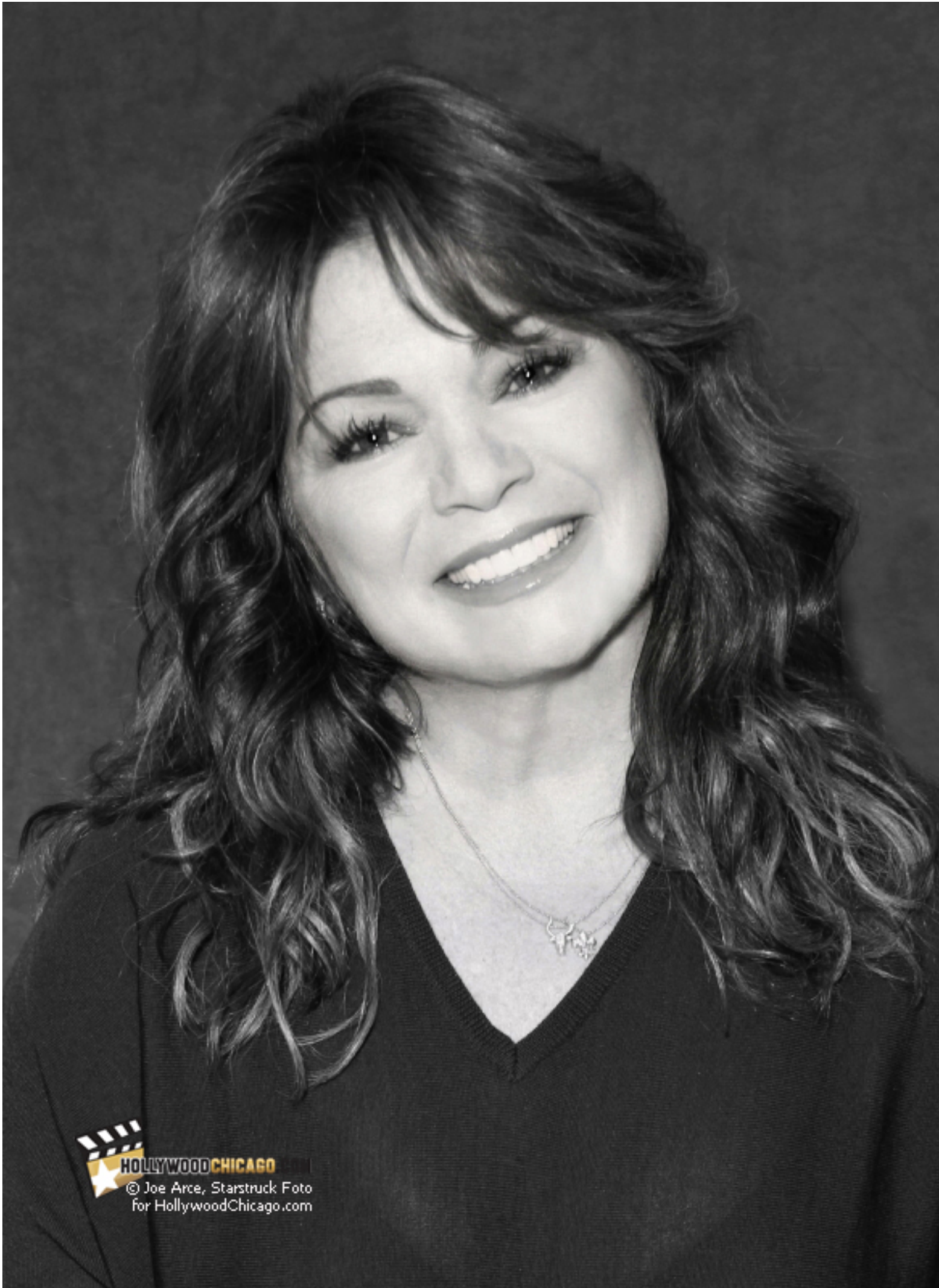
Valerie Bertinelli at Anderson's Bookshop in Downers Grove, Ill.