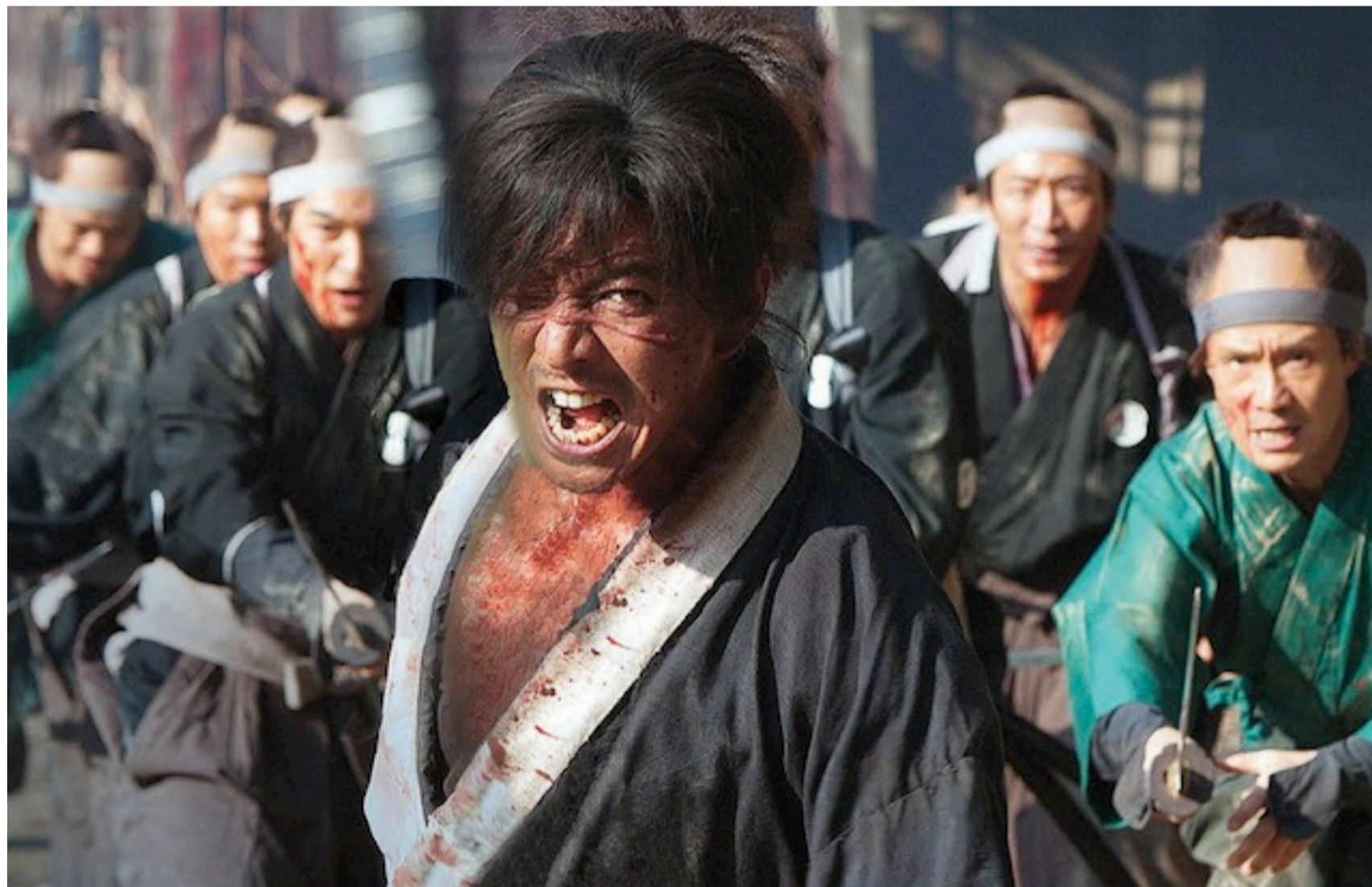
'Blade of the Immortal,' Directed by Takashi Miike