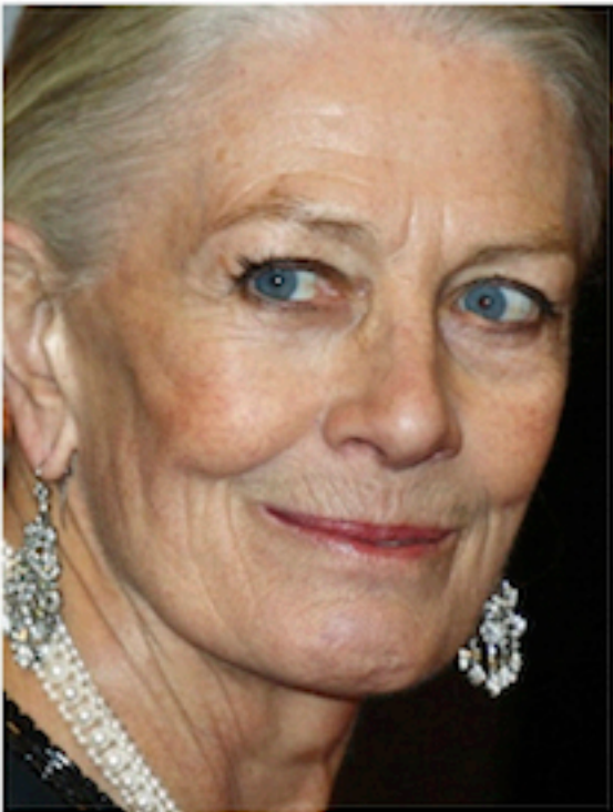
Patrick Stewart, Alfre Woodard and Vanessa Redgrave to Appear at the 53rd

Photo credit: Chicago International Film Festival