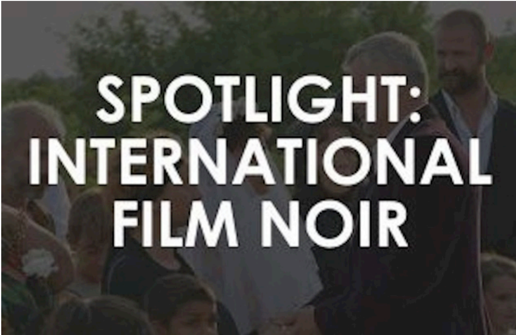
One of the Exciting Spotlights of the 53rd

If you have specific interests, the Film Festival can fulfill them. Take a deep breath, and indulge in International, New Directors and the Documentary Competitions. Partake in the U.S. Indies and extremely popular “After Dark” series. Get illuminated by the “Spotlight” category, honoring Architecture and International Film Noir. Engage in the Festival’s panorama on local “City & State” films, Black Perspectives, the LGBTQ+ Outlook Competition, the Cinemas of the Americas and the Short film programs, which encompass all of those subject categories in a more compact running time. Exhale.