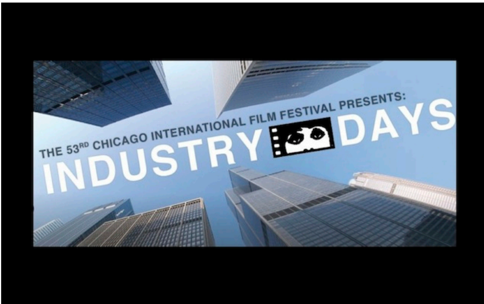
Industry Days