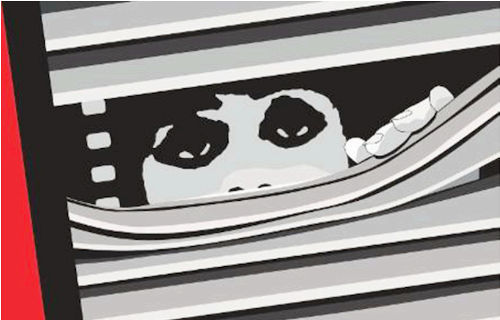
Time for a Peek, October 12-26

This recent addition to Festival events has proven to be one of its most popular. Industry Days is a hub for filmmakers and industry professional to connect, share ideas and find inspiration. From October 19th through the 22nd, the “Days” highlight current and future trends in the art/industry of movie making. Panels are open to the general public and to Industry Days badge holders (see information on the website link below). If you’re interested in the business of show business, Industry Days can be a vital participation.