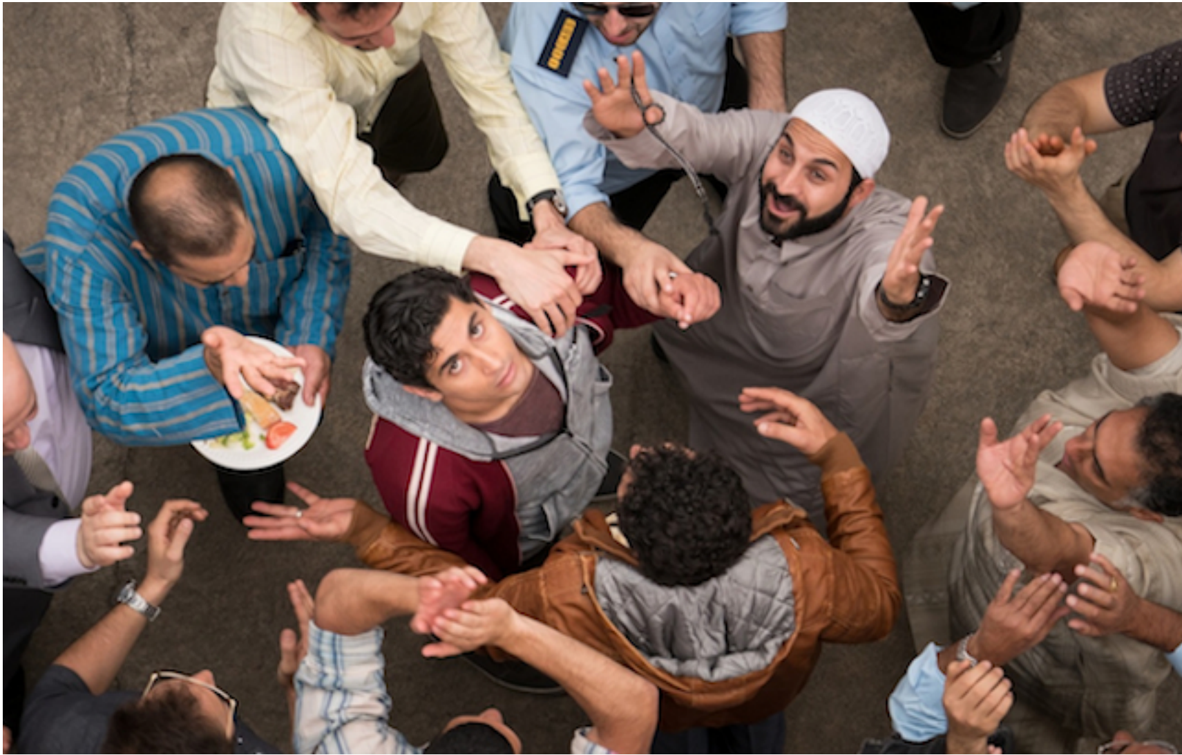
'Ali's Wedding' (Australia)