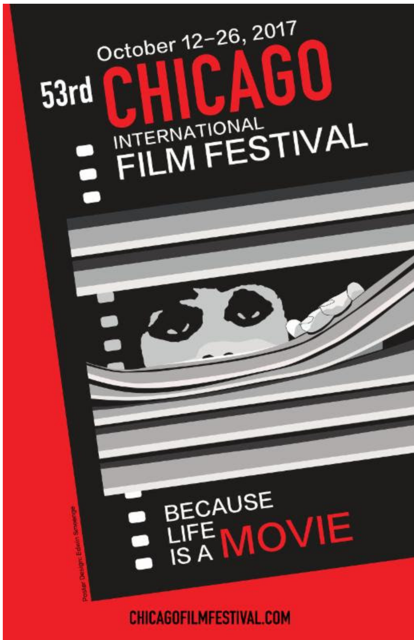
The 53rd: 'Because Life is a Movie'