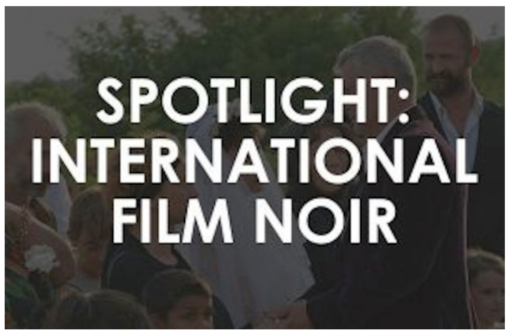
One of the Exciting Spotlights of the 53rd

If you have specific interests, the Film Festival can fulfill them. Take a deep breath, and indulge in International, New Directors and the Documentary Competitions. Partake in the U.S. Indies and extremely popular "After Dark" series. Get illuminated by the "Spotlight" category, honoring Architecture and International Film Noir. Engage in the Festival's panorama on local "City & State" films, Black Perspectives, the LGBTQ+ Outlook Competition, the Cinemas of the Americas and the Short film programs, which encompass all of those subject categories in a more compact running time. Exhale.