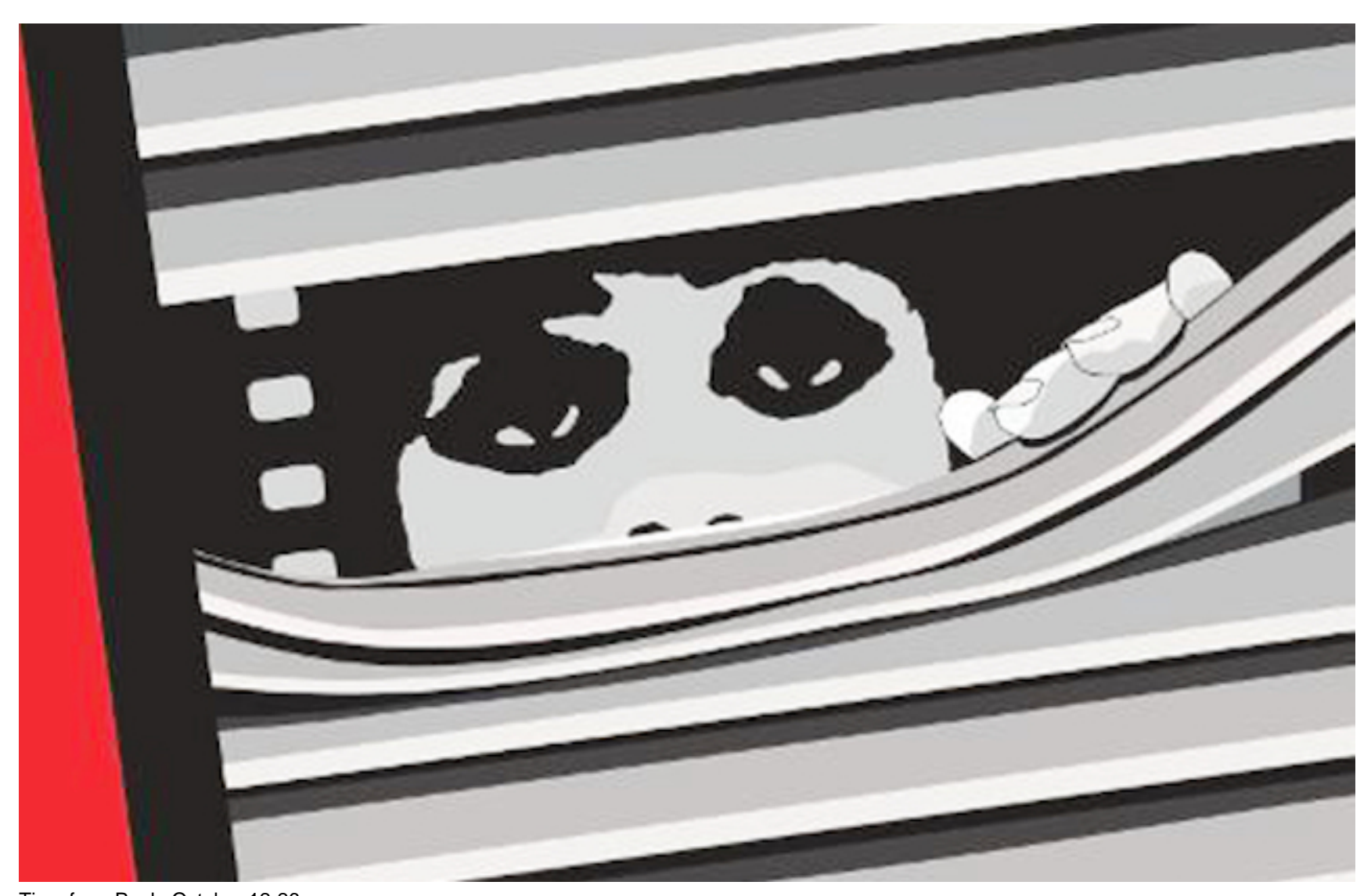
Time for a Peek, October 12-26

Do you often find yourself isolated because you want to talk in-depth about a film, and the world around you is not interested? That is impossible at the 53rd Chicago International Film Festival. Everyone is there to participate in discussion and points of view, and catching up with your fellow film travelers is a vital part of loving the Festival. Their catchphrase is your best philosophy, "Because Life is a Movie."