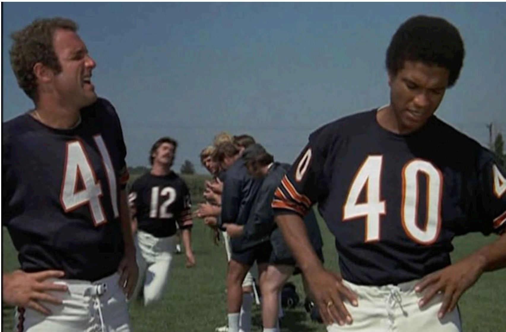
Da Boyz! James Caan and Billy Dee Williams Bear Down in 'Brian's Song'