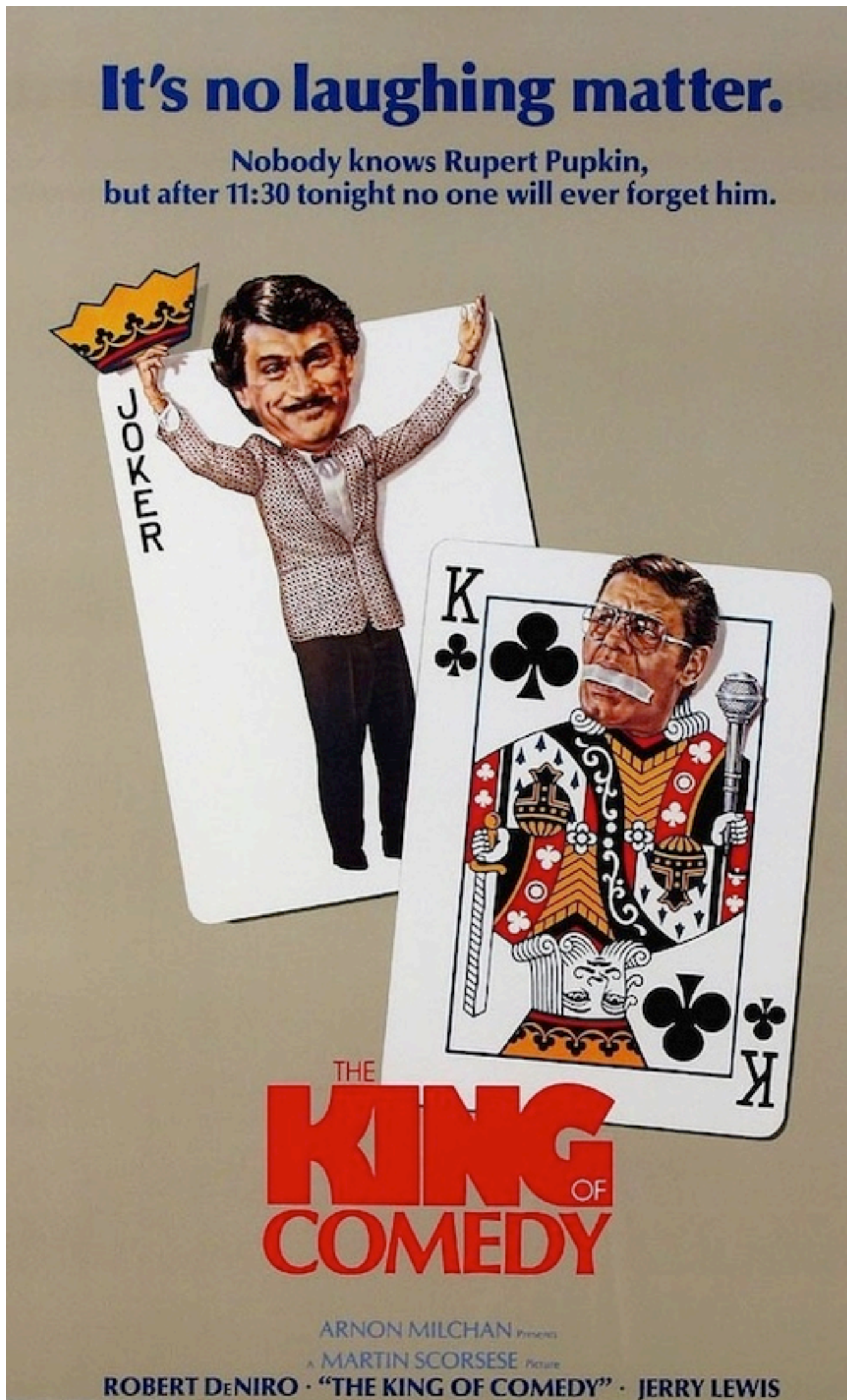
The King of Comedy