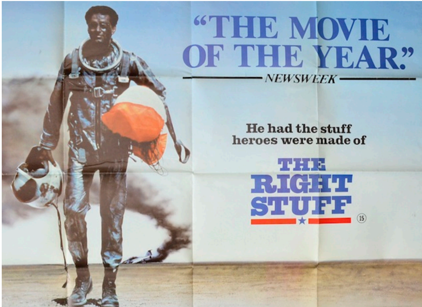
The Right Stuff