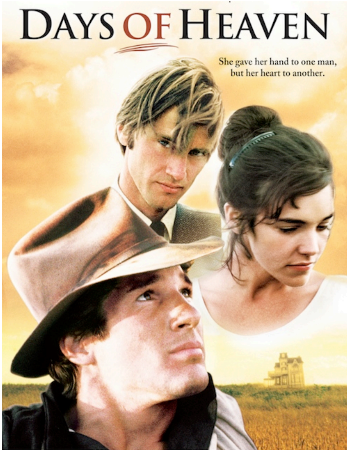
Days of Heaven