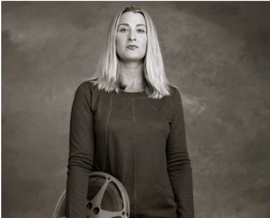
Director Laura Stewart

The 24th Chicago Underground Film Festival is an annual event showcasing independent, experimental and documentary films from around the world. Their mission is to promote films and videos that dissent radically in form, technique, or content from the “indie” mainstream, and to present adventurous works that challenge and transcend commercial and audience expectations. 25 programs comprised of narrative, documentary and experimental features, shorts, and music videos, representing more than 20 countries, make up the main body of the festival, along with nightly parties and live music, discussions and other networking and community building events. For the 2017 schedule at a glance, click here . [17]