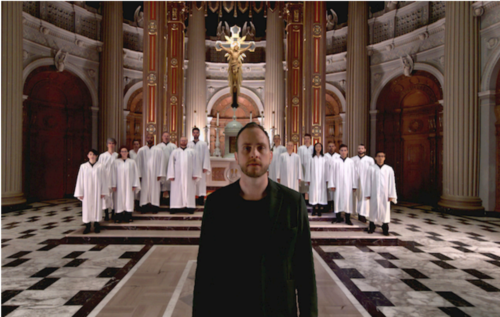
'Hallelujah'