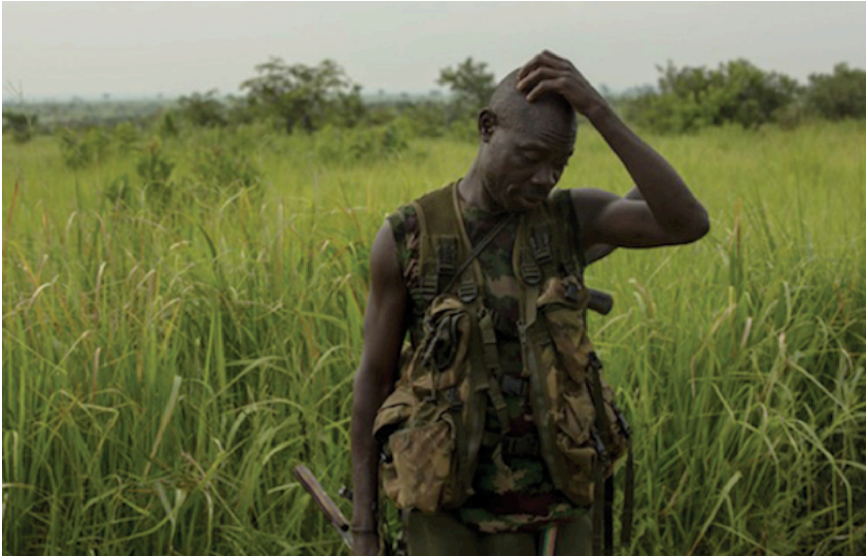
’The Protectors: Walk in the Ranger’s Shoes’