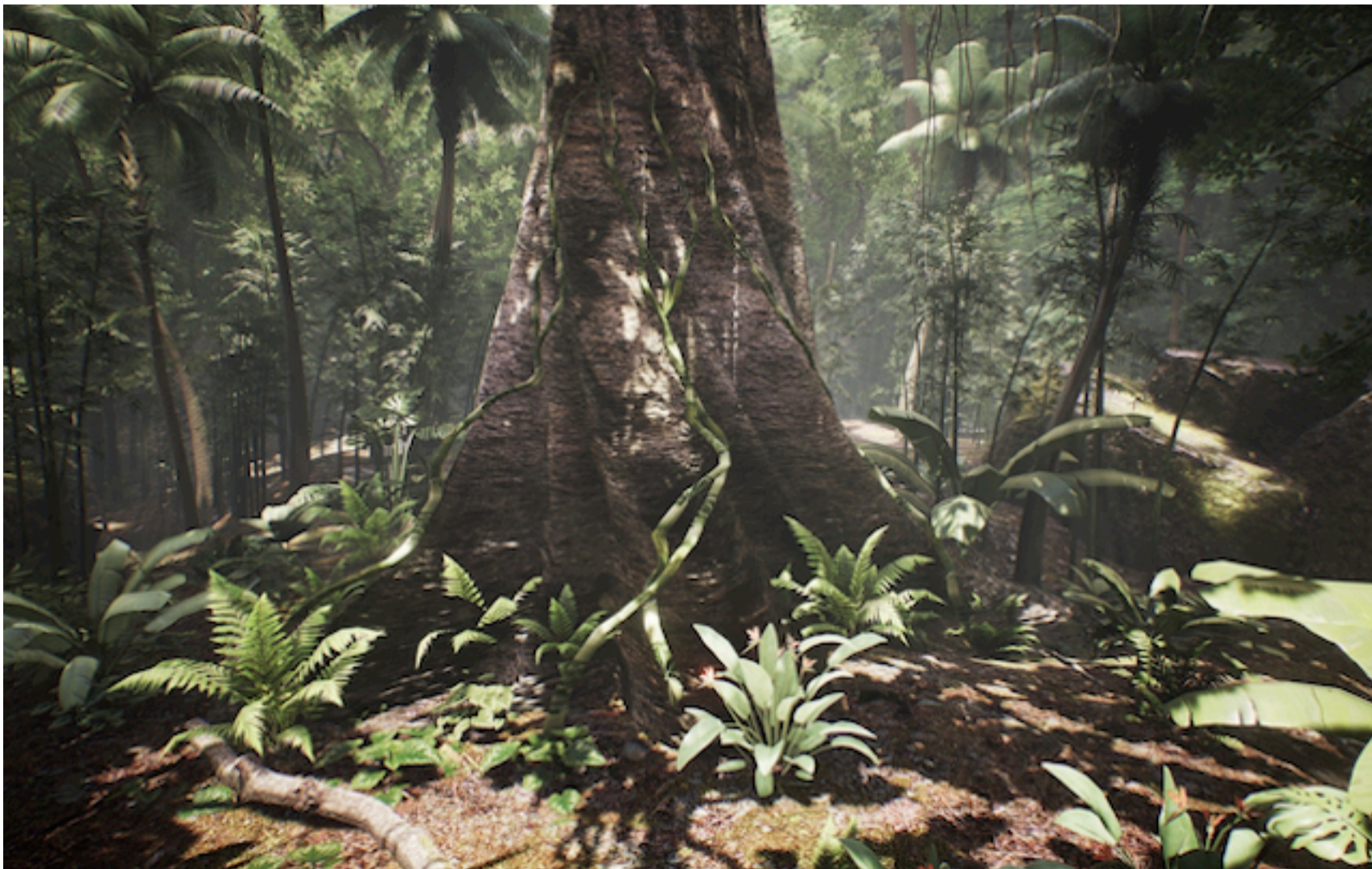
If You Were a 'Tree,' What Tree Would You Be?