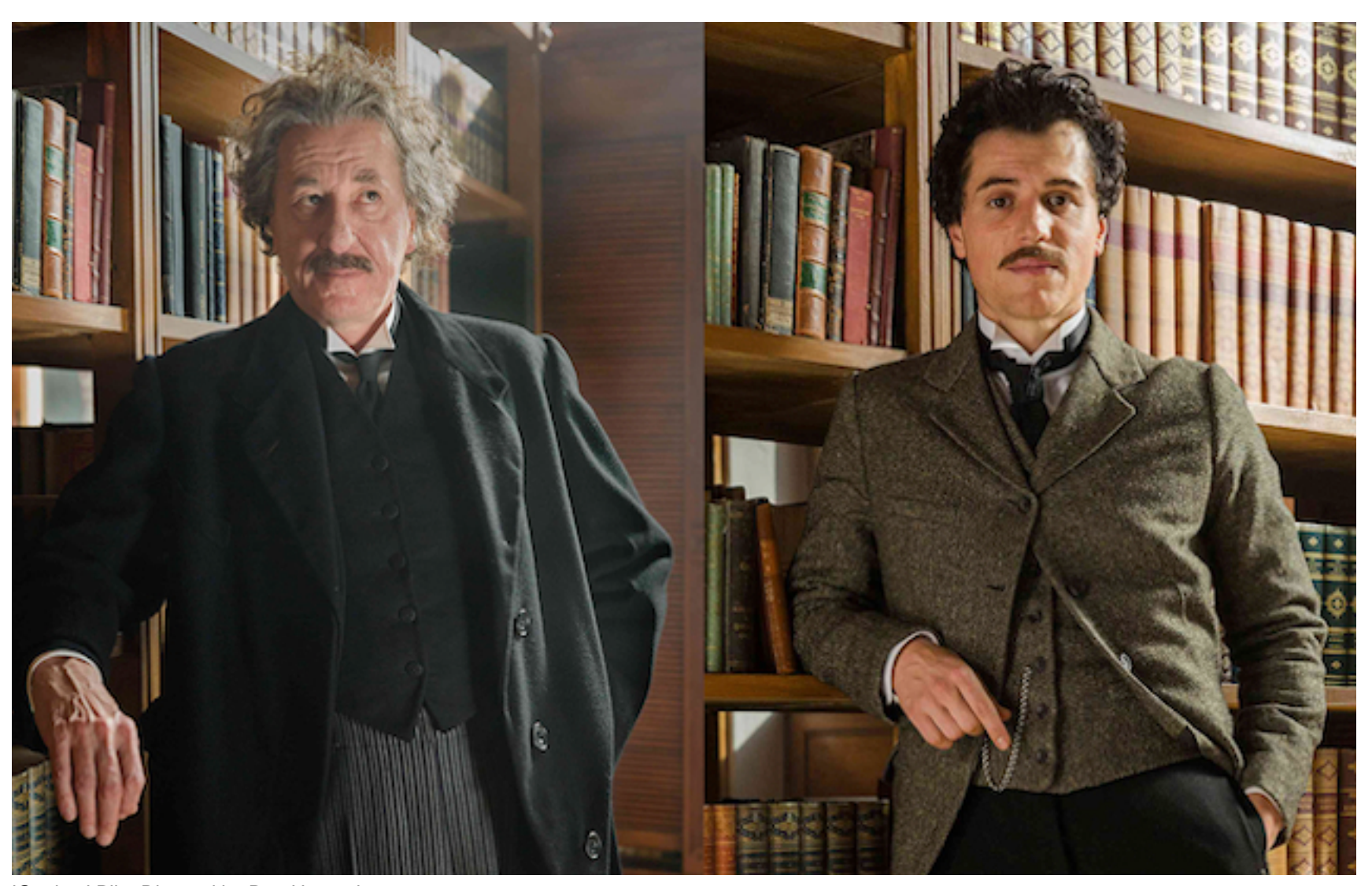
'Genius,' Pilot Directed by Ron Howard