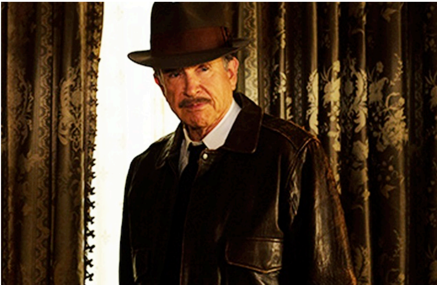
Warren Beatty as Howard Hughes in ‘Rules Don’t Apply’

The film is a quasi-biographical profile of the legendary American billionaire Howard Hughes, but don’t mention that to writer/director Beatty (who also portrays Hughes). What he wanted to explore was the truth around Hughes, in the personification of a fictional couple (Alden Ehrenreich and Lily Collins) working for the billionaire. Set in 1958 Hollywood – the same year a young Warren Beatty arrived there – the film highlights the clash between the sexual looseness that existed in the movie business, and the potential seekers that “got off the bus” in tinsel town, still mired in their 1950s puritanism.