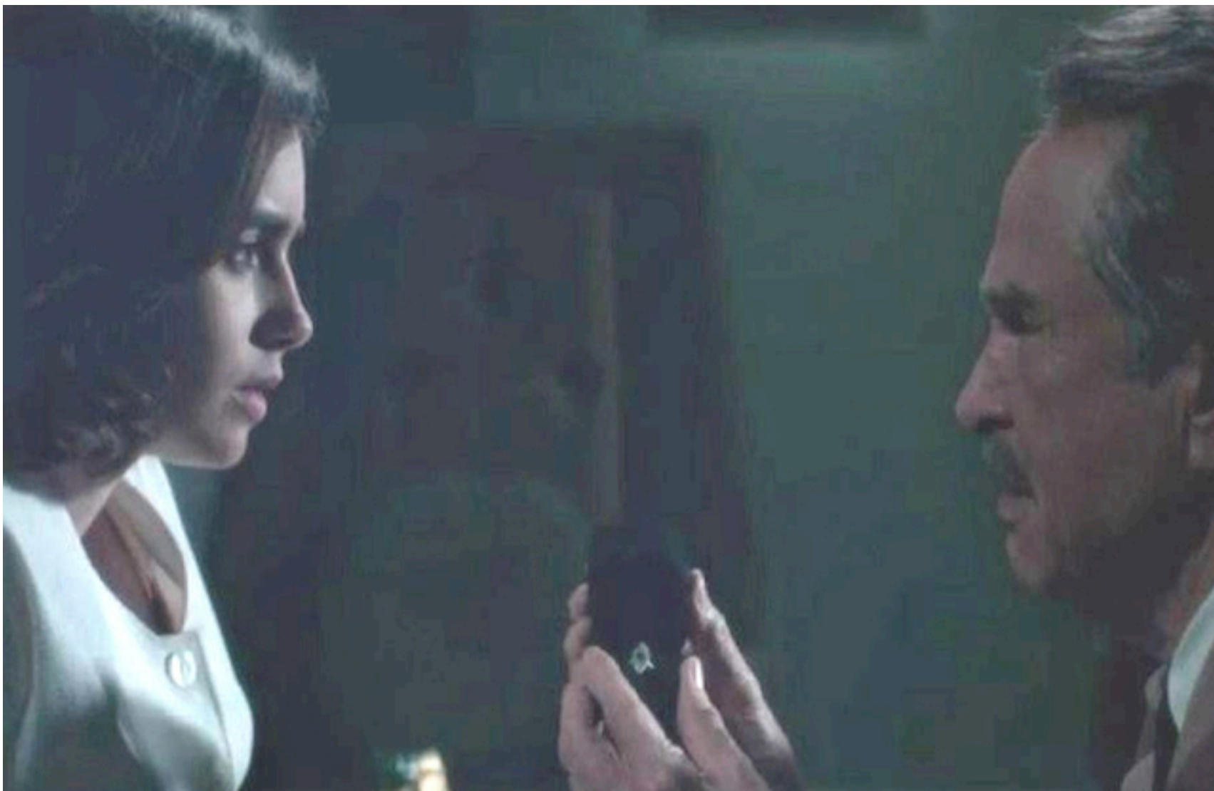
Lily Collins and Warren Beatty in 'Rules Don't Apply'

I said, 'Howard Hughes? You mean the person in the suite next door to me is Howard Hughes?' They told me that Mr. Hughes has seven suites, and five bungalows. Even then I thought that was grounds for a farce. I always held onto the comedic element of that, and put that into the film. In fact, everything that happens to Howard Hughes comes from stories that I have been told about him. They didn't happen in sequence in the film.