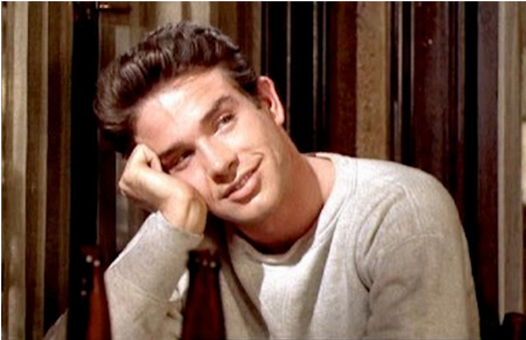
Welcome to Hollywood: Warren Beatty in 1961’s ‘Splendor in the Grass’

In the 1970s Warren Beatty continued on a path of ground-breaking films, including the Robert Altman directed “McCabe and Mrs. Miller” (1971), the conspiracy-oriented “The Parallax View” (1974) and the 1970s excess-defining “Shampoo” (1975). He made his directorial debut (with Buck Henry) on a remake of a studio-era film called “Heaven Can Wait” (1978). The success of that film set him up for his greatest triumph, as he produced, wrote, directed and starred in “Reds” (1981), portraying American reporter John Reed during the height of the Russian Revolution in 1917. It received 12 Academy Award nominations, and four for Beatty himself (Best Picture, Director, Actor and Original Screenplay). He won the Oscar for Best Director.