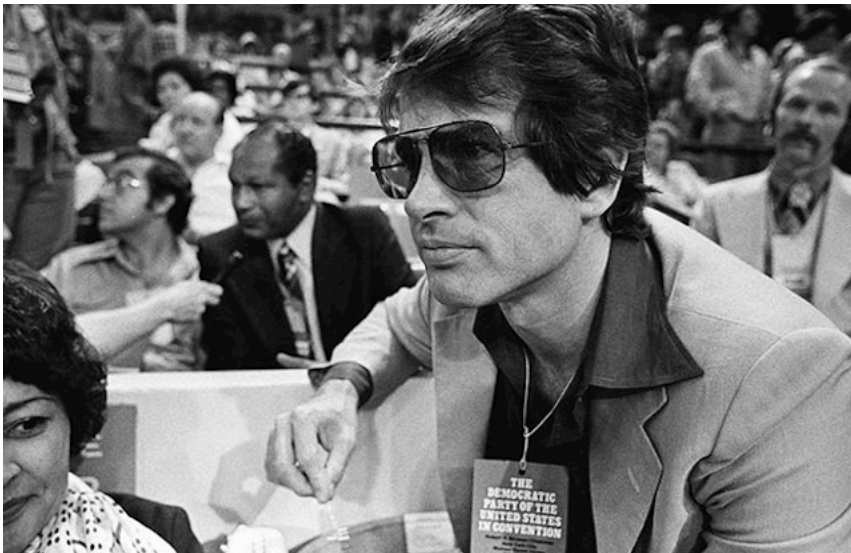
Warren Beatty at the 1976 Democratic National Convention

Beatty: Yes. I'm not being indiscreet, because Cliff Robertson did a great job, but I didn't want to do it. But in the process, I became friendly with Jack Kennedy, Pierre Salinger [Kennedy's Press Secretary] and Bobby Kennedy. I never got over those assassinations.