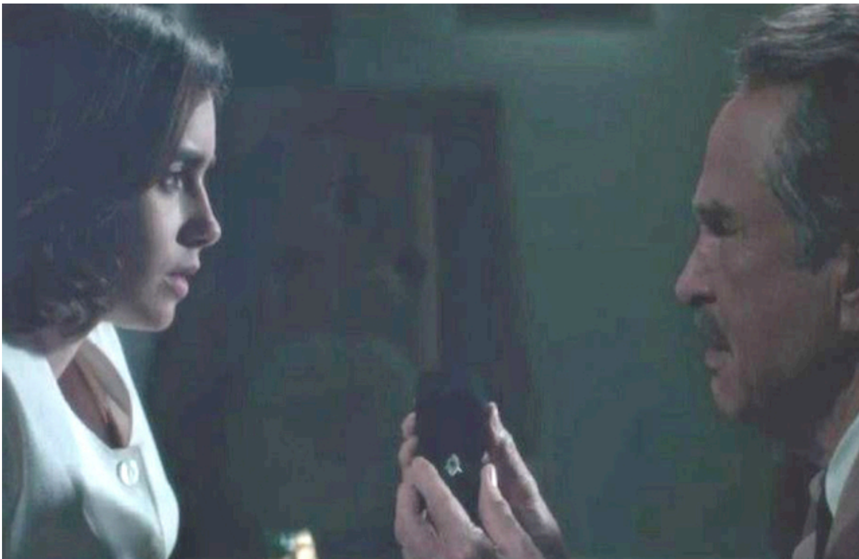
Lily Collins and Warren Beatty in ‘Rules Don’t Apply’

I said, ‘Howard Hughes? You mean the person in the suite next door to me is Howard Hughes?’ They told me that Mr. Hughes has seven suites, and five bungalows. Even then I thought that was grounds for a farce. I always held onto the comedic element of that, and put that into the film. In fact, everything that happens to Howard Hughes comes from stories that I have been told about him. They didn’t happen in sequence in the film.