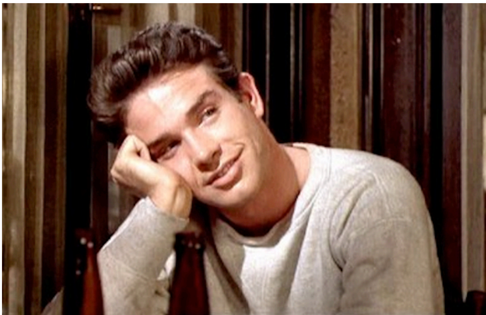
Welcome to Hollywood: Warren Beatty in 1961’s ‘Splendor in the Grass’

In the 1970s Warren Beatty continued on a path of ground-breaking films, including the Robert Altman directed “McCabe and Mrs. Miller” (1971), the conspiracy-oriented “The Parallax View” (1974) and the 1970s excess-defining “Shampoo” (1975). He made his directorial debut (with Buck Henry) on a remake of a studio-era film called “Heaven Can Wait” (1978). The success of that film set him up for his greatest triumph, as he produced, wrote, directed and starred in “Reds” (1981), portraying American reporter John Reed during the height of the Russian Revolution in 1917. It received 12 Academy Award nominations, and four for Beatty himself (Best Picture, Director, Actor and Original Screenplay). He won the Oscar for Best Director.