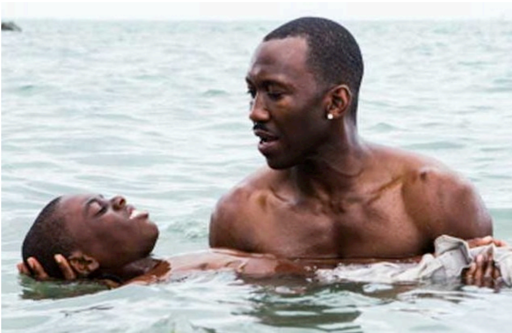
Watch the Water: Little (Alex Hibbert) is Uplifted by Juan (Mahershala Ali) in ‘Moonlight’