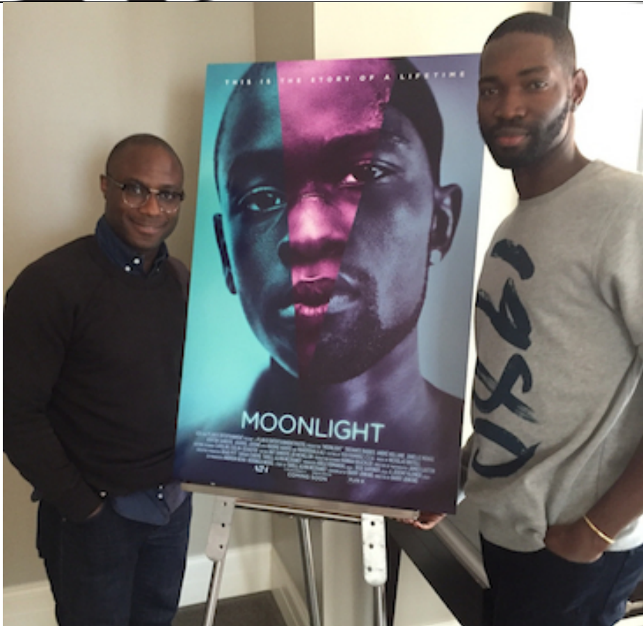
Barry Jenkins & Tarell McCraney in Chicago

McCraney: I think the character Black [adult Little] has adapted in this way, that allows him to survive. He subverts an aspect of his identity, number one, and also takes on the persona of a masculine role model that was once nurturing to him. He does it in some ways incorrectly, but he's performing it, and the performance gives him a way to survive. Kevin eventually is a working class person, and enjoys what he does. I love that we get to him, and he's a working man by then, and has flipped what we saw when he was a teenager.