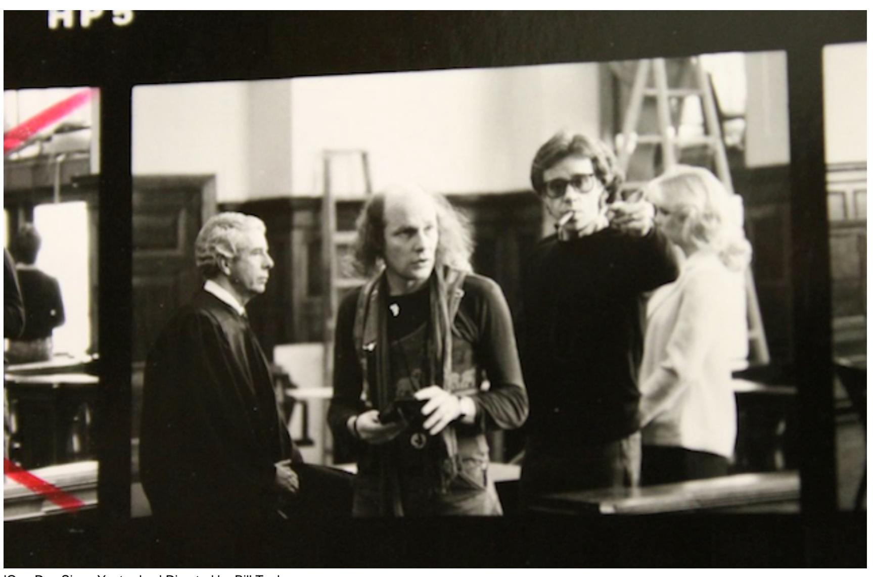
'One Day Since Yesterday,' Directed by Bill Teck

"One Day Since Yesterday" (United States)