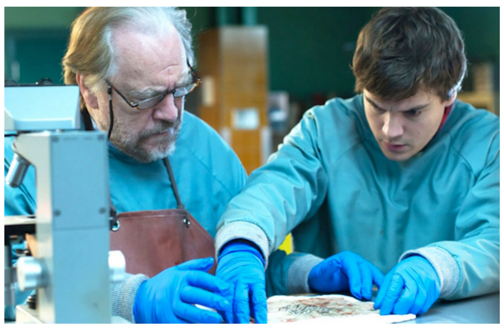
'The Autopsy of Jane Doe,' Directed by Andre Ovredal