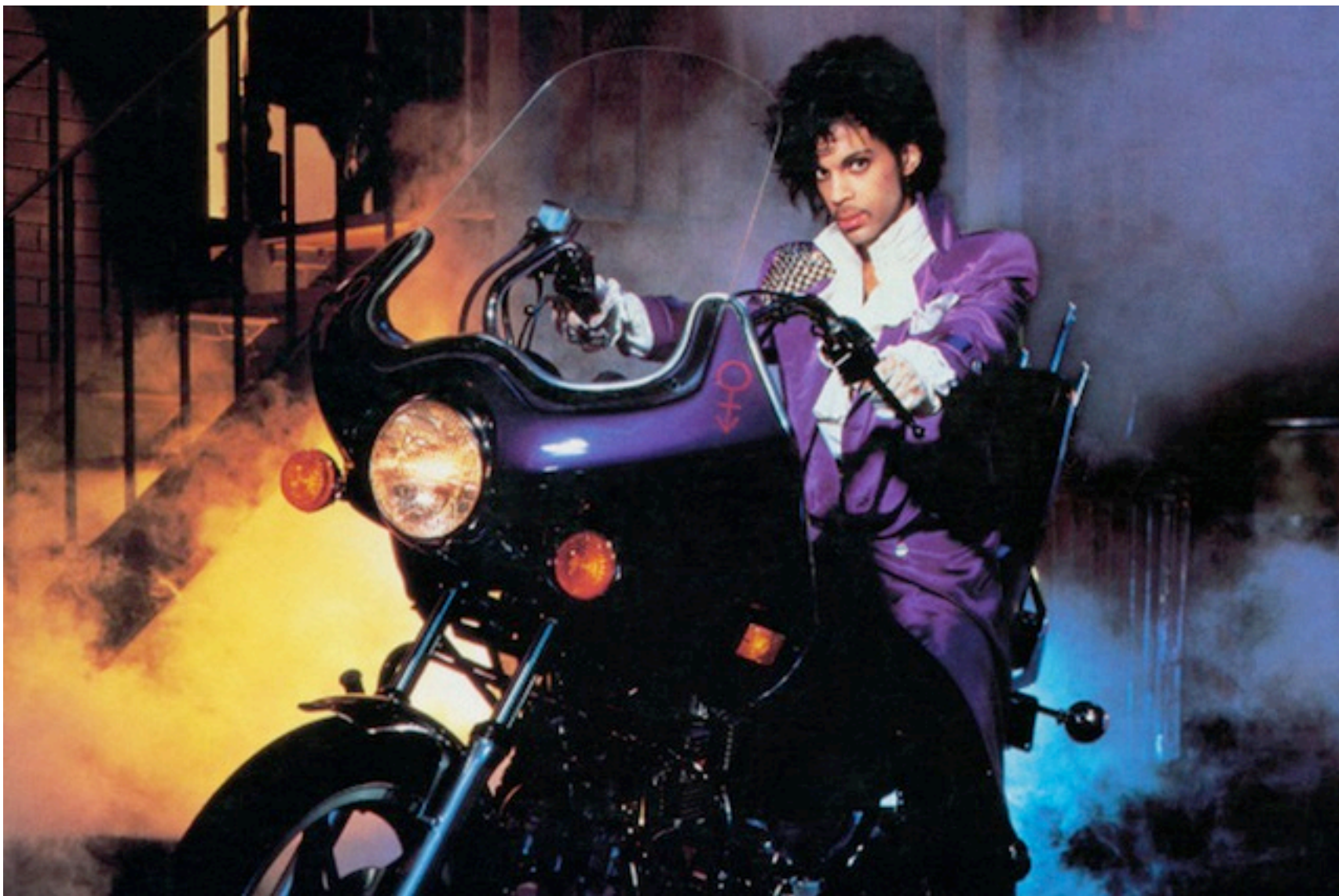
Prince, During the Time of 'Purple Rain'