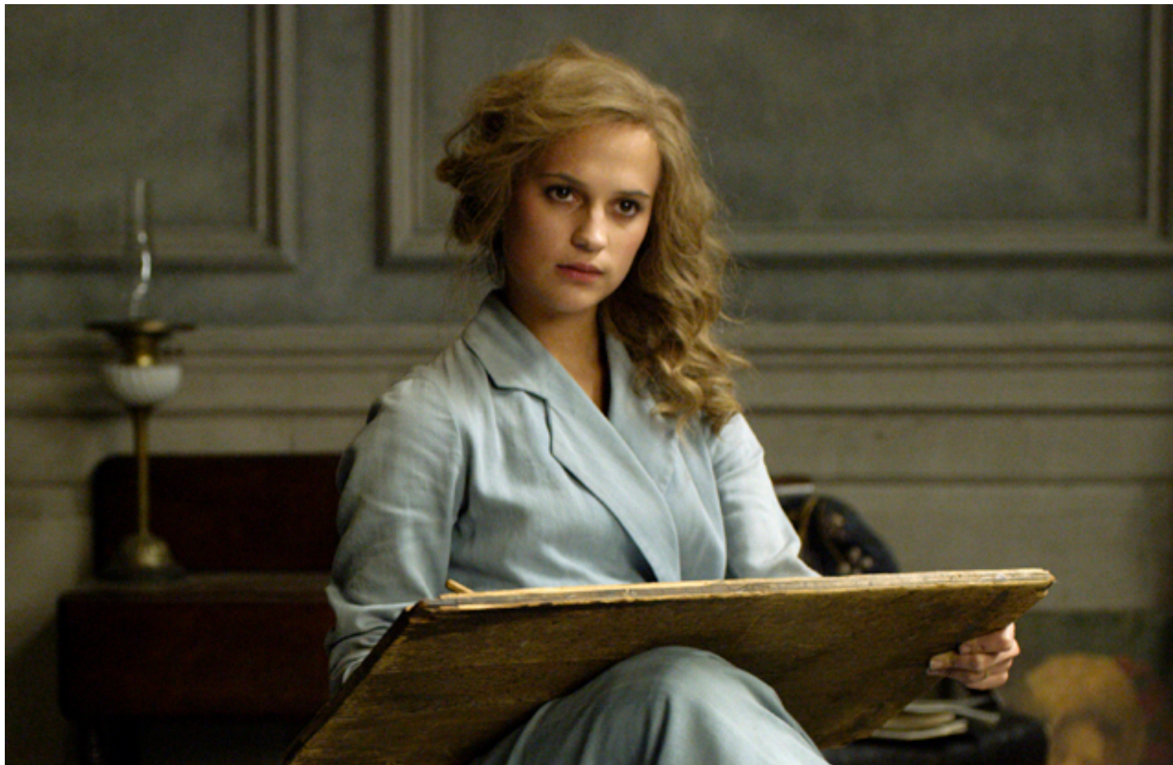
Alicia Vikander in 'The Danish Girl'