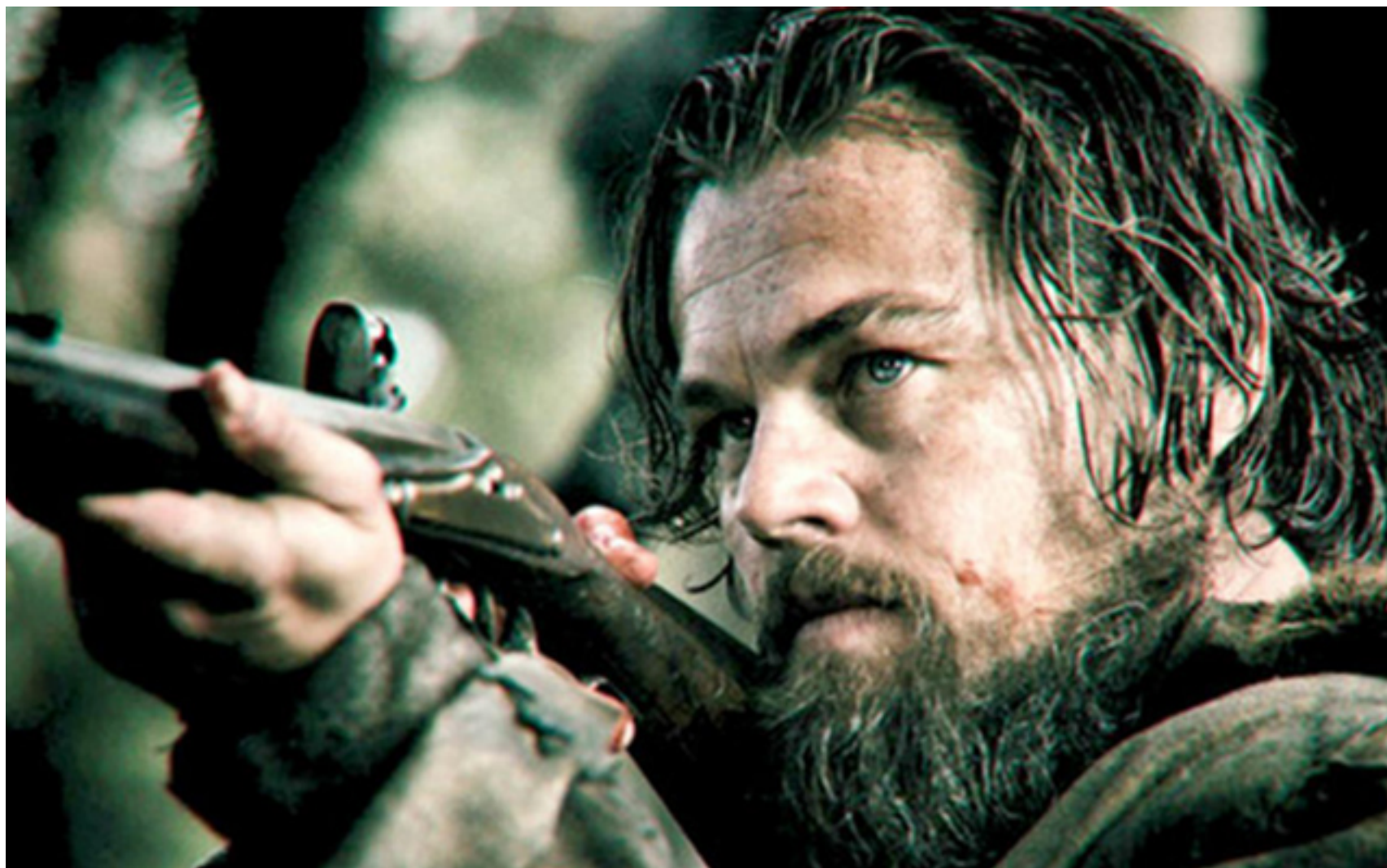
Leonardo DiCaprio in 'The Revenant'

Should Have Been Nominated: Tom Courtenay “45 Years” (PM), Michael B. Jordan “Creed” (SW).