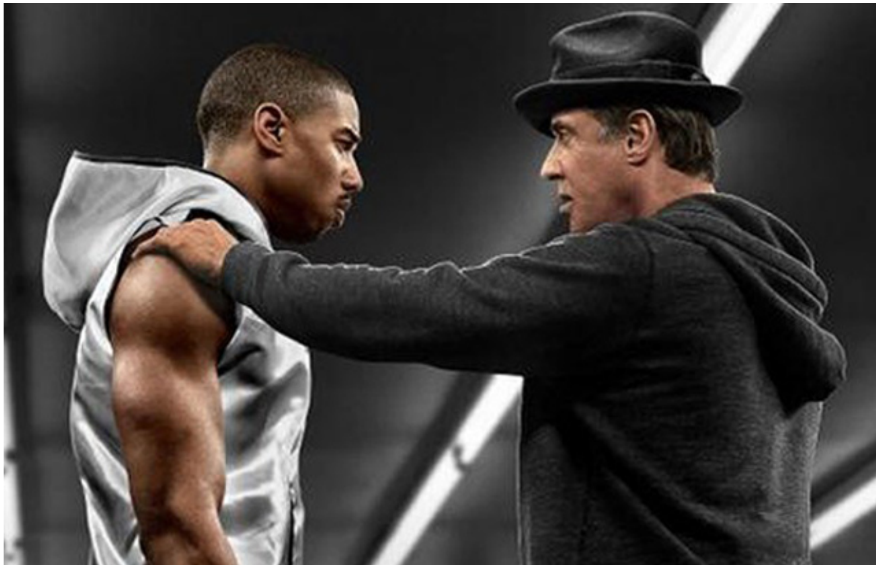
Michael B. Jordan and Sylvester Stallone in 'Creed'