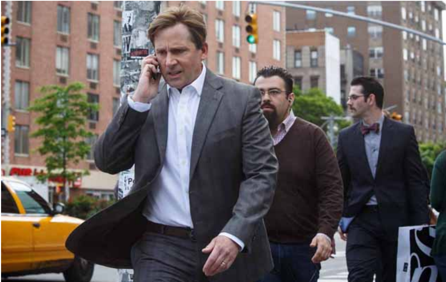
Steve Carell in 'The Big Short'