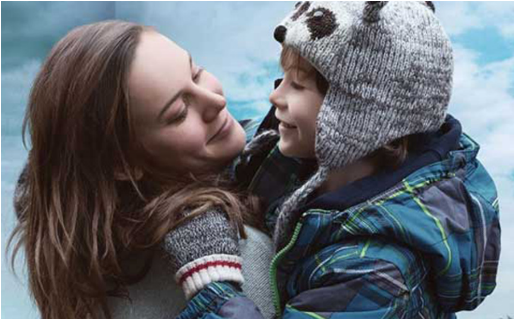
Brie Larson in 'Room'

Should Have Been Nominated: Charlize Theron "Mad Max: Fury Road" (PM, SW)