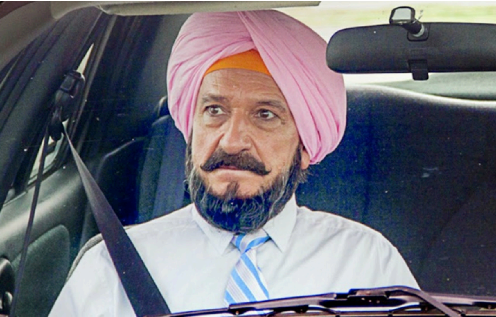
Sir Ben Kingsley in 'Learning to Drive'