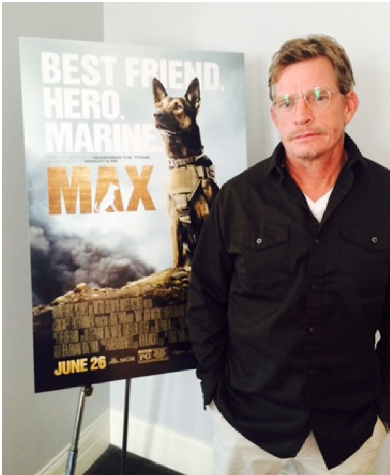
Thomas Haden Church for 'Max'