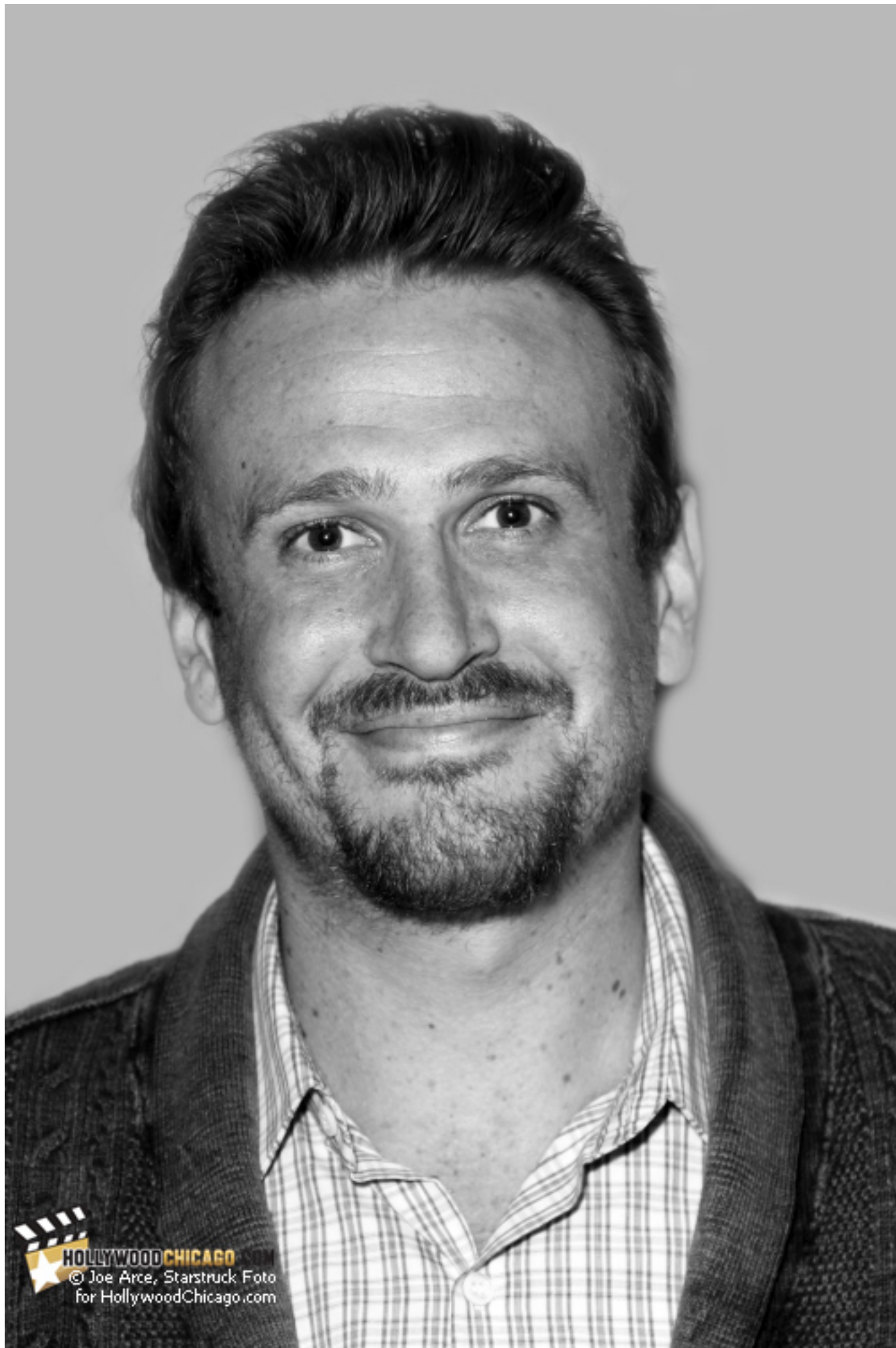
Actor Jason Segel for 'The End of the Tour'