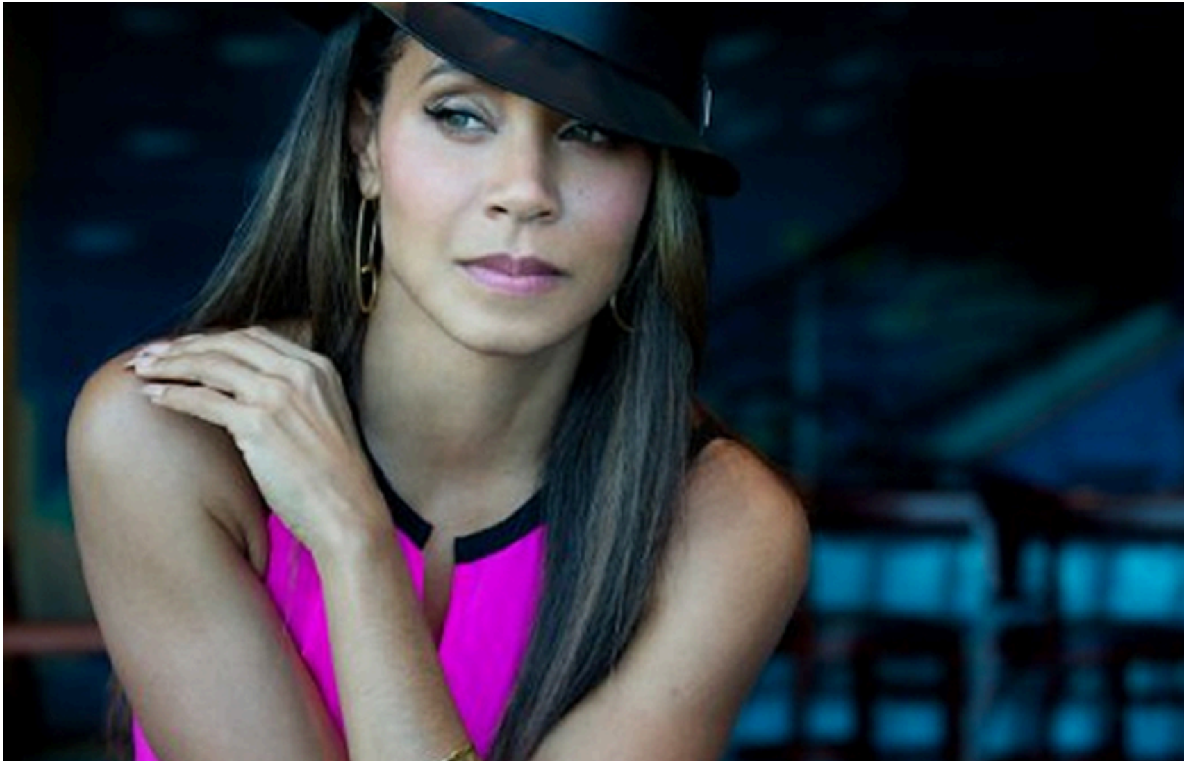
Jada Pinkett Smith in ‘Magic Mike XXL’