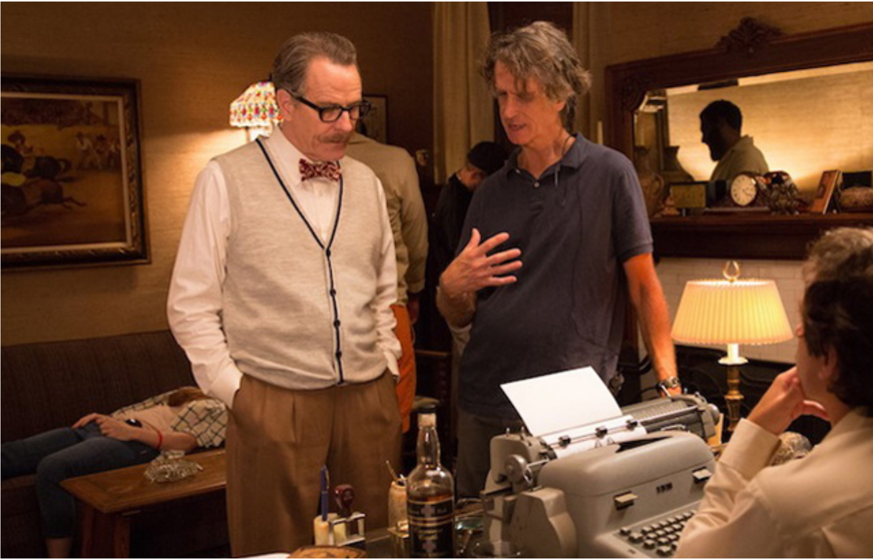
Bryan Cranston and Jay Roach On the Set of 'Trumbo'