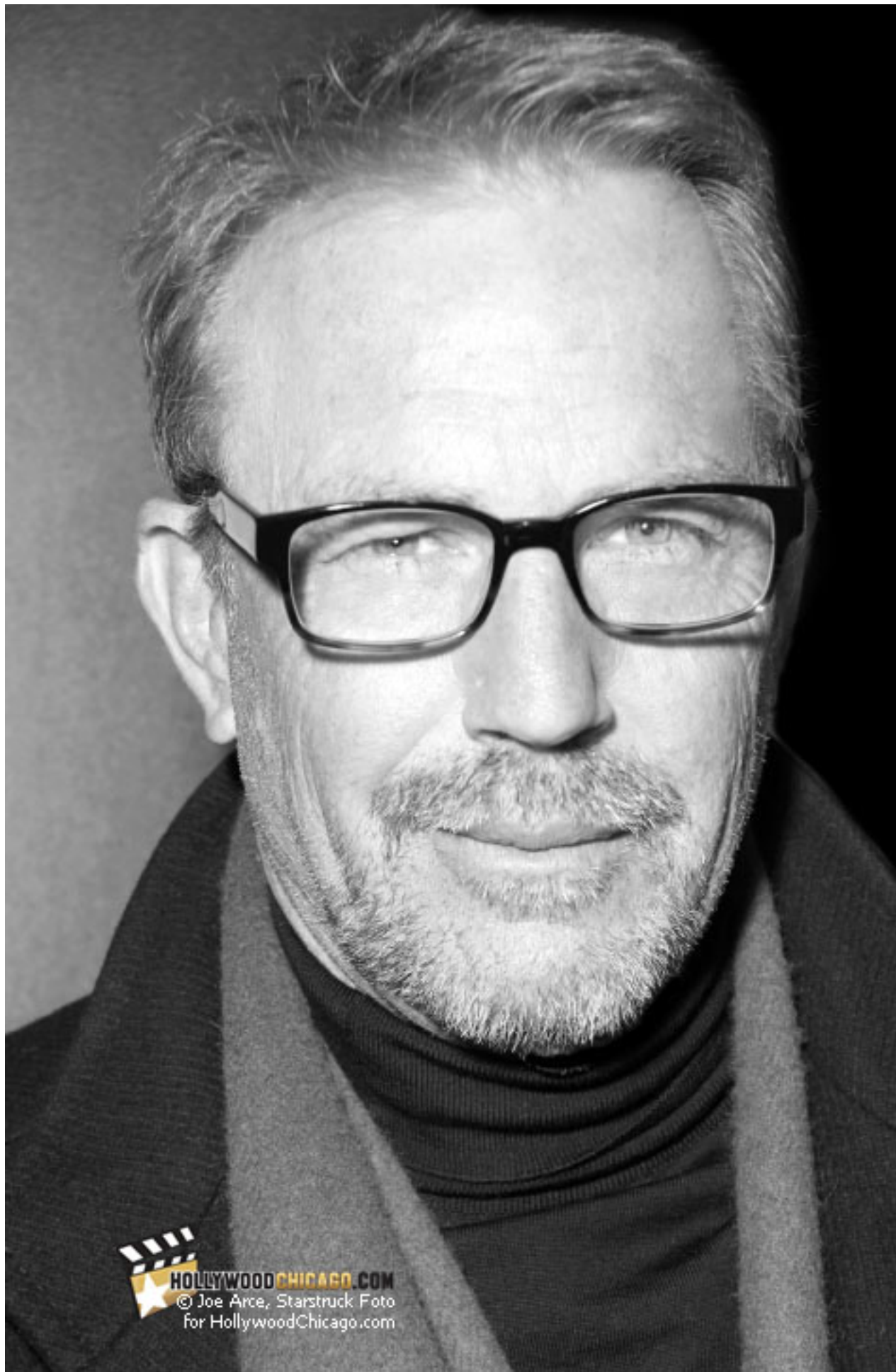
Kevin Costner in Chicago, January 9th, 2015, for 'Black or White'