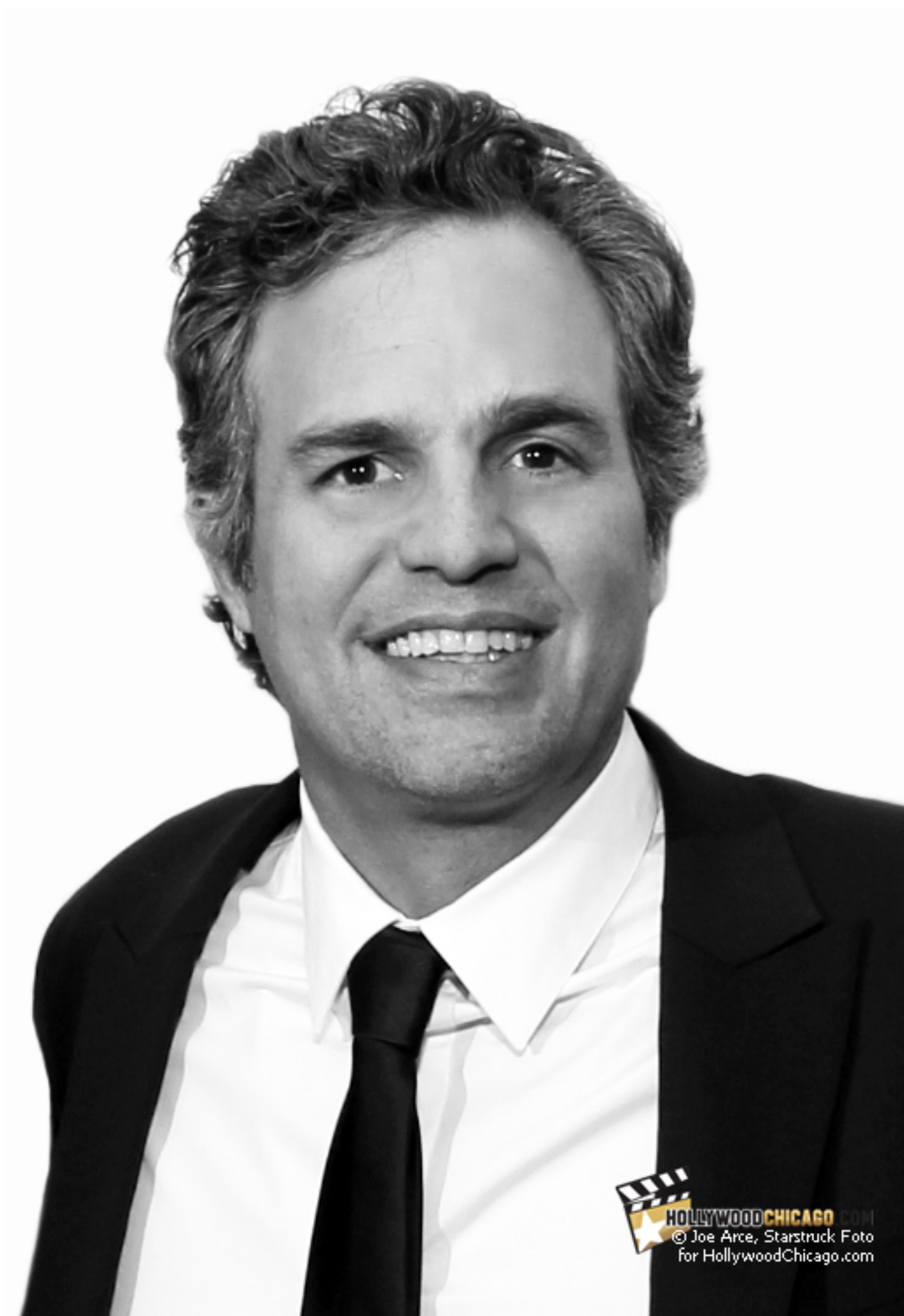
Actor Mark Ruffalo on the Red Carpet