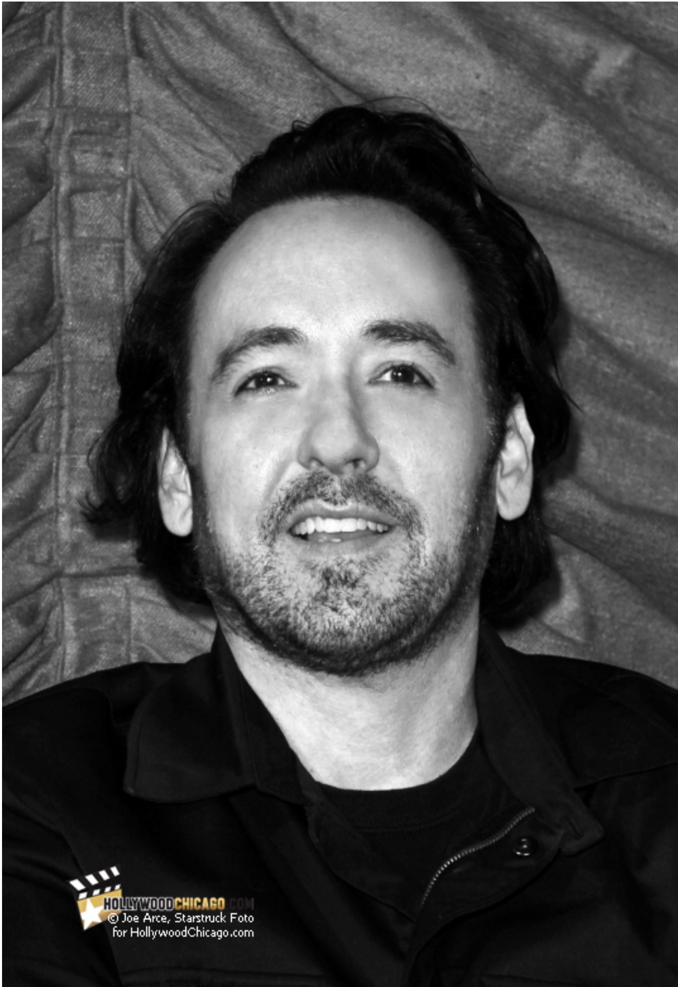
John Cusack in Chicago, May 18th, 2015, at the Music Box Theatre