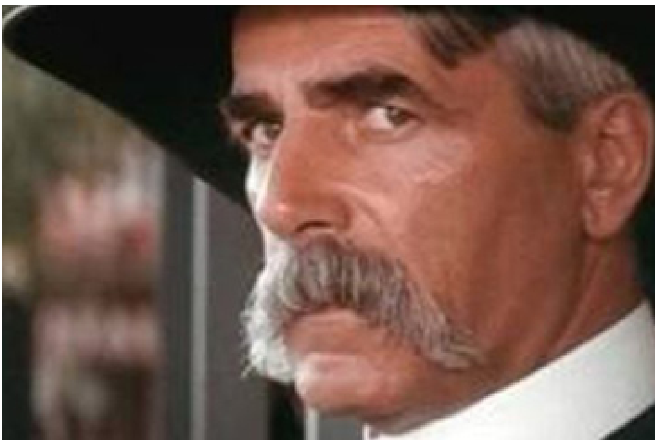
How the West is Won: Sam Elliott in ‘3:10 to Yuma’