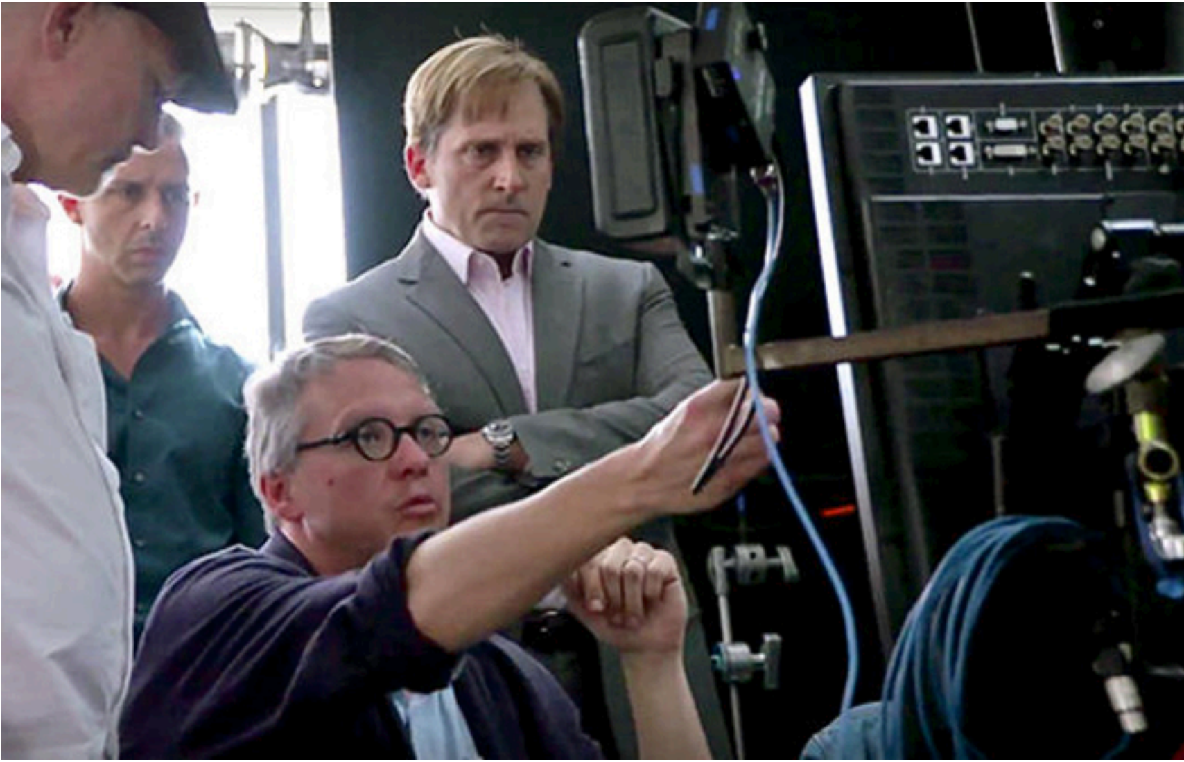
Adam McKay (left) and Steve Carell Discuss a Scene in 'The Big Short'