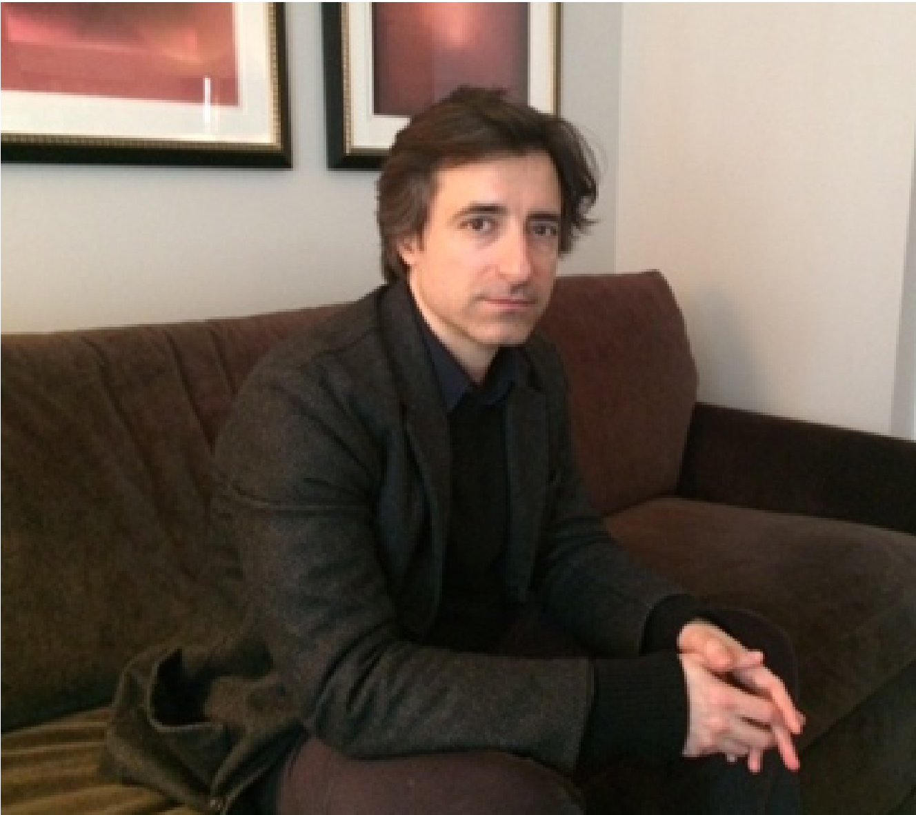
Director Noah Baumbach