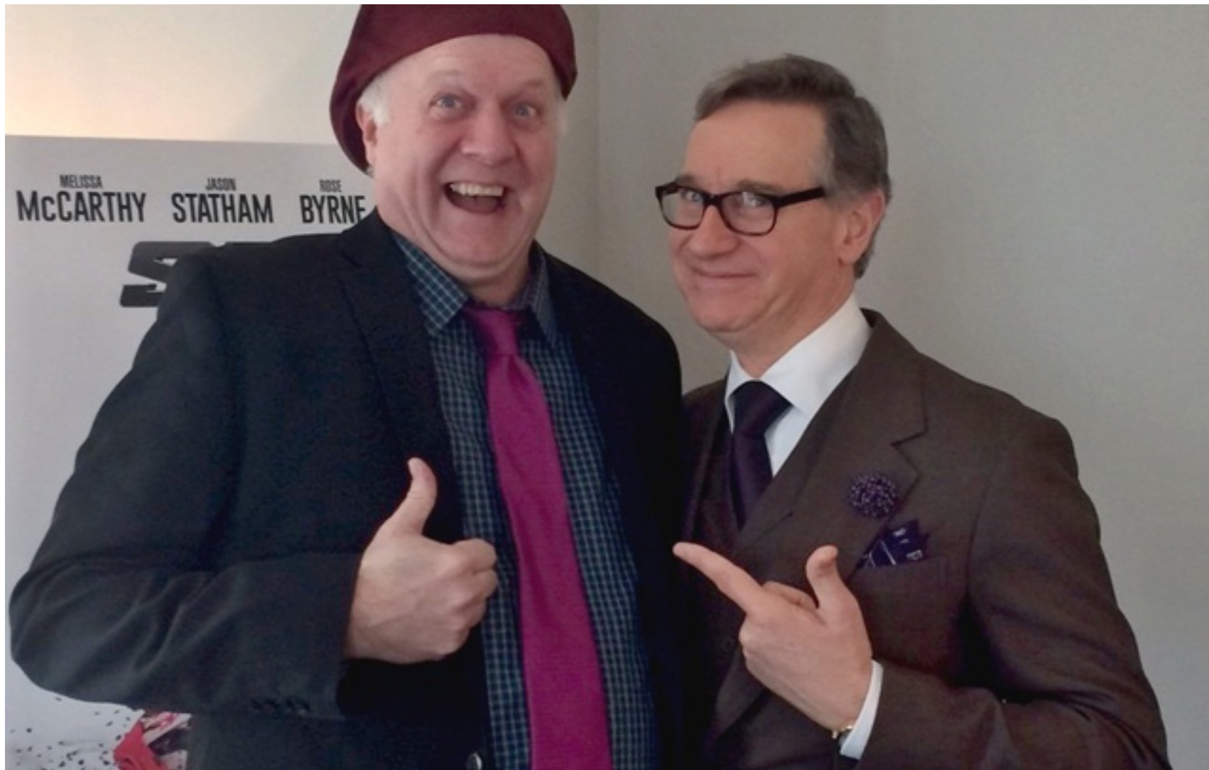
The Interviewer and Director Paul Feig