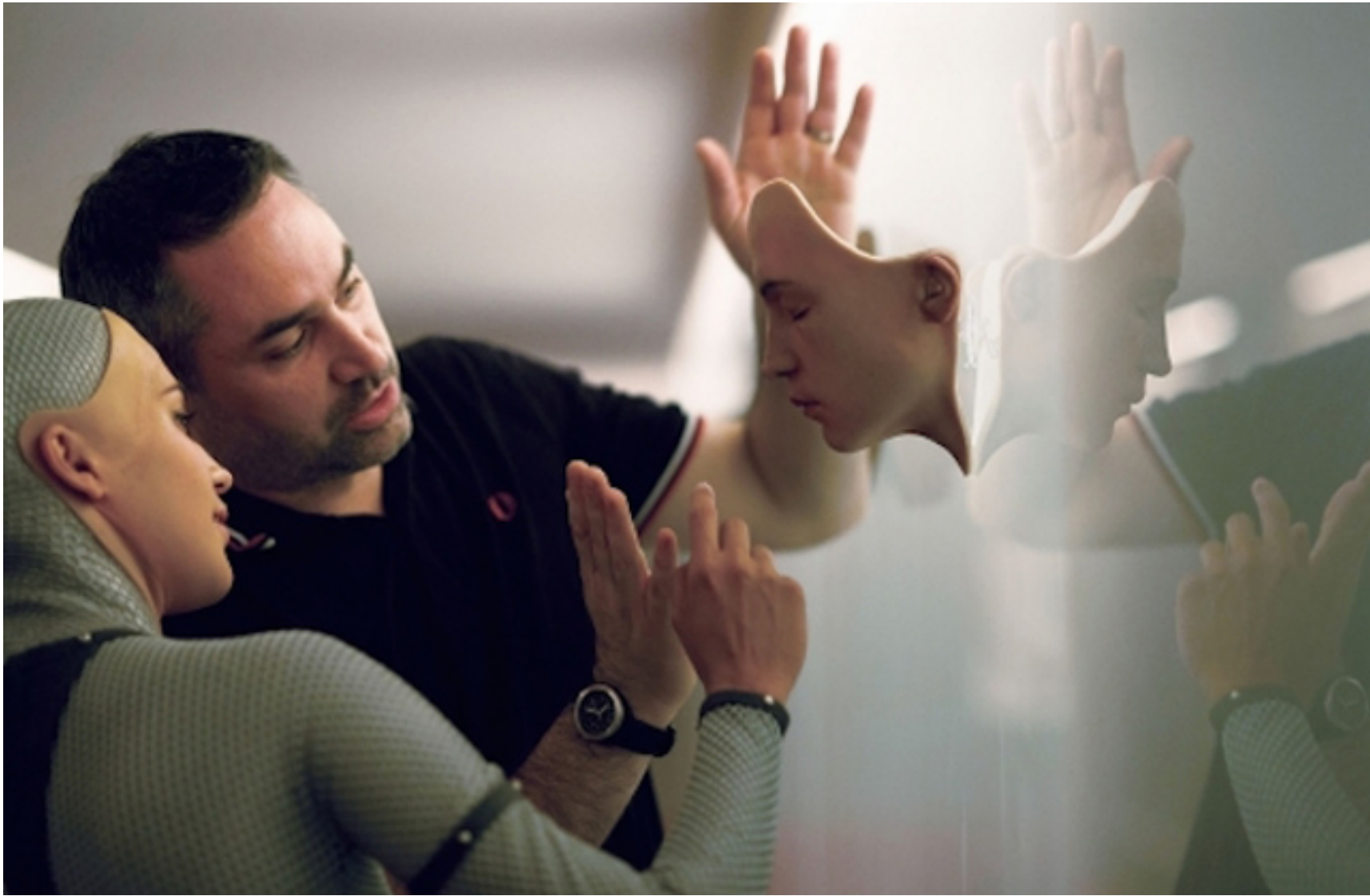
Lead Actor Alicia Vikander Talks On-Set with Alex Garland for 'Ex Machina'