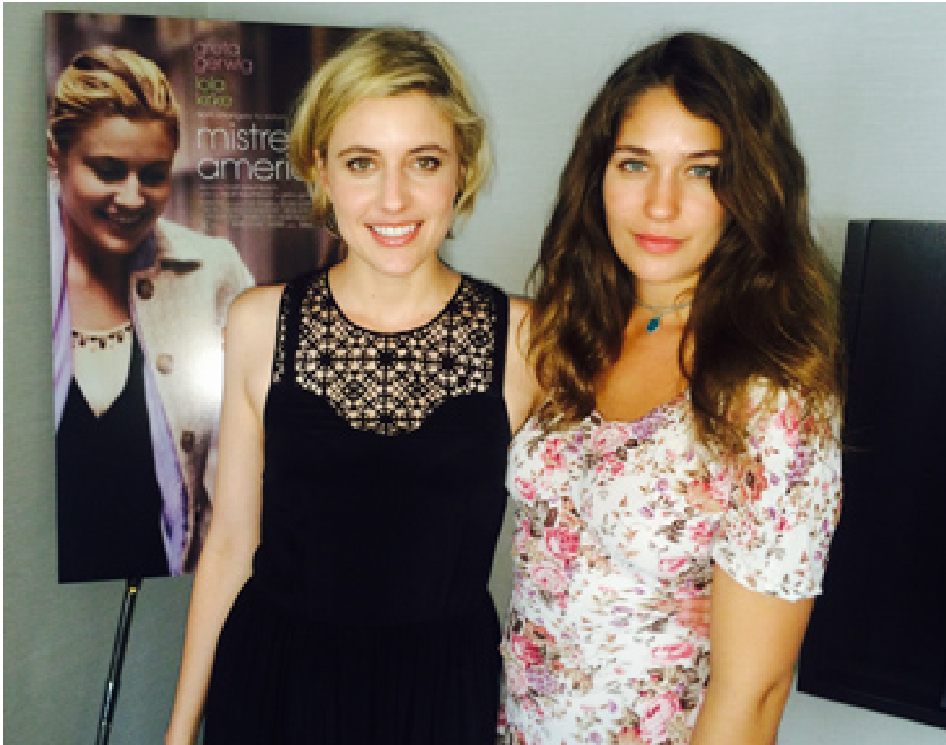
Greta Gerwig and Lola Kirke Promote 'Mistress America'