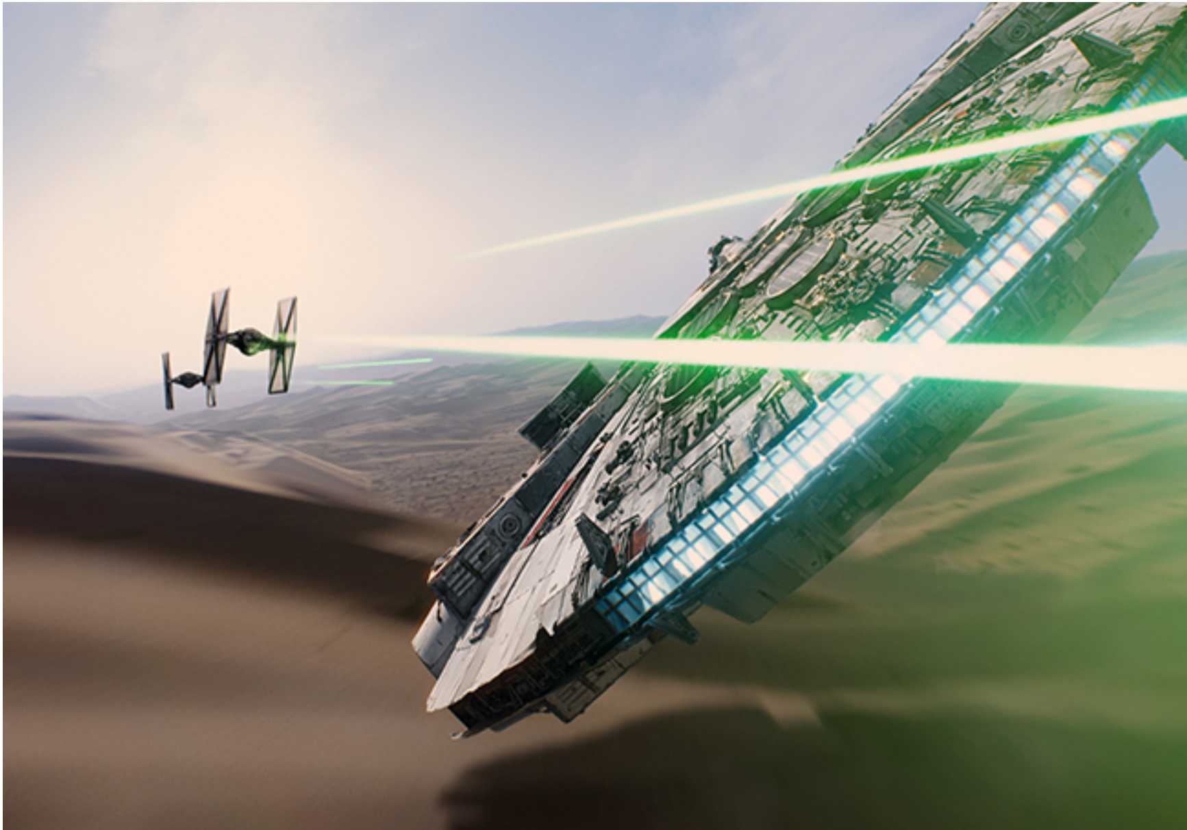
AFTER: Ciara McAvoy's Millennium Falcon as used in "Star Wars: Episode VII - The Force Awakens".