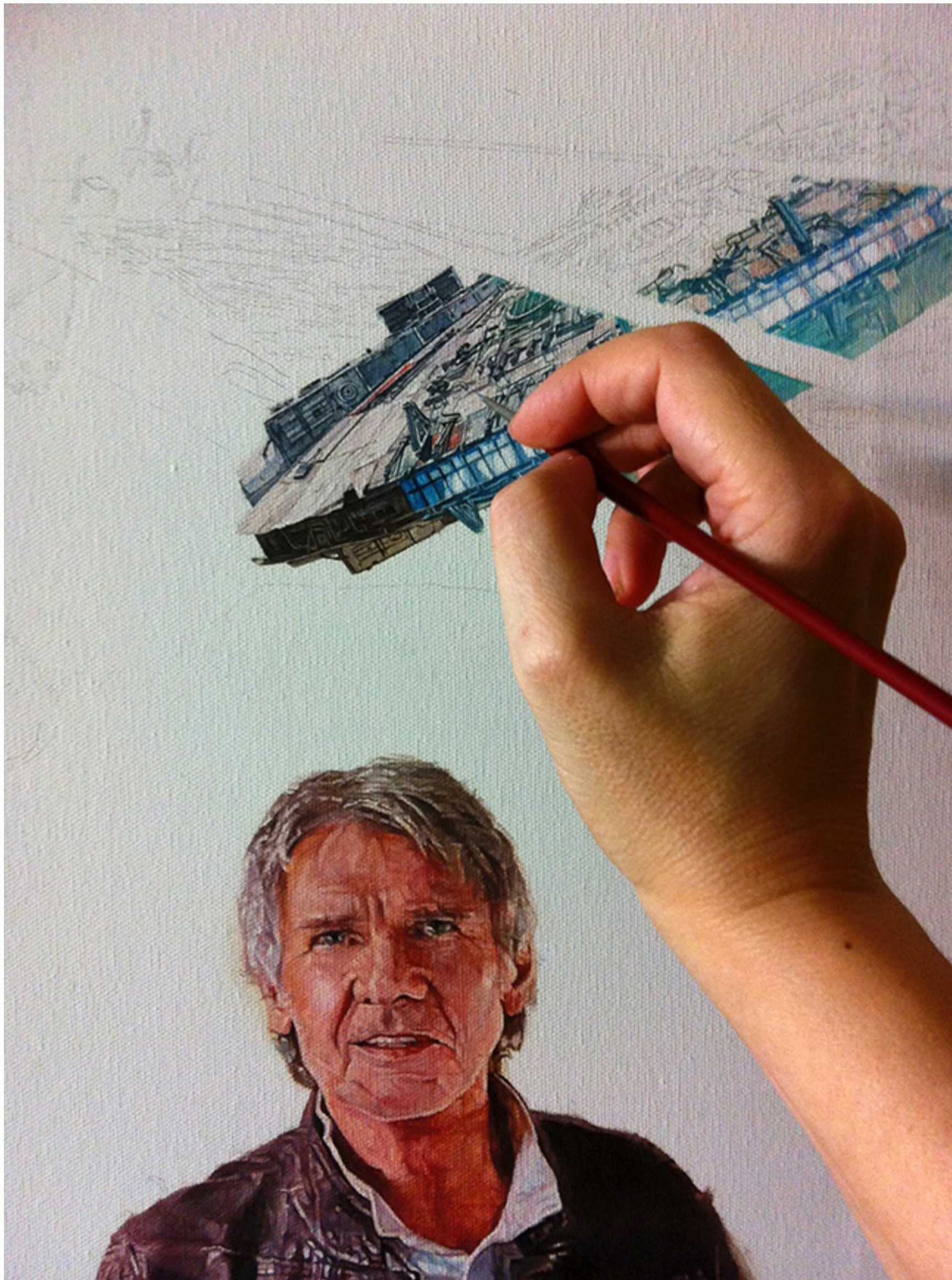
Ciara McAvoy's sketch of the Millennium Falcon for "Star Wars: Episode VII - The Force Awakens".