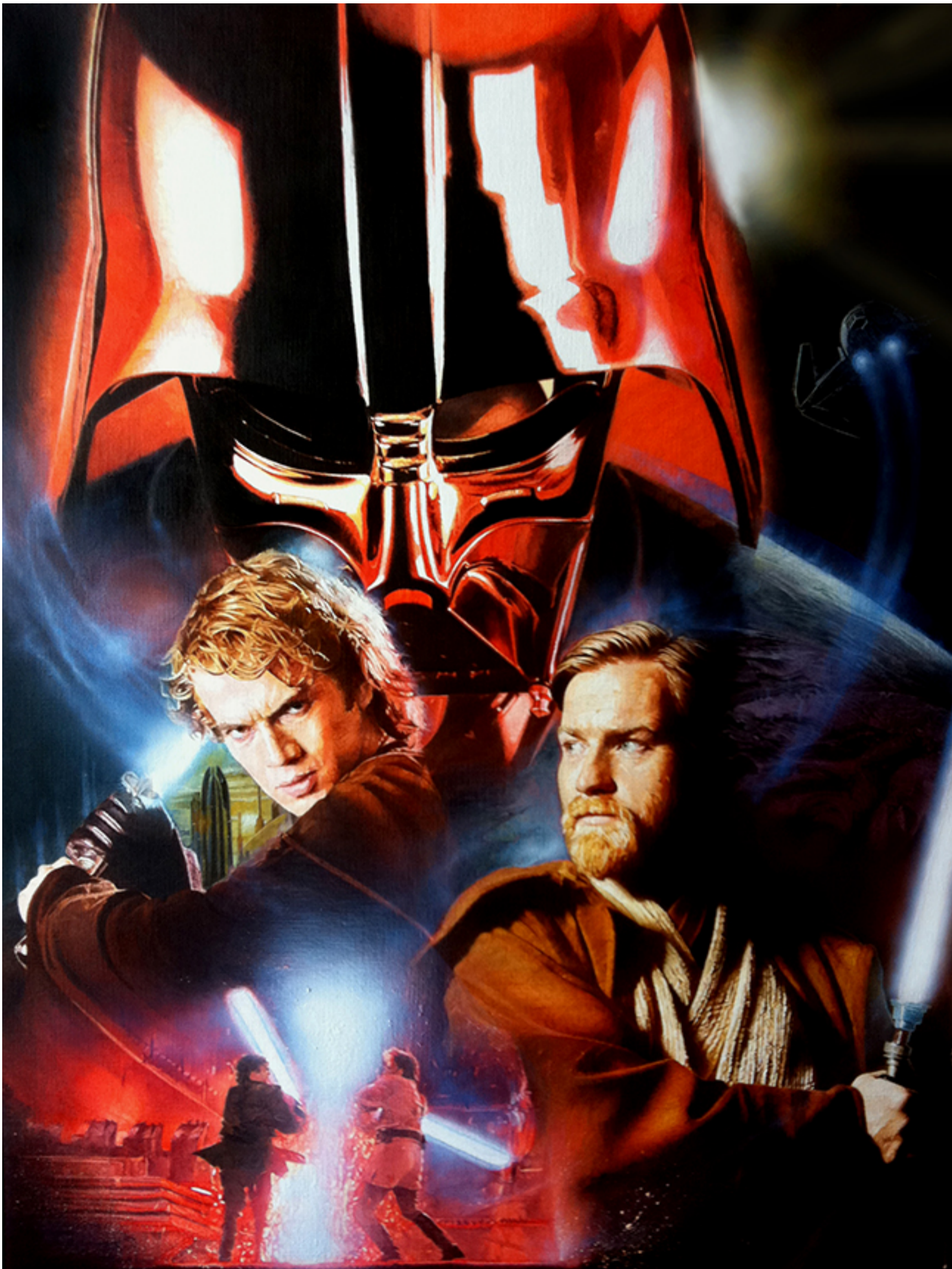
Ciara McAvoy's award-winning "Star Wars: Episode III - Revenge of the Sith" poster.